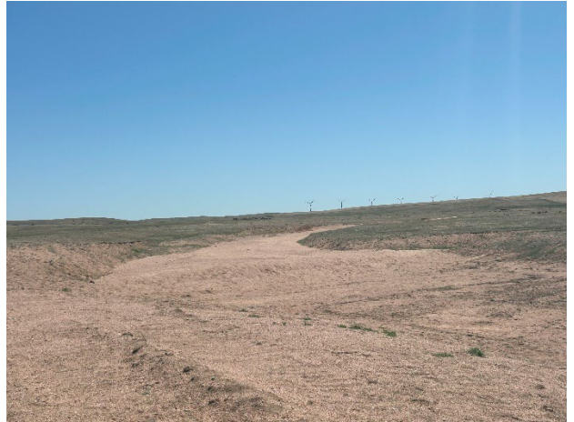
Photo 2: Representative photo of stream bed. Note similarity between bare streambed and the unseeded area.