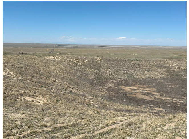
Photo 4: Western slope of the site. Vegetation is well established and similar to the surrounding cover.