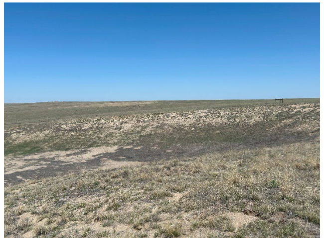
Photo 2: Least vegetated area. Note the established slopes and seeded areas.