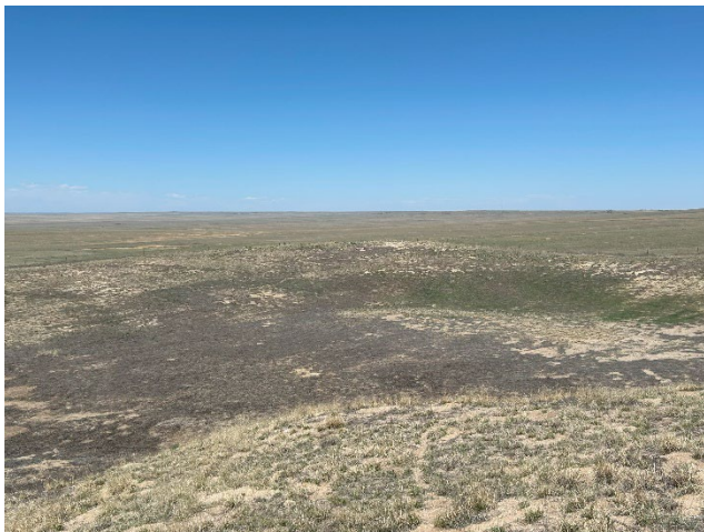
Photo 3: Pit floor with representative ground cover. Vegetation was dry at the time of inspection of covers the floor well.