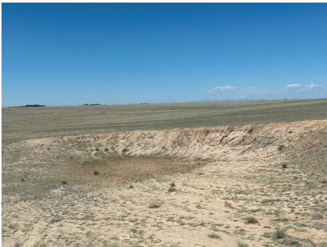
Photo 5: Problem eastern slope and sand pit floor. Additional seeding is recommended in these areas.