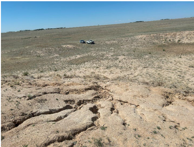
Photo 3: Problematic western slope. Moderate rilling visible due to seasonal storm events.