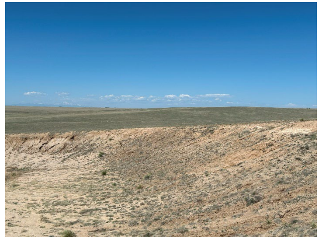
Photo 2: Established slope (right) compared to bare areas due to washout (left).