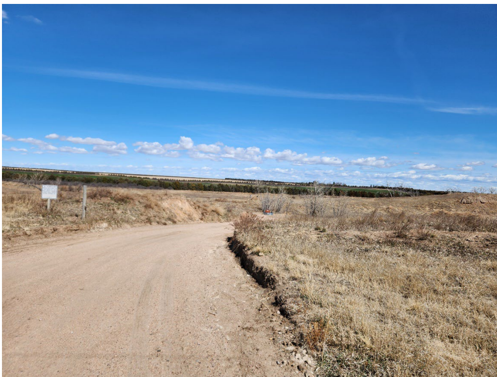
Photo 2. Mine entrance, looking north.