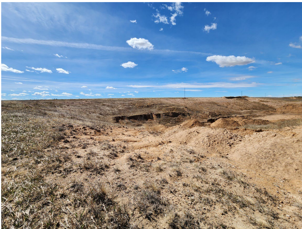
Photo 6. Mined pit, looking west.