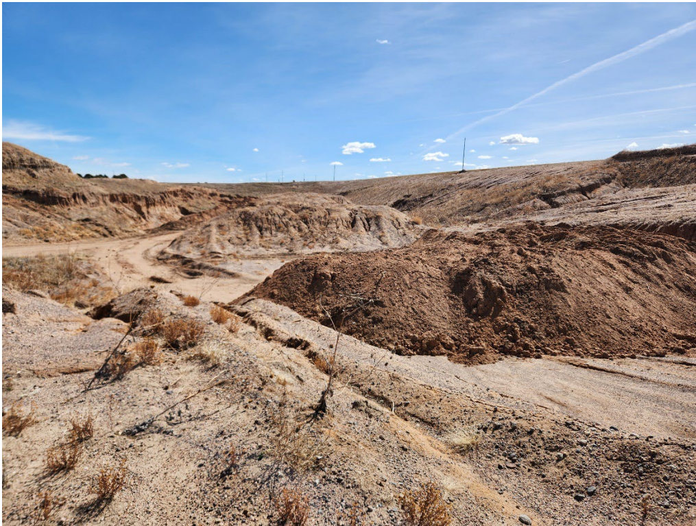
Photo 4. Pit floor with material stockpiles, looking east.