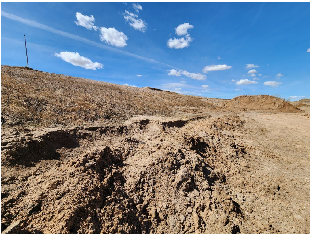
Photo 5. Pit floor, looking west.