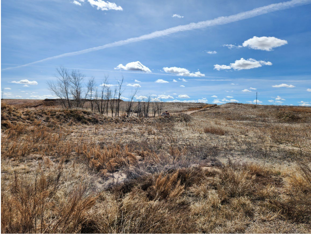
Photo 3. Northwest corner of the site, looking southeast.