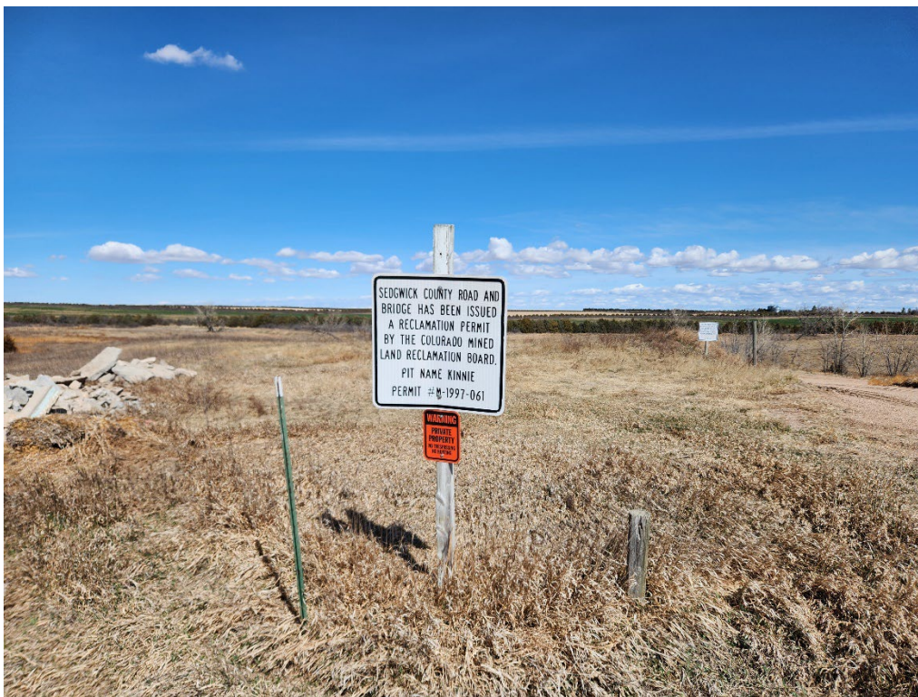
Photo 1. Mine entrance sign, looking north.