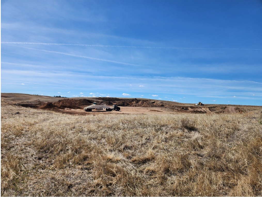
Photo 5. Mined pit, looking east.