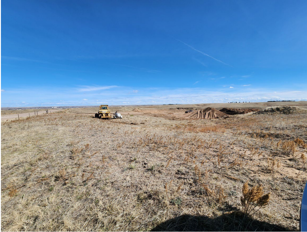
Photo 3. Undisturbed land just south of the pit, looking north.