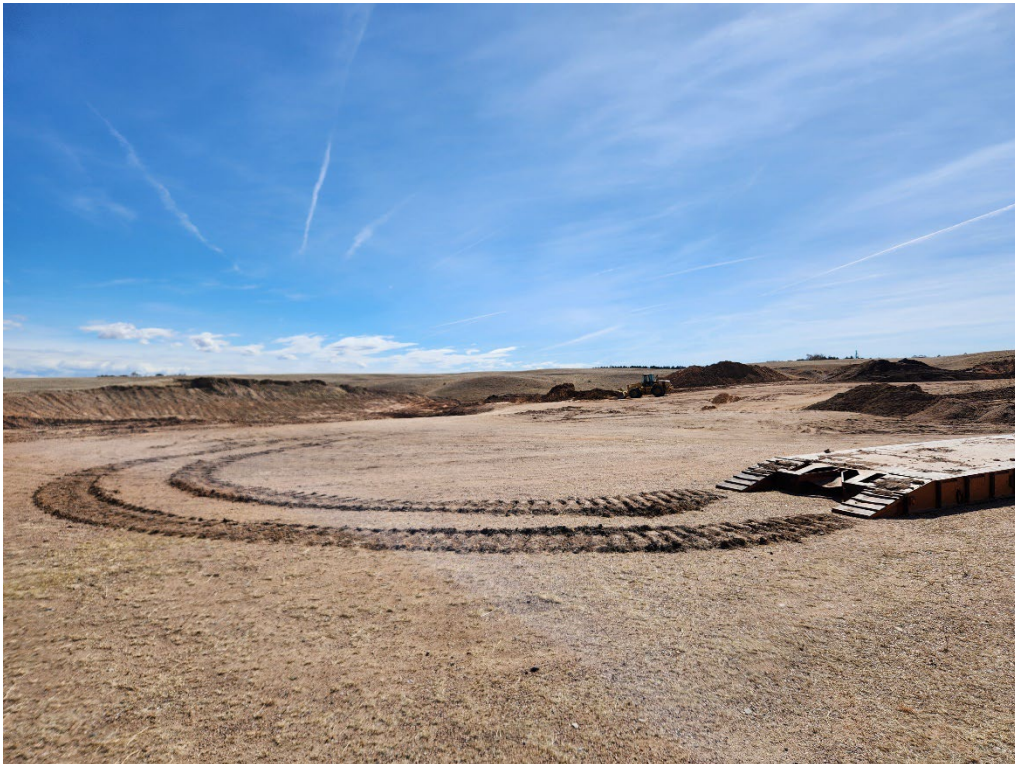
Photo 6. Mined pit, looking north.