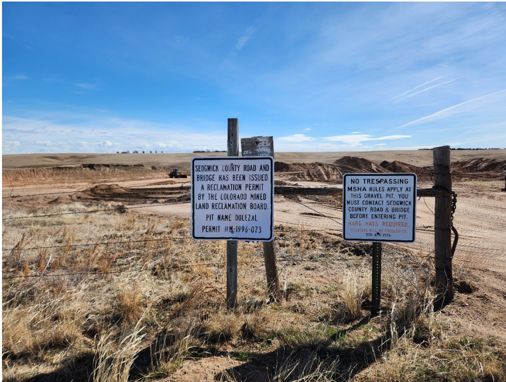
Photo 1. Mine entrance sign, looking east.