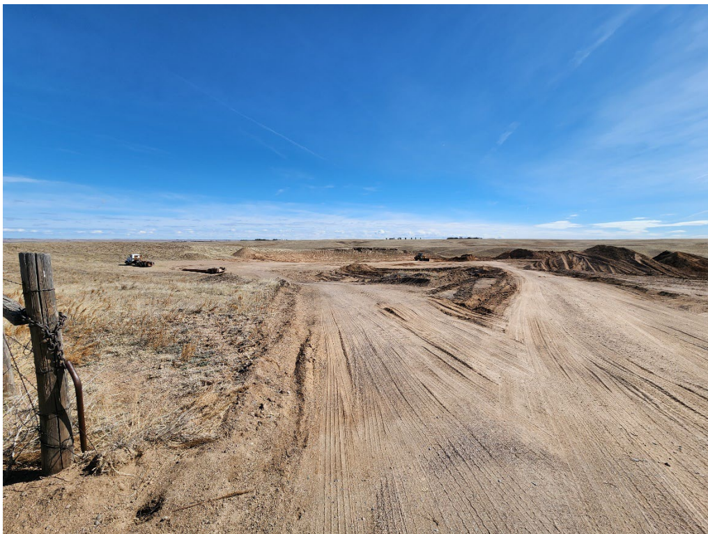
Photo 2. Mine entrance, looking east.