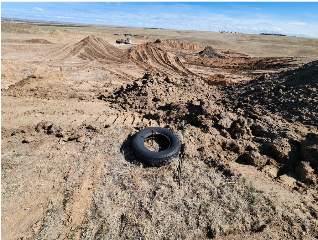
Photo 4. Corner permit boundary marker south of the pit, looking north.