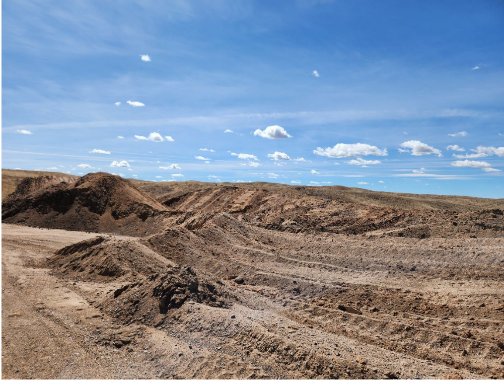
Photo 3. Recent disturbance on site, looking southwest.