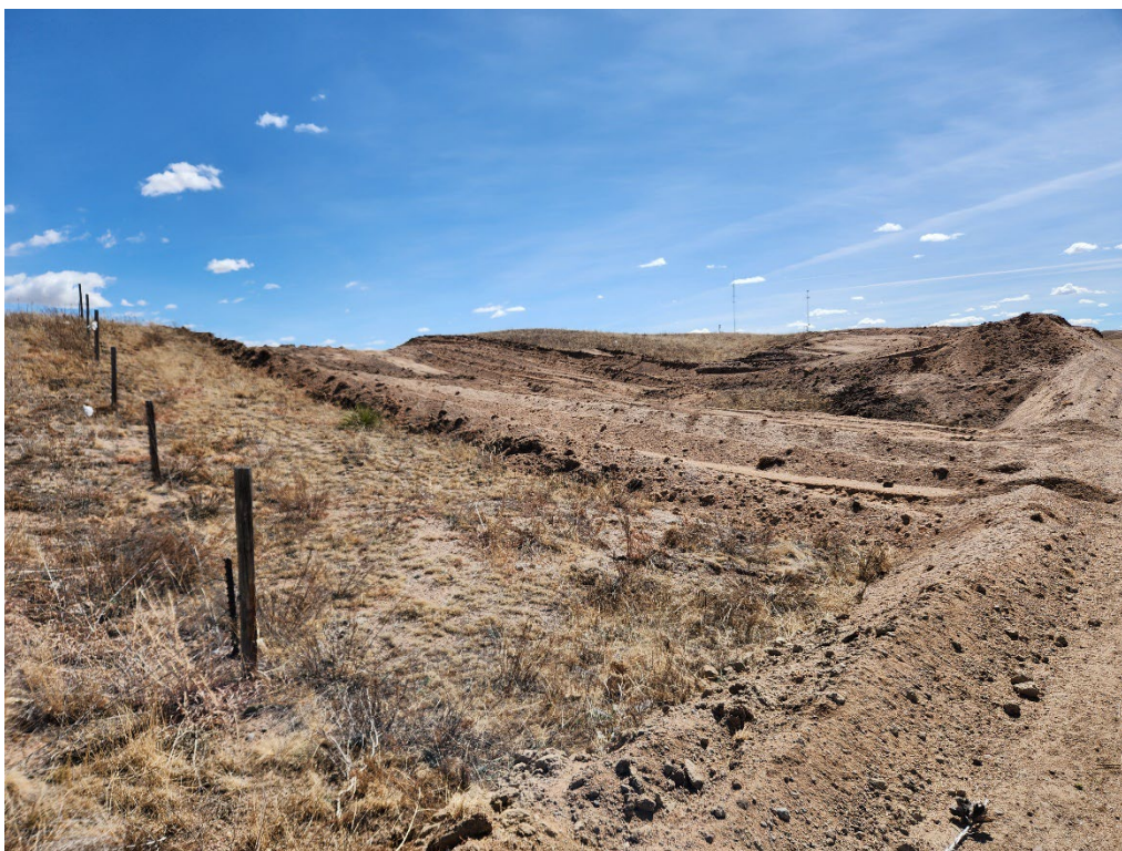
Photo 2. Moved material near the site entrance, looking south.