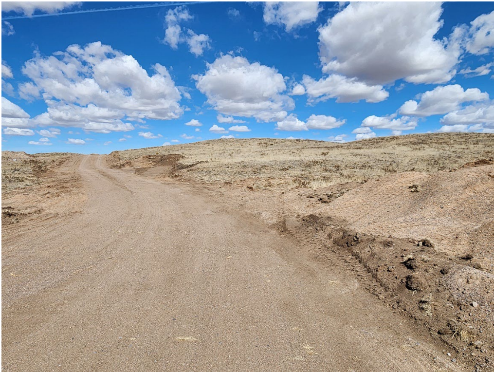
Photo 4. Dirt road that leads in/out of the site, looking north.