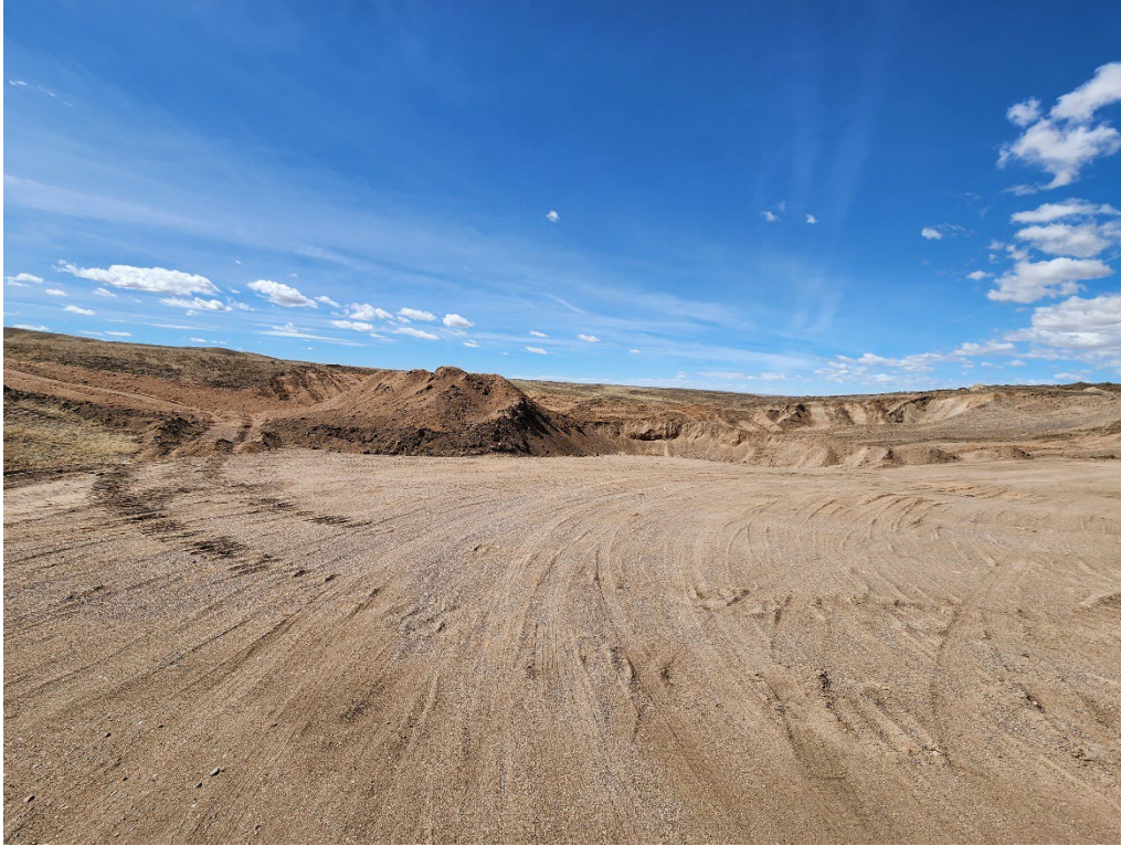
Photo 5. Beginnings of the pit floor, looking west.