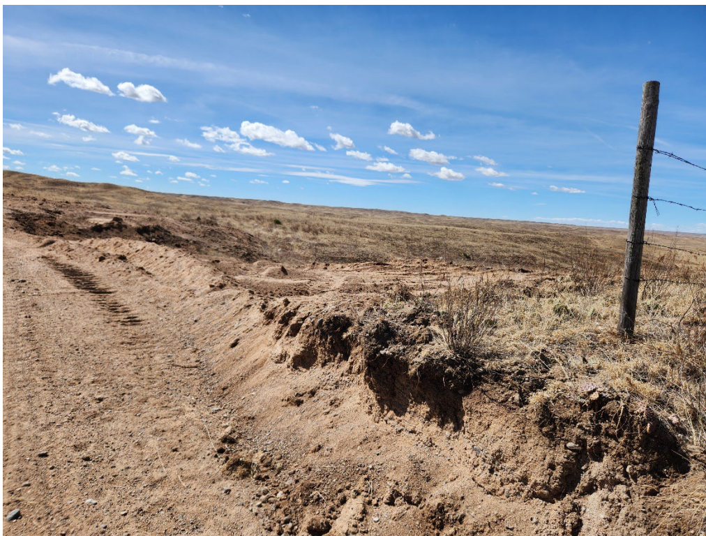
Photo 1. Mine entrance, looking south.