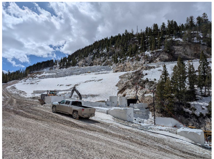
Wasterock landform above Franklin Quarry