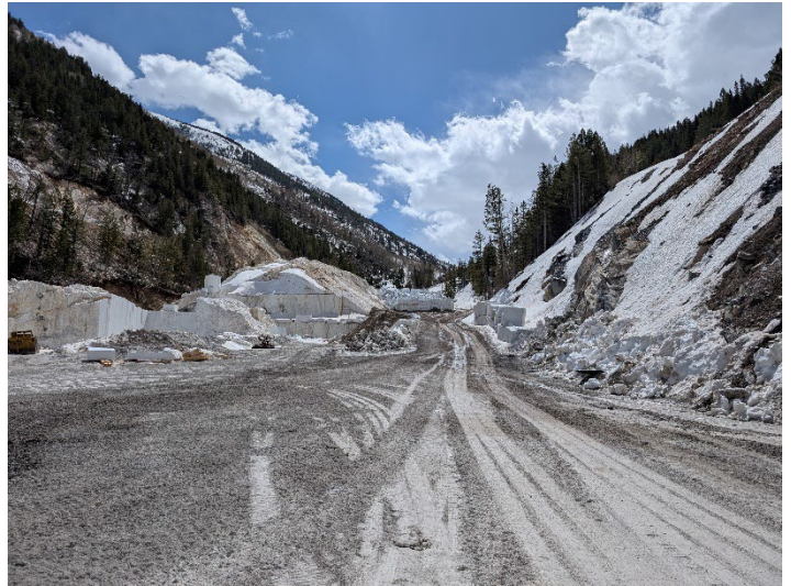
Franklin Quarry area