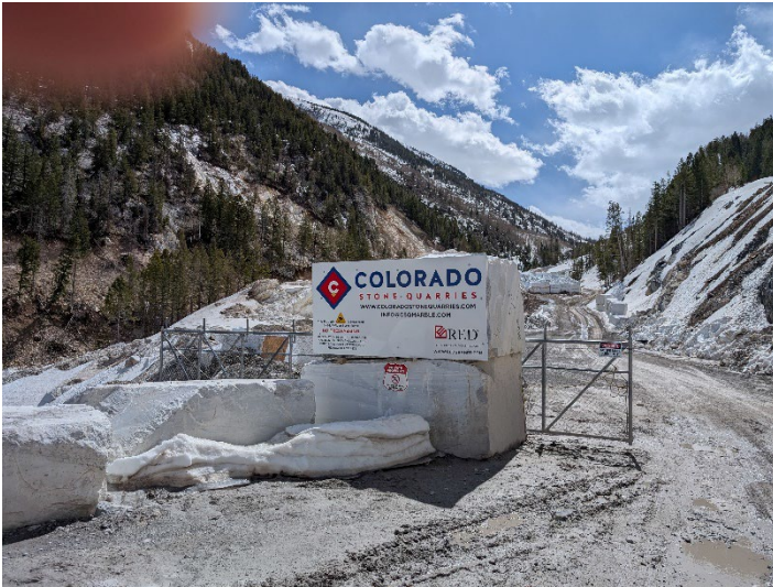
Site entrance secured by locked gate