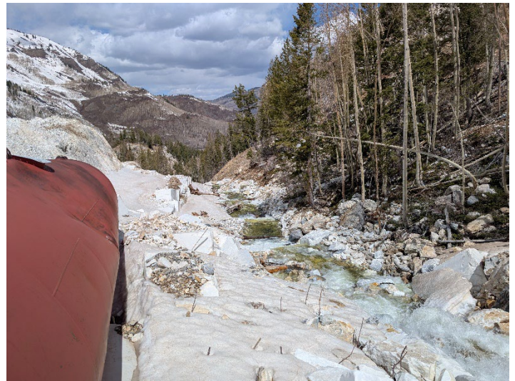
Yule Creek constructed eastern channel