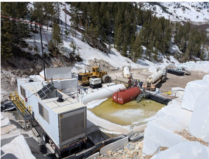
Gensets and fuel storage in Franklin area