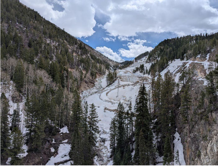
View of Yule Creek eastern channel