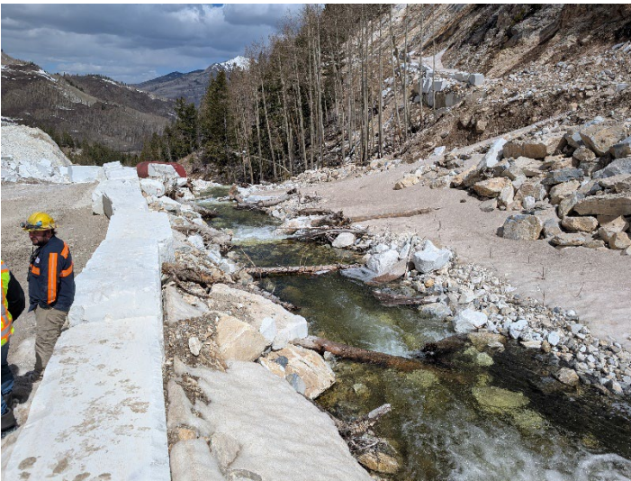
Yule Creek constructed eastern channel