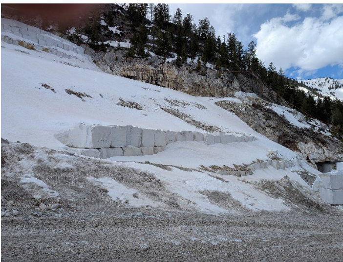
Wasterock landform above Franklin Quarry