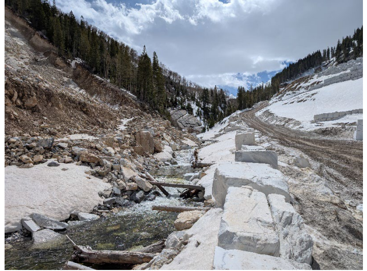
Yule Creek constructed eastern channel