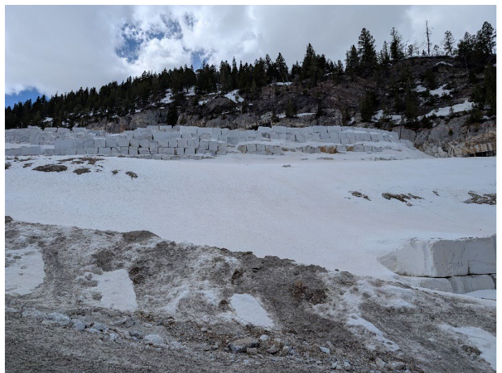
Wasterock landform above Franklin Quarry