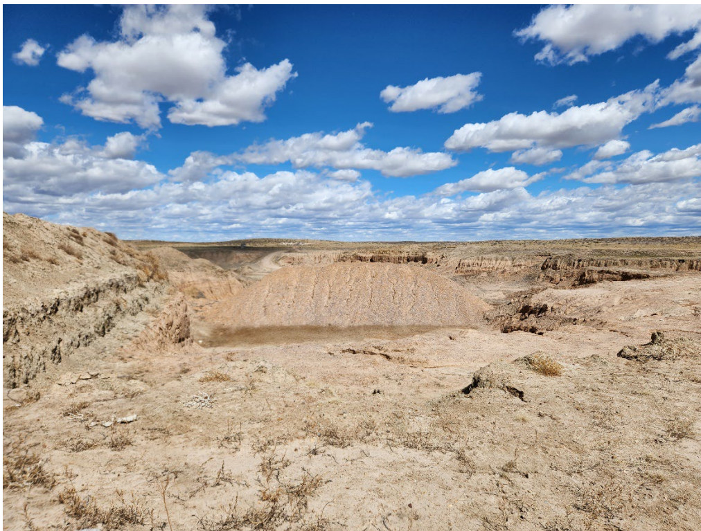
Photo 7. The mined pit with a product stockpile on the floor, looking north.