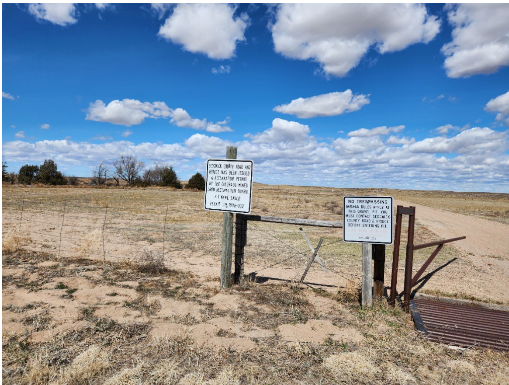
Photo 1. Mine entrance sign, looking north.