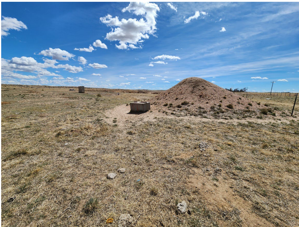
Photo 5. Concrete block in the northwest corner, possibly marking the boundary corner. The topsoil stockpile is located next to it, looking south.