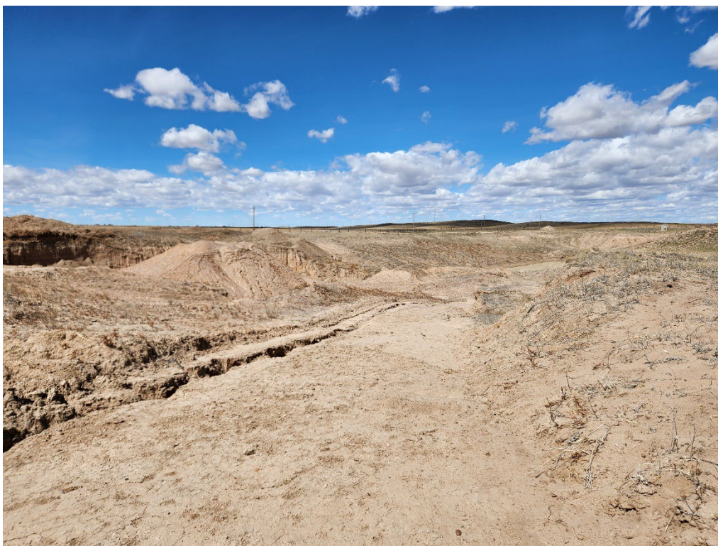
Photo 8. The mined pit, looking northwest.