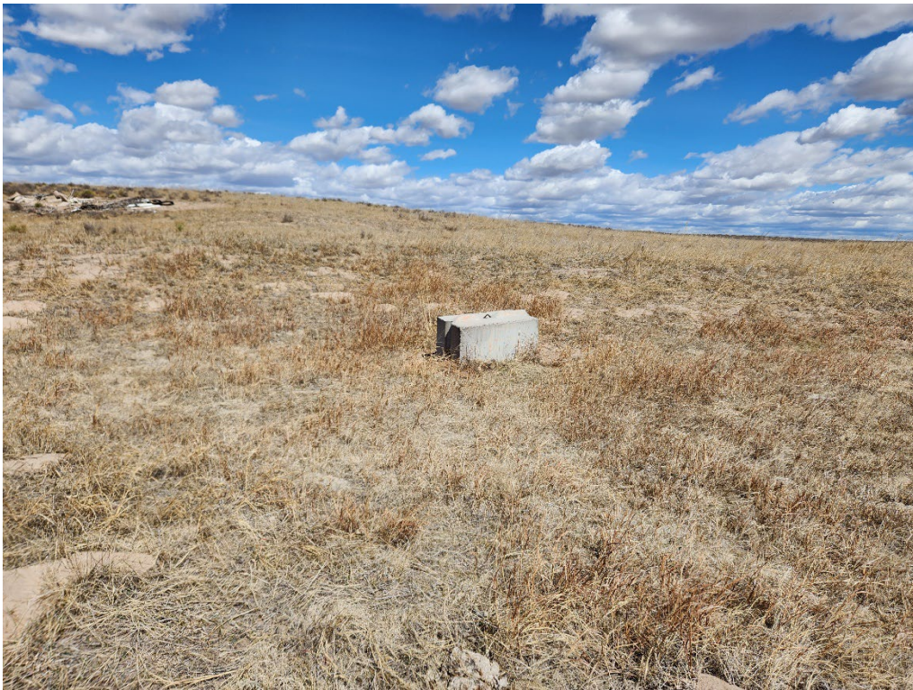
Photo 4. Concrete block possibly marking the northeast boundary corner, looking northeast.