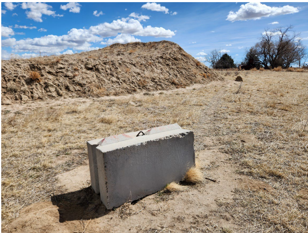
Photo 6. Concrete block in the southwest corner, possibly marking the permit boundary corner, looking south.