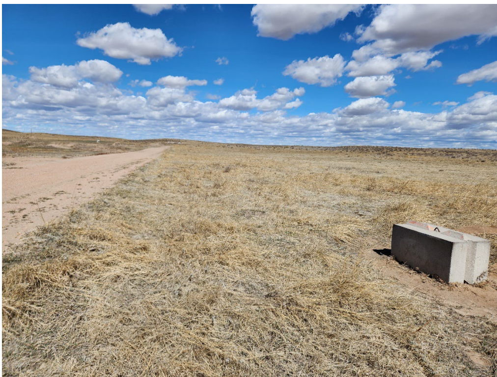
Photo 2. Possible southeast permit boundary corner marked by concrete block, looking north.