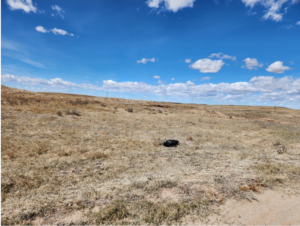
Photo 3. Possible southeast permit boundary corner marked by tires and metal posts, looking north.