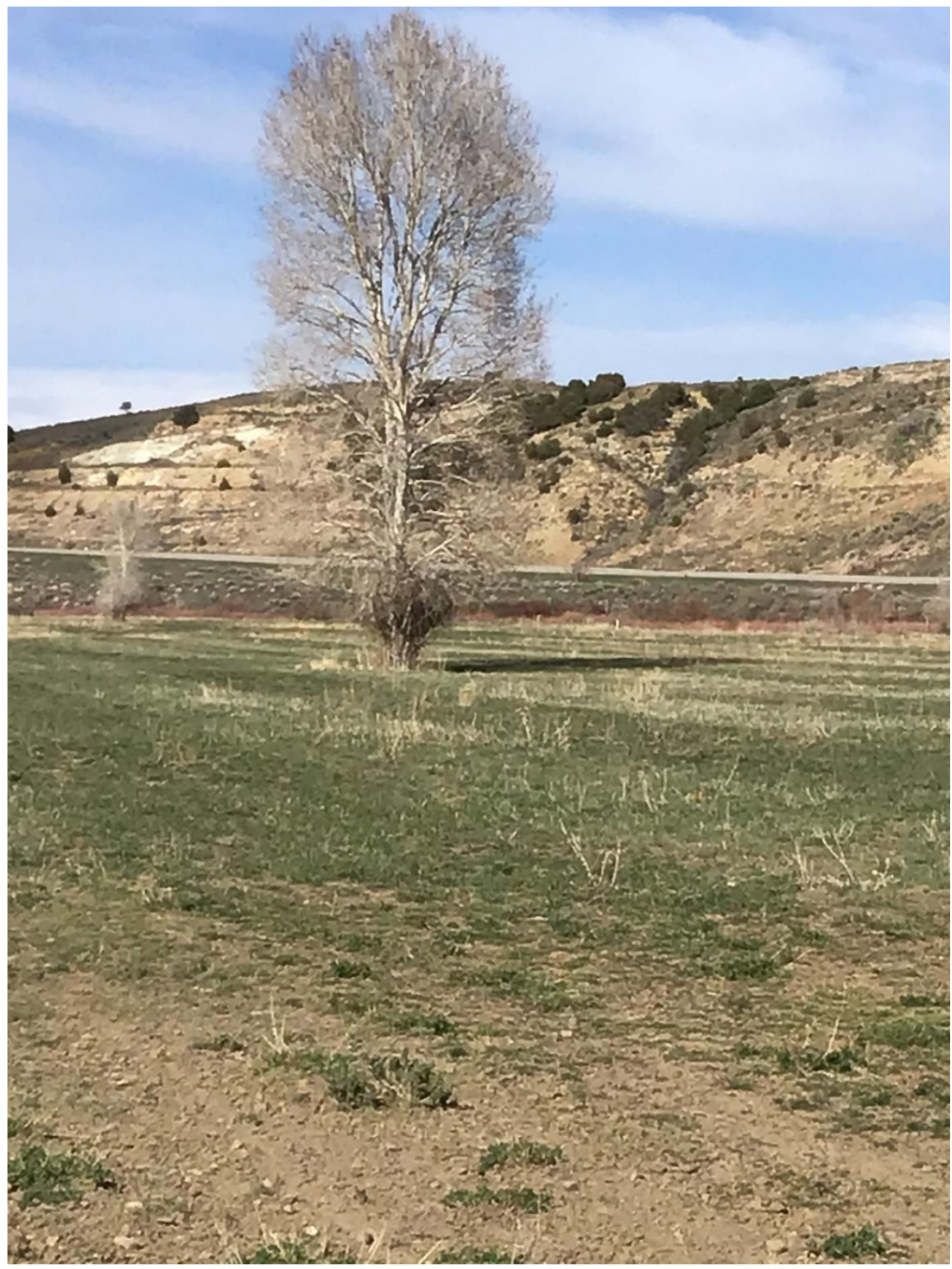
Photo 6: Cropland area looking north. A couple of sparsely vegetated patches exist.