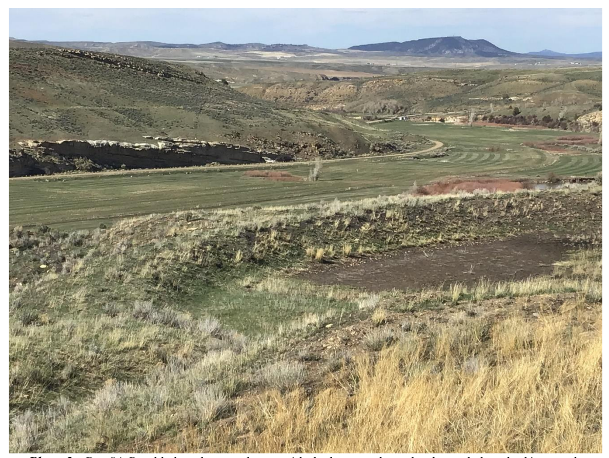
Photo 3: Dry 9A Pond below the portal area with the harrowed cropland area below, looking north.