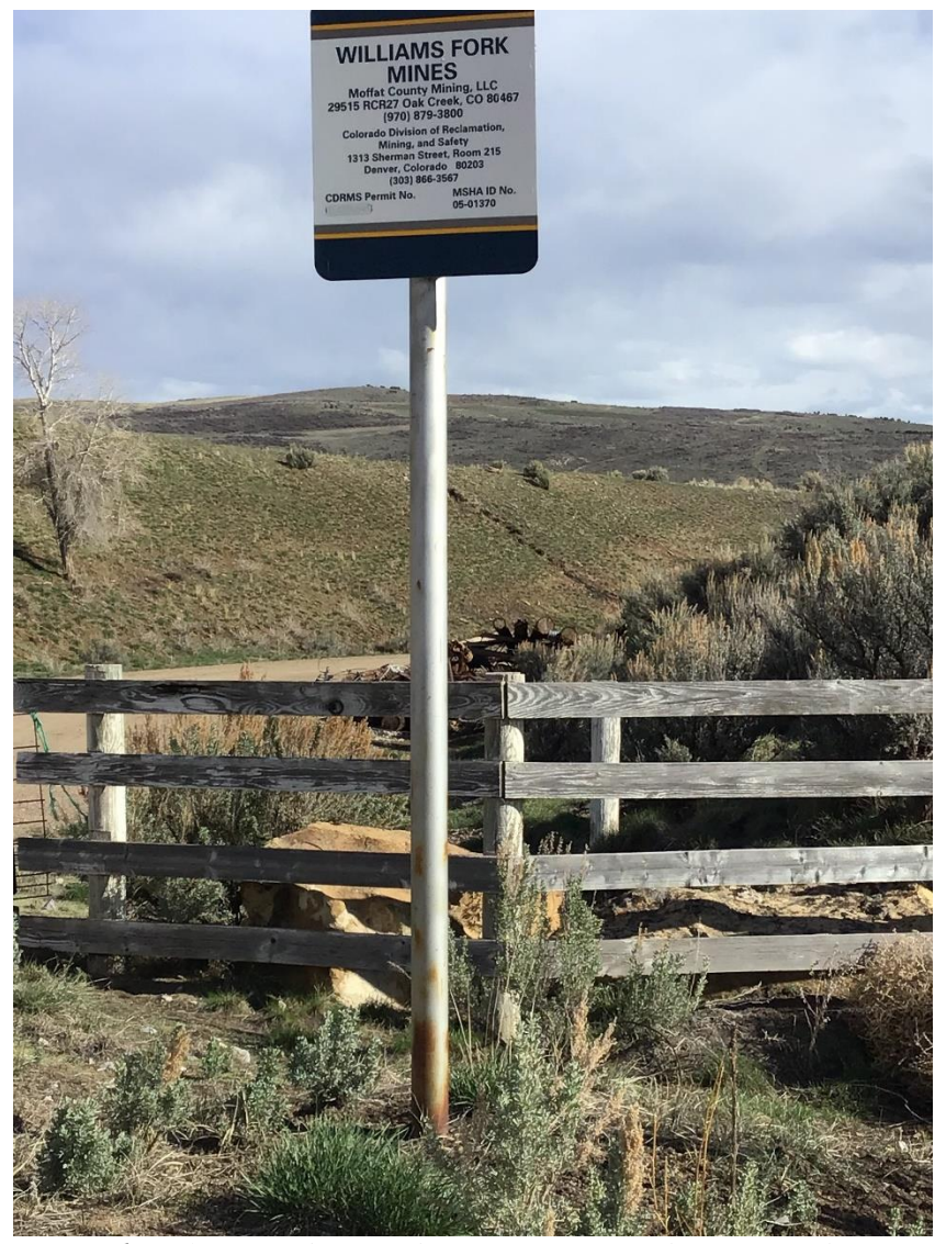
Photo 1: Mine Id sign at the entrance form Highway 13 South. Overview of the Williams Fork mine site, located on the left of the photo, looking south.