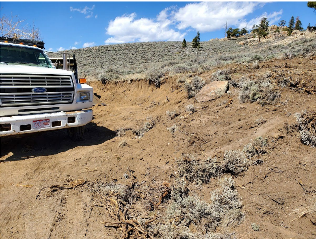
Photo 4: View to the west of excavation for horse shelter. Excavation will continue to the north.