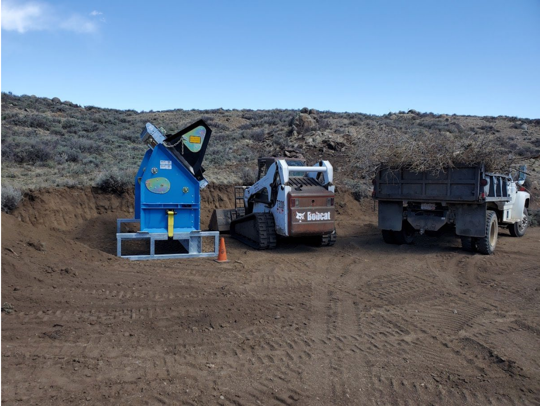
Photo 1: View to the north of excavation along roadway with screen, skidloader, and truck. To be location of shelter for horses.