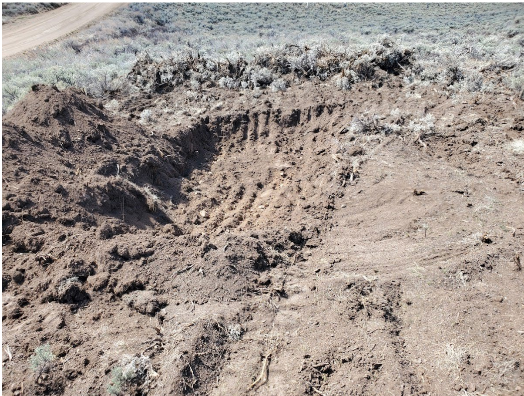
Photo 6: View to the west of excavation for well to water livestock.