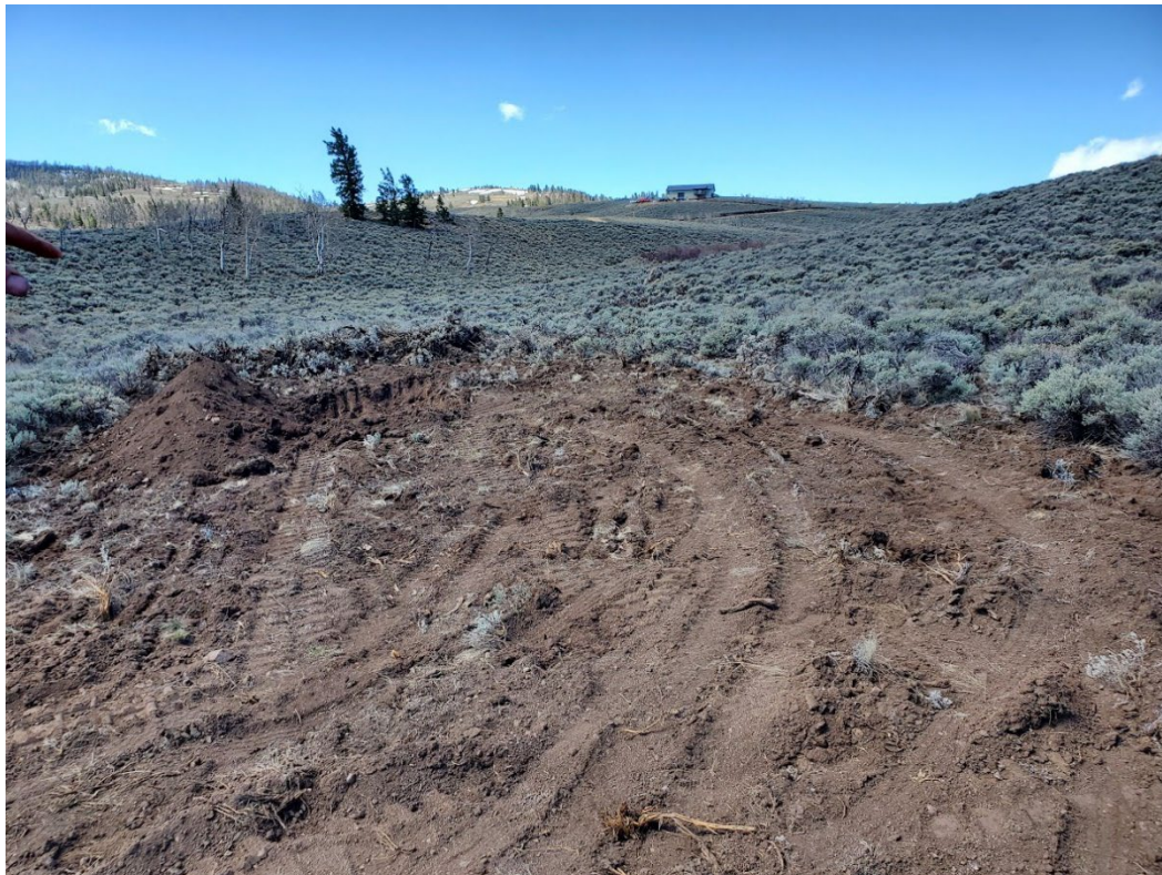
Photo 2: View to the west of grading done near roadway to create horse corral.