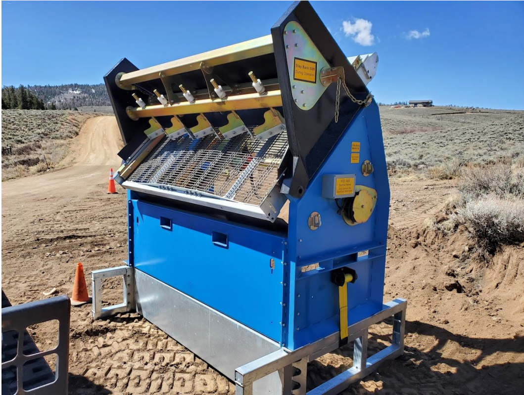
Photo 3: View to the north of screen. Screen looks new with no evidence of that it has been used.