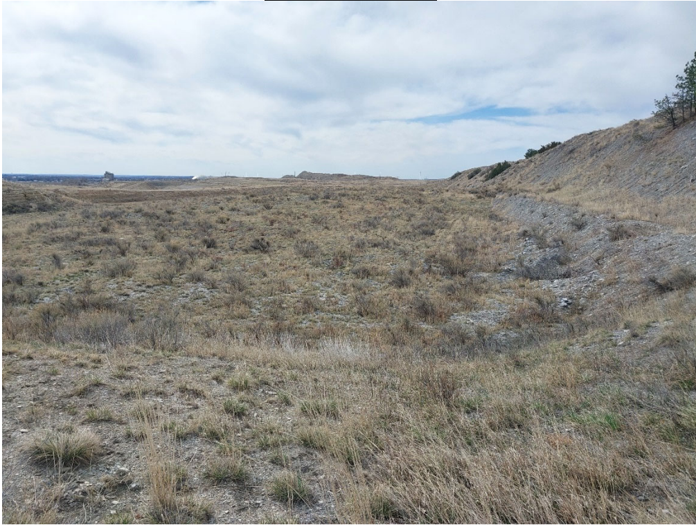
Photo #1: View of the permit area, looking to the south from the north boundary line.