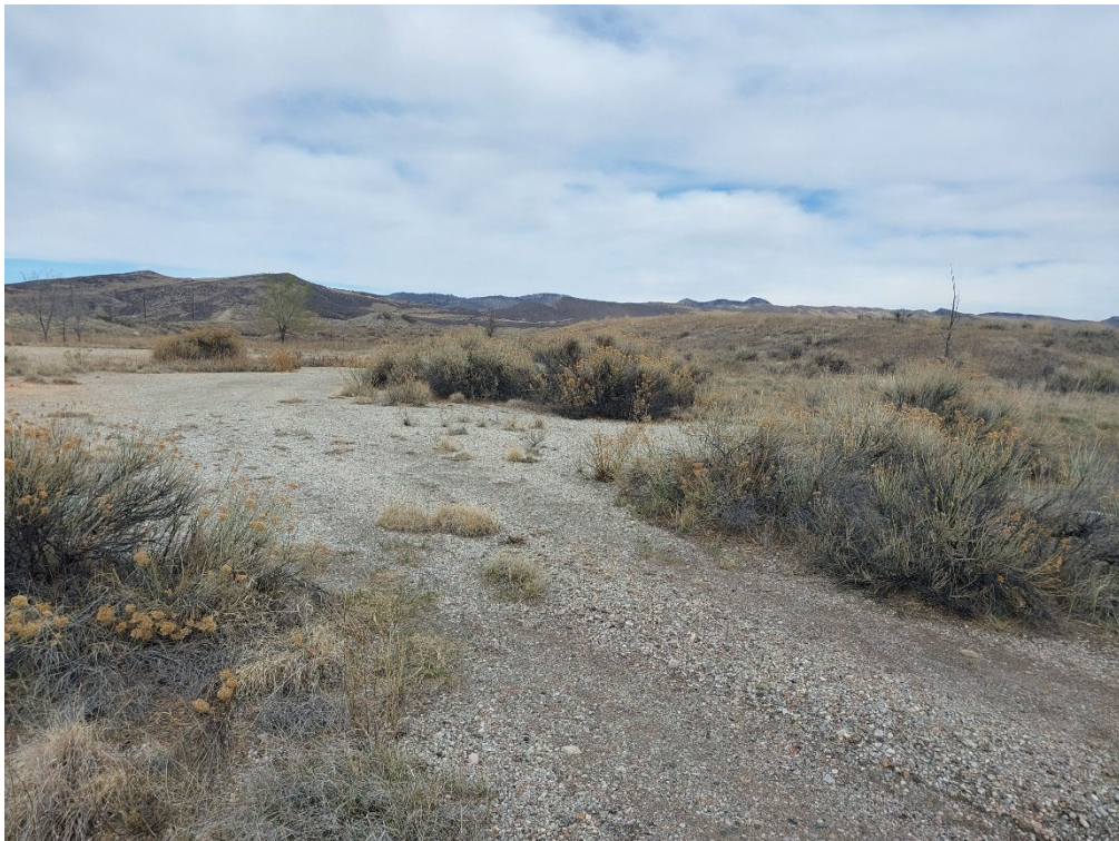
Photo #2: View of the affected area, looking to the north from the southern portion of the permitted area.