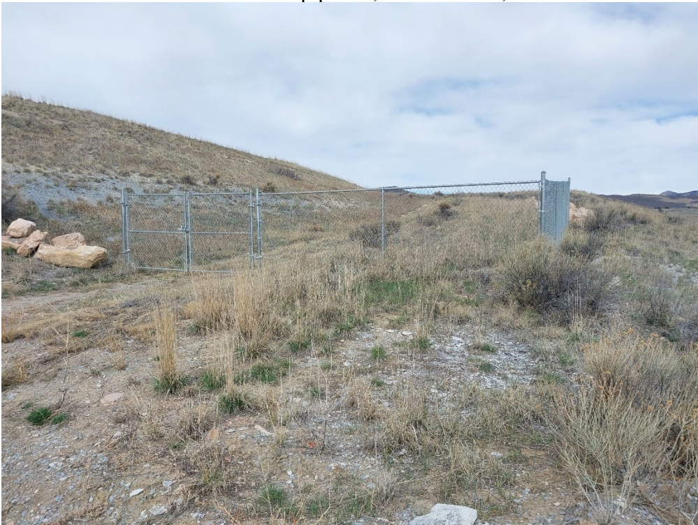
Photo #6: View of the fence and gate blocking the two-track trail on the property, looking north.