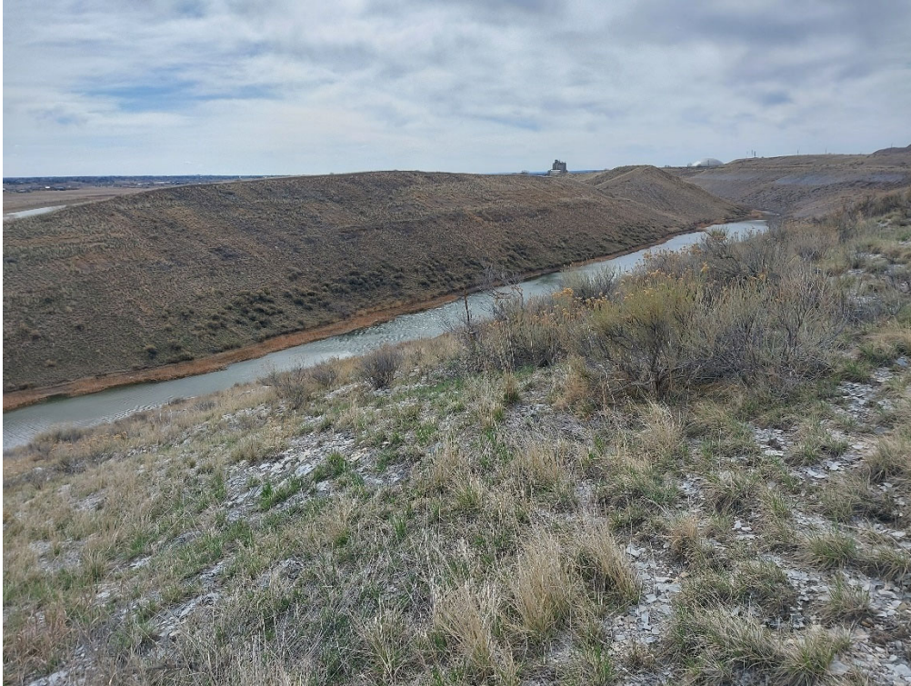
Photo #3: View of Pond C, situated along the southeast of the permitted area, looking to the southeast.