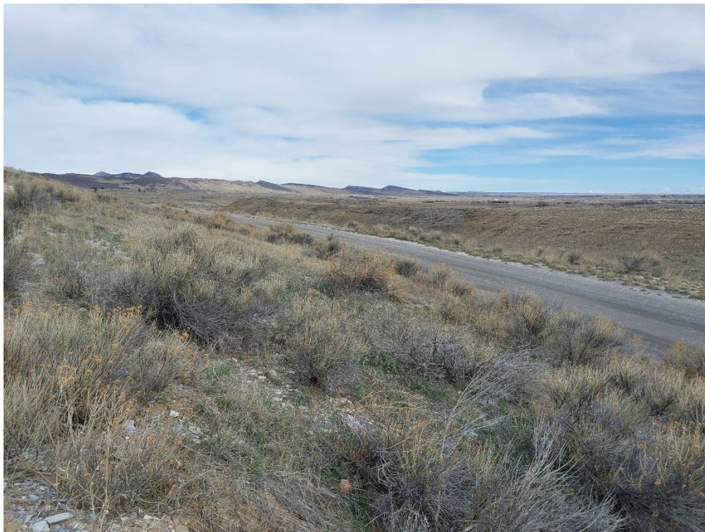
Photo #4: View of the road running north-south through the approximate center of the permitted area, looking to the northeast.