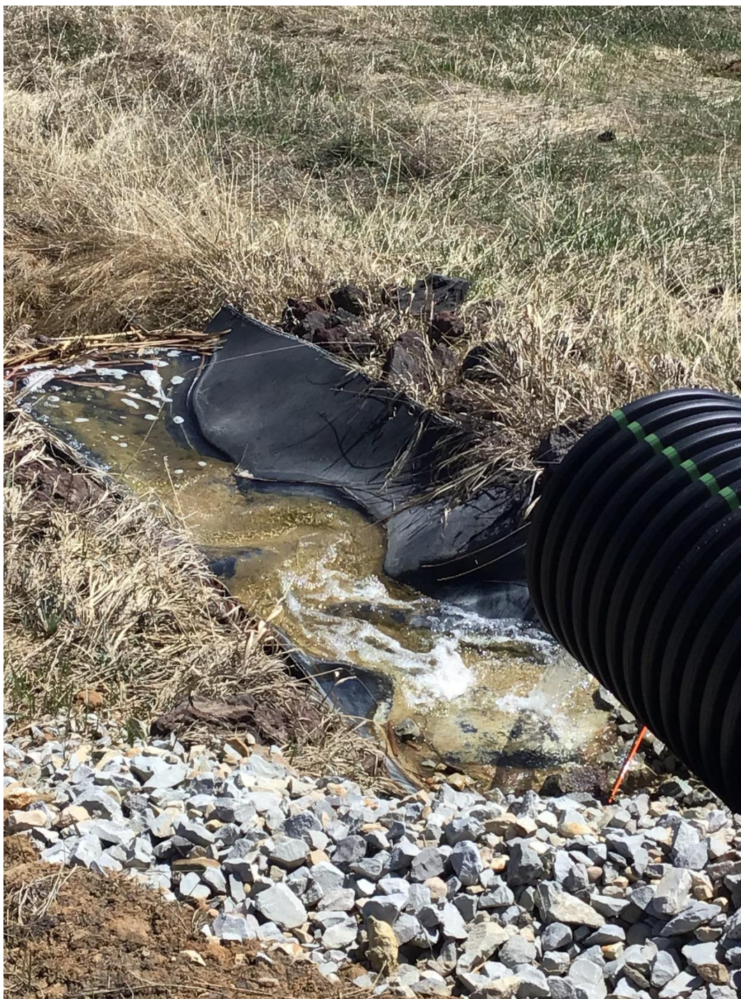
Photo 2: Pond 10, new culvert through dam discharging clear water to flume.

Number of Partial Inspection this Fiscal Year: 7