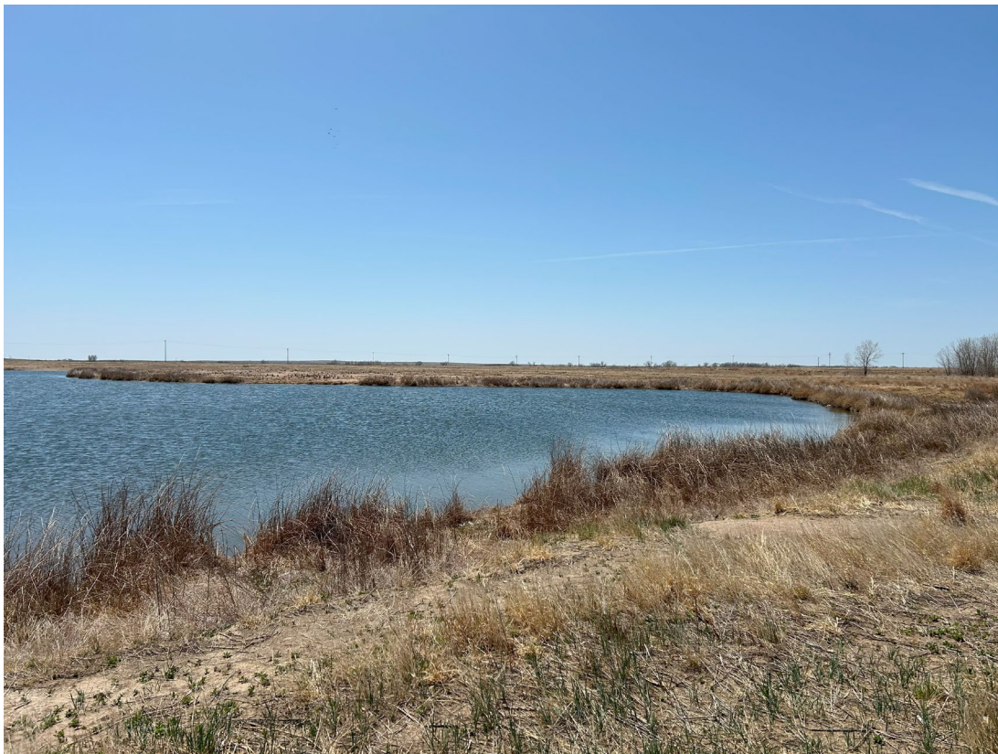
Photo 6. Northernmost shoreline, facing west.