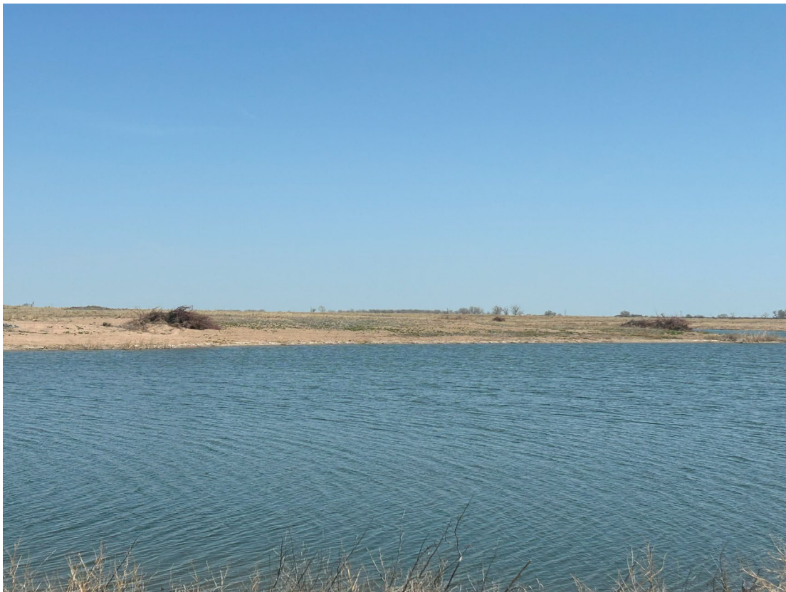
Photo 8. Two piles of removed Tamarisk seen across the CPW fishing pond, facing east.