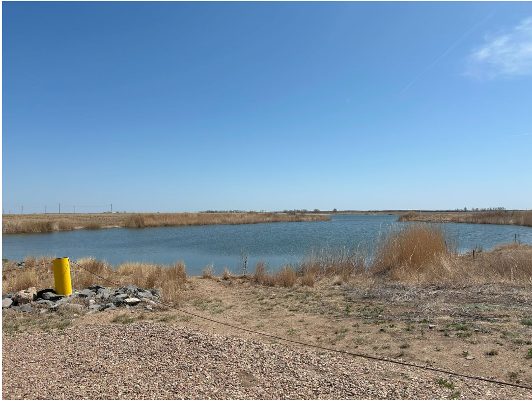
Photo 7. Standing at the CPW fishing pond parking area in the western portion of the site, facing southeast.