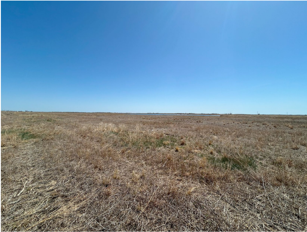
Photo 5. Revegetation in a central portion of the site, facing southeast.