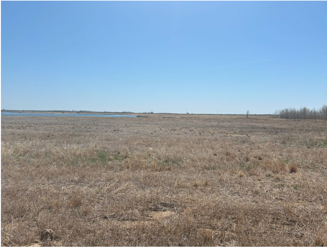
Photo 3. Facing south, revegetation in the northern portion of the site.