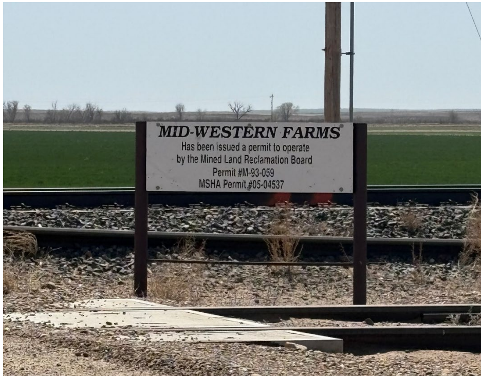
Photo 1. Mine identification entrance sign, facing south.