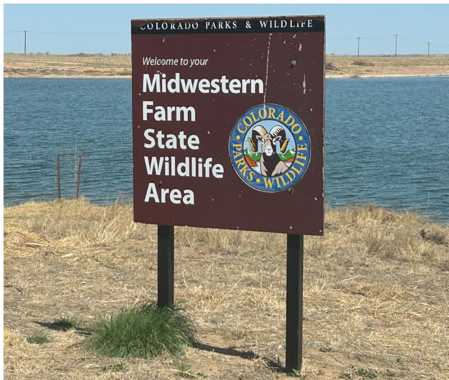
Photo 2. CPW Wildlife Area sign, facing east.