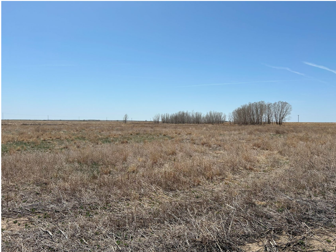
Photo 4. Revegetation in the northern portion of the site, facing southwest.