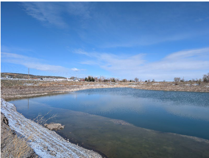
View from south side of pit