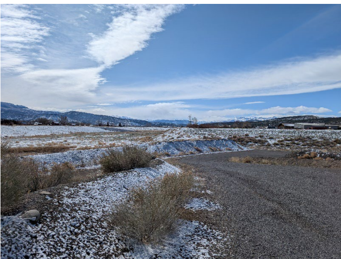
Topsoil stockpiled along southern permit boundary