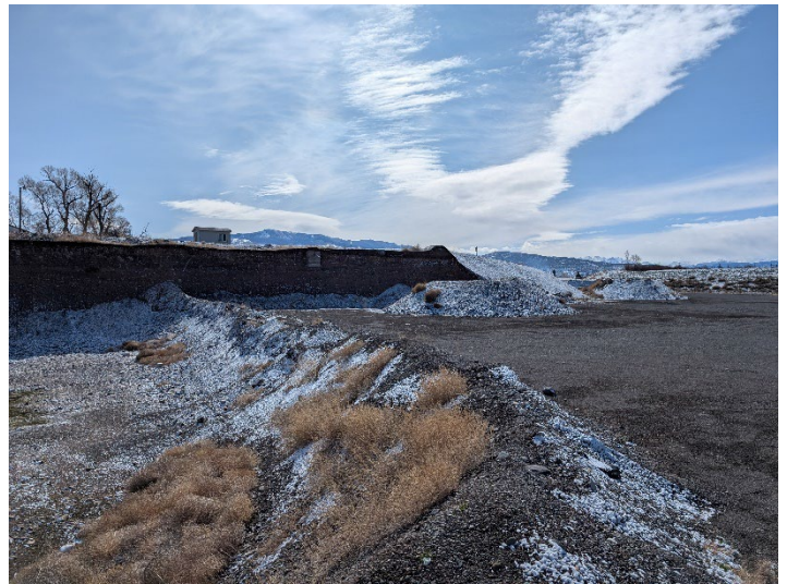
Current mining area in east side of Phase 3