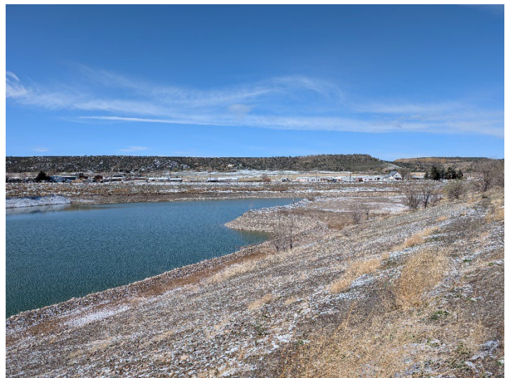
View from northeast side of pit