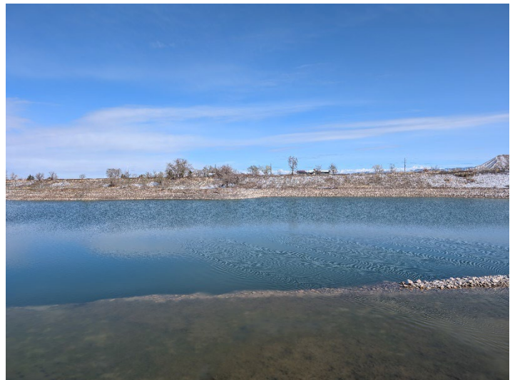
View from south side of pit