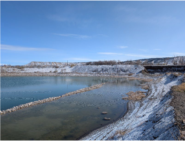
View from south side of pit