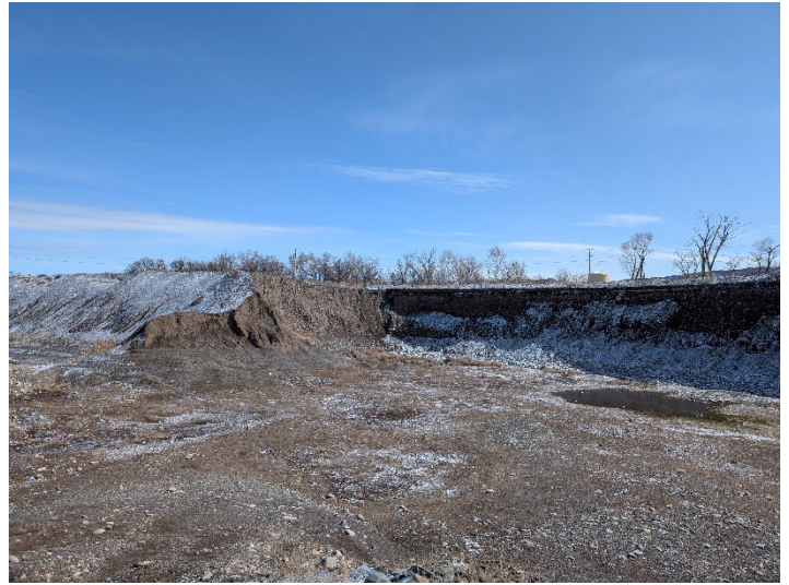
Current mining area in east side of Phase 3