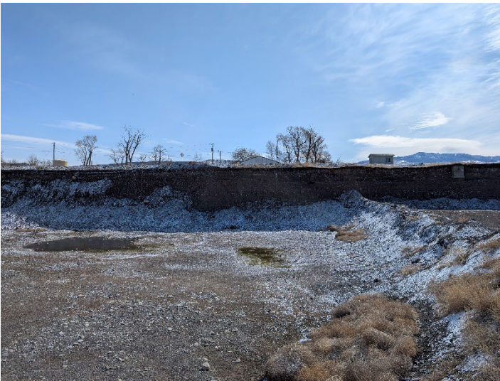
Current mining area in east side of Phase 3