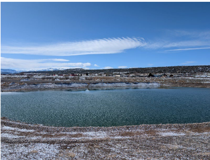
View from northeast side of pit