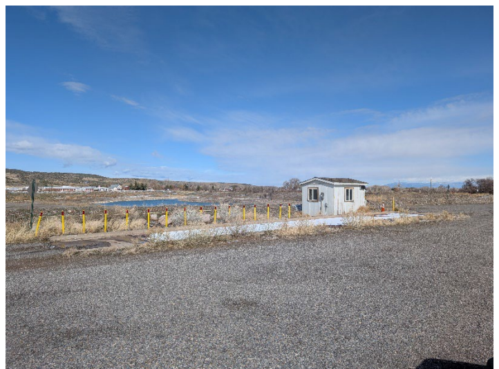
Scale on east side of pit