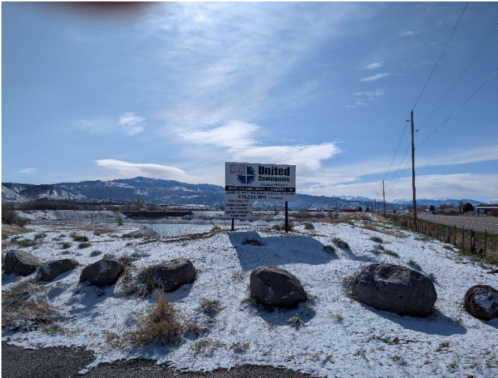
Mine id at site entrance