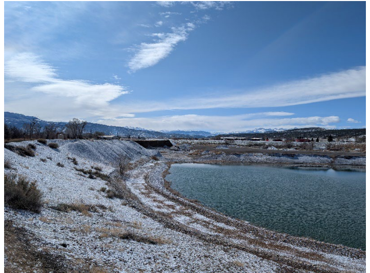
View from northeast side of pit