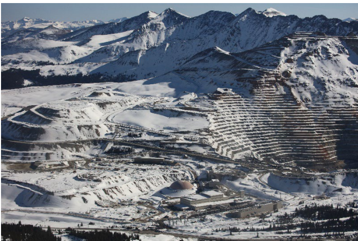
North 40 and McNulty OSF

The North 40 and McNulty OSF's were observed. No abnormal conditions were noted. OSF's appear to be functioning within the established design criteria.