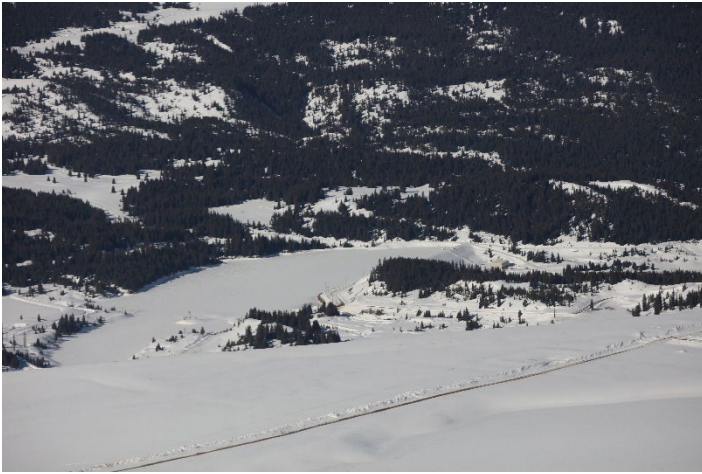
Robinson Lake/1 Dam

The Mayflower TSF and 5 Dam, Tenmile TSF and 3 Dam, Robinson TSF and 1 and 2 Dams, Robinson Lake, Eagle Park Reservoir and 4 Dam were observed. No abnormal conditions were noted. TSF's appear to be functioning within the established design criteria.