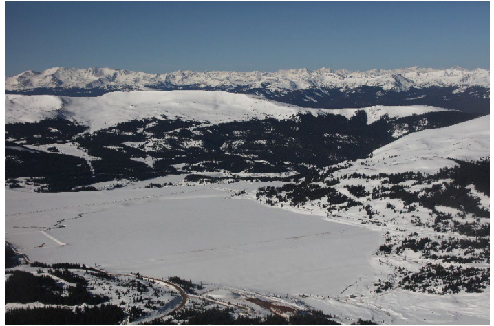
Tenmile Pond/3 Dam