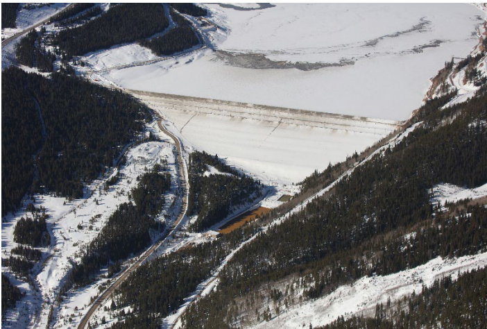
Mayflower TSF/5 Dam