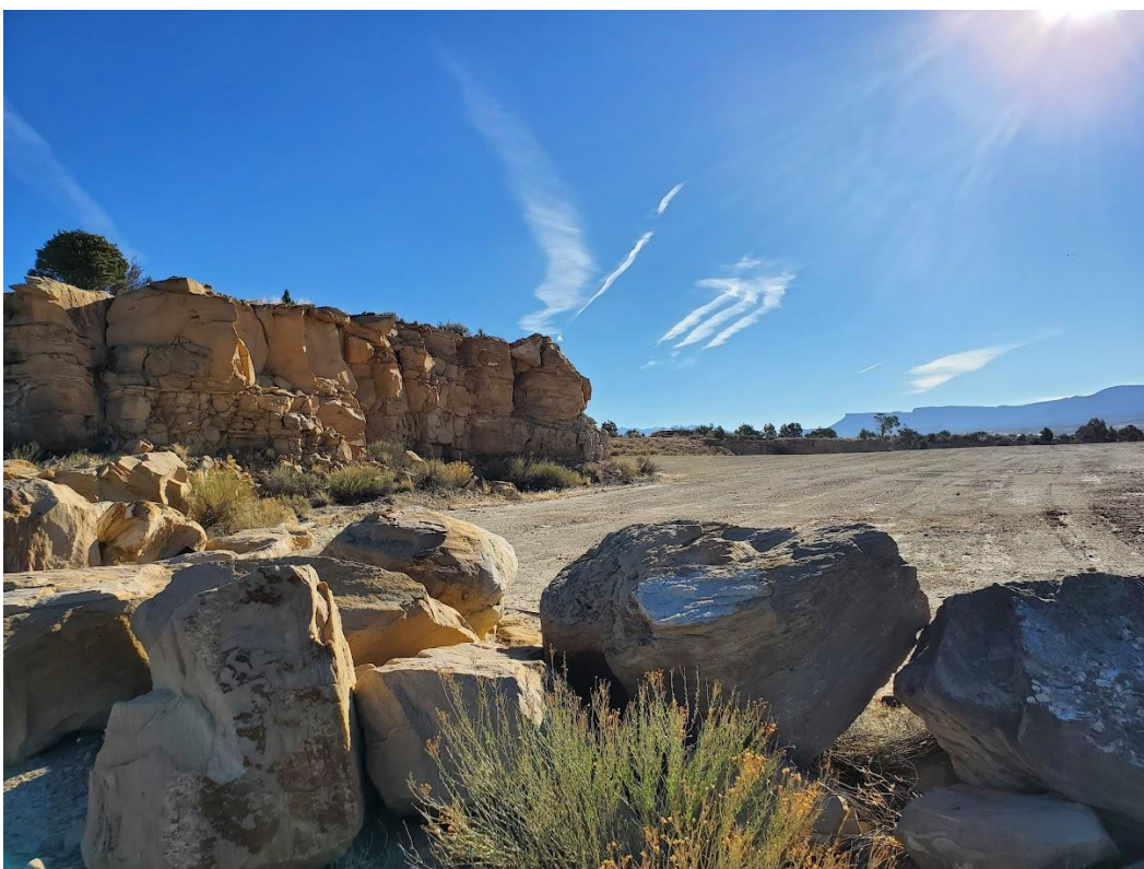
Photo 2: View to the northeast of rock outcrop on western end of the upper bench within the permit area.