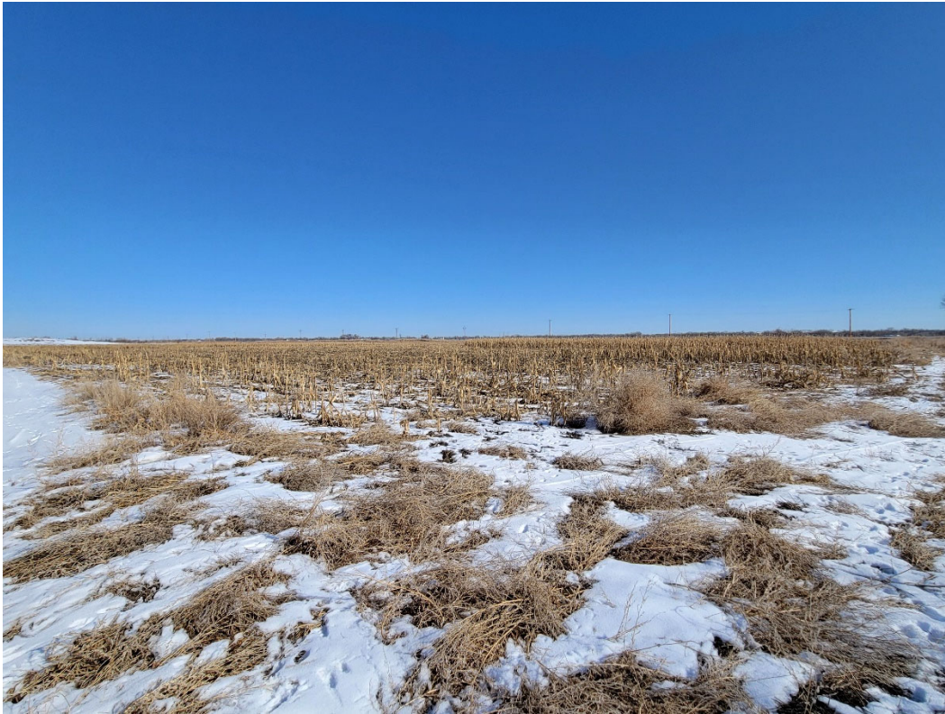
Photo 17: Looking northeast across the agriculture field in the Northwest area.