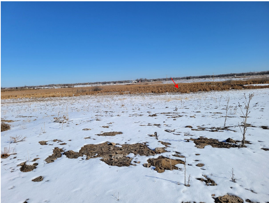
Photo 18: Wetland vegetation associated with Little Dry Creek observed along the northeastern side of the Northwest area.