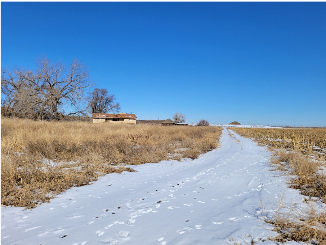
Photo 16: Looking north from the entrance to the Northwest area. An abandoned home and outbuildings were observed. A cornfield was observed on the left side of driveway.