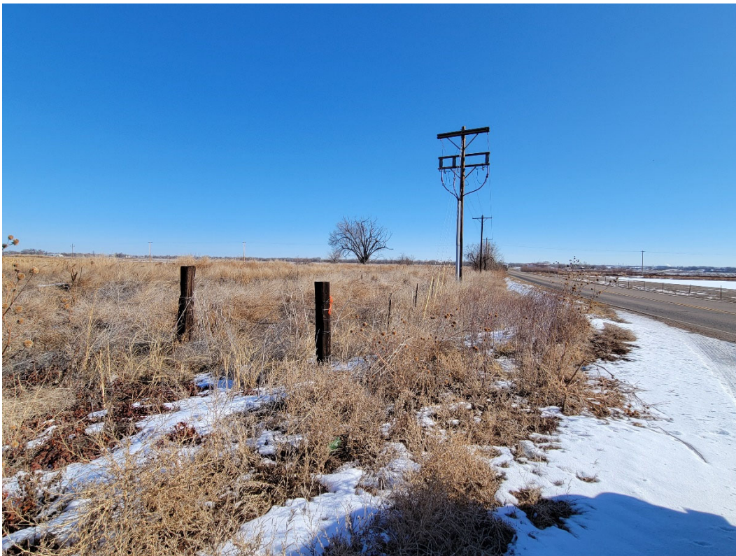
Photo 20: Looking at utilities along the southern boundary of the Northwest area. A PVIC water return pipeline is installed in this area to drain a reservoir west of the site. Utilities were also observed within 200 feet of the proposed mining area.