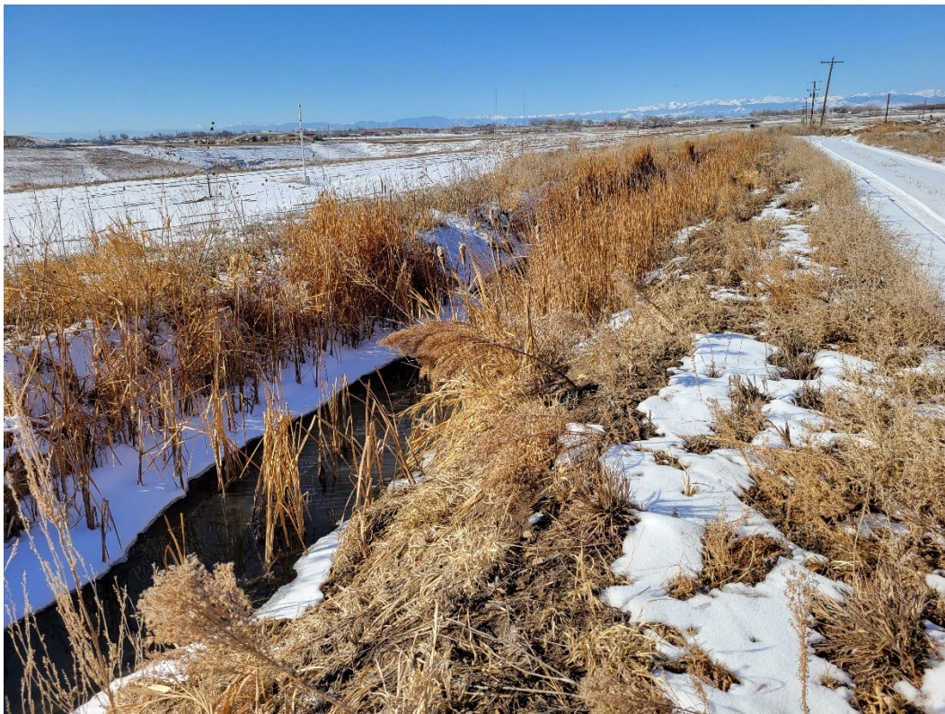
Photo 2: Lupton Bottom ditch on the south end of the proposed Northeast area. The Blue-Ribbon mining phase in the existing permit area is on the left side of the ditch. United Power lines observed between the parcels.