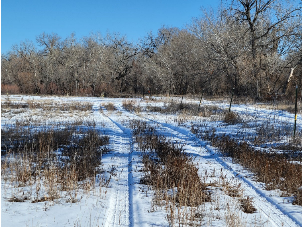
Photo 10: Looking down the eastern boundary of the Northeast #1 area. Mining will occur within 400 feet of the South Platte River in this area. The operator submitted a bank armoring plan for to address flooding concerns.