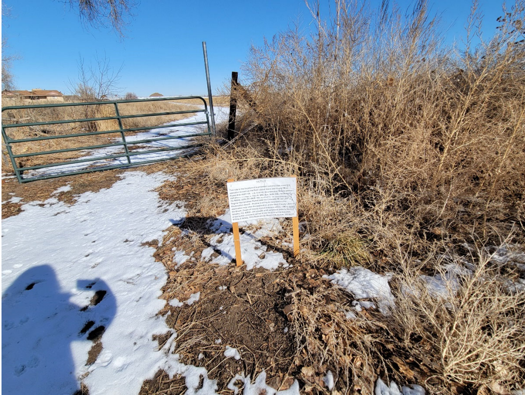
Photo 15: Public notice sign posted at the entrance to the proposed Northwest area.