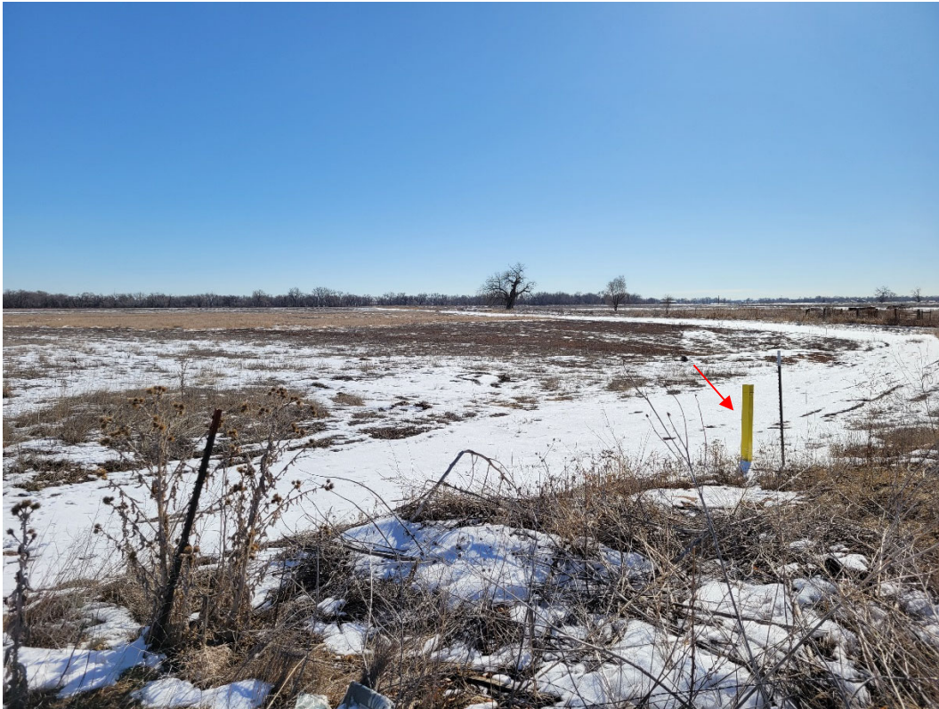
Photo 11: Looking southeast from the northwest corner of the Northeast area. Red arrow points to groundwater monitoring well MW-02n.