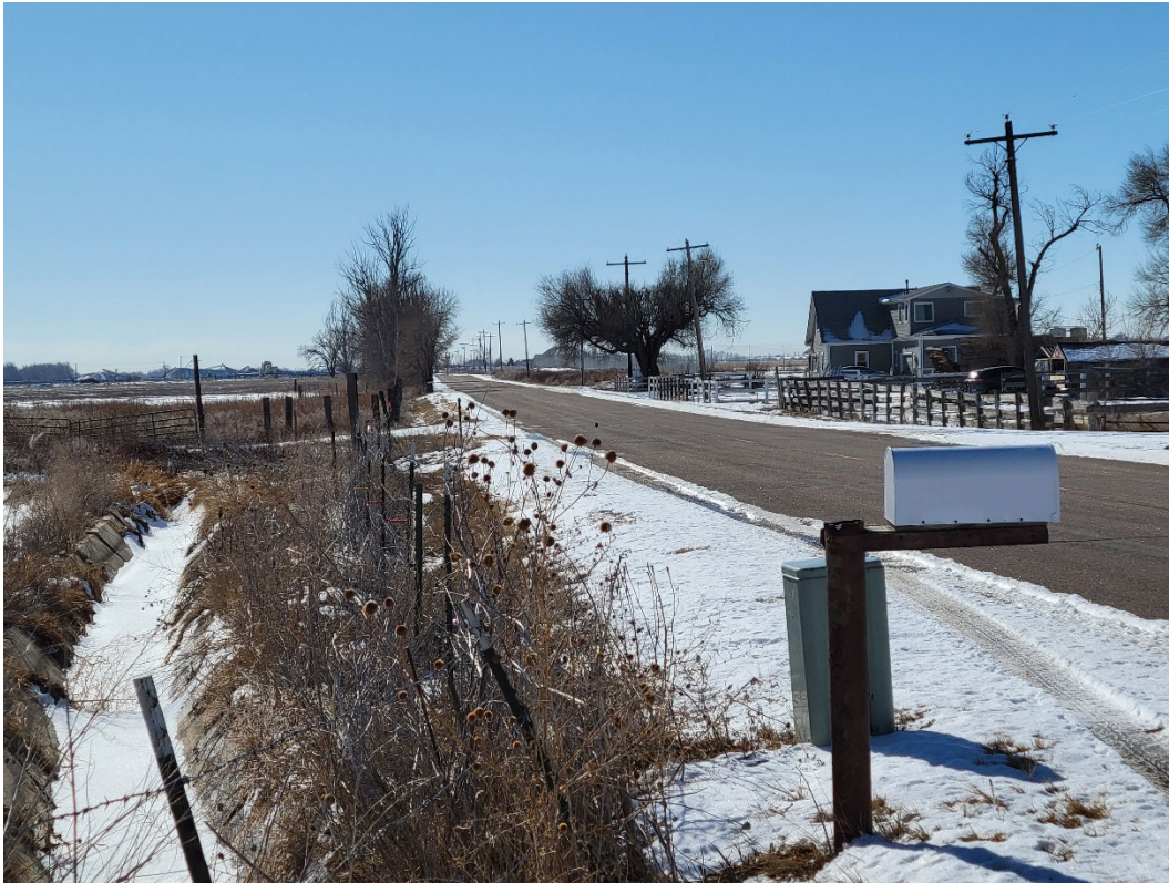
Photo 13: Looking south down CR25. Two residences and associated outbuildings were observed on the west side of CR25, across from the northwest corner of the proposed Amendment 3 area. The Division also observed utilities along the county road.