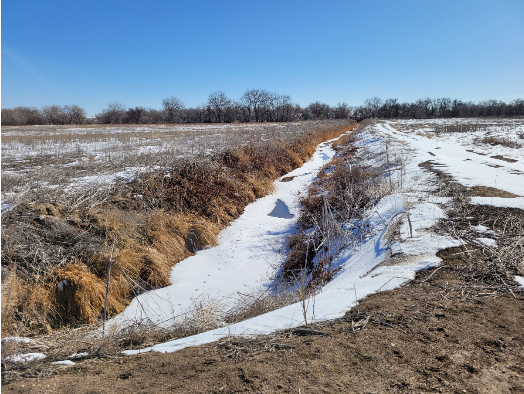
Photo 3: Looking southeast down the Lupton Bottoms Ditch between the proposed Northeast #2 and Northeast #3 mining areas.