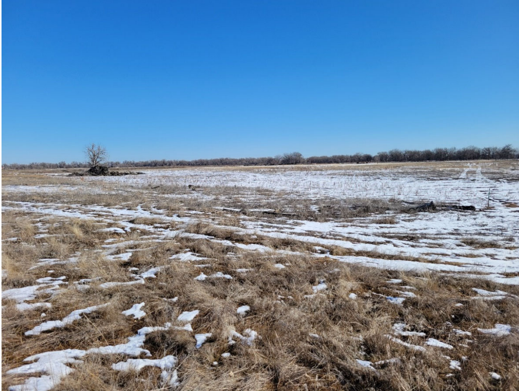
Photo 1: Looking across the Northeast #2 area from the southwest corner of the amendment area.