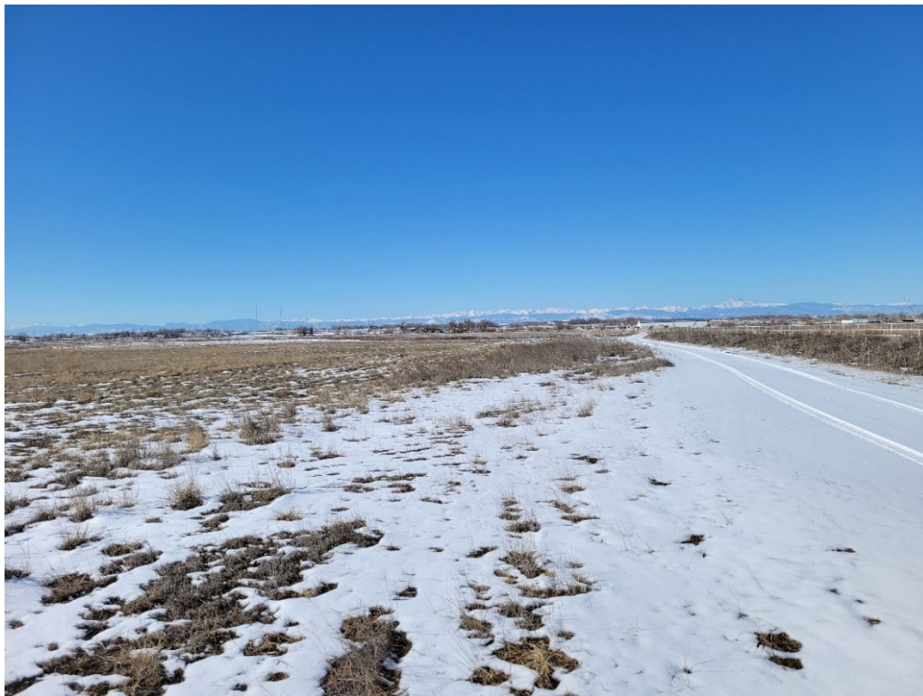
Photo 8: Looking west down the permit boundary on the north end of the Northeast area. Barbed wire fencing marks the boundary. A dirt horse racing track was observed to the north on the adjacent property.