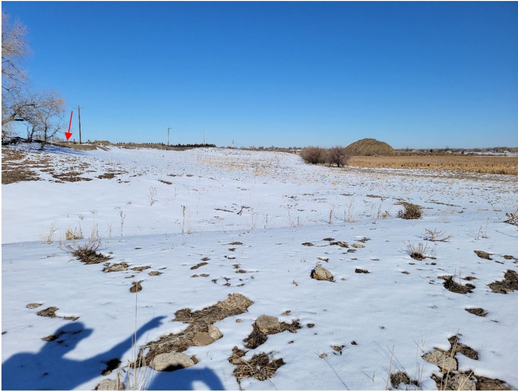
Photo 19: Looking north across the Northwest area from the center of the site. This area did not appear to be recently planted for agriculture. The red arrow points to the Lupton Ditch which flows along a ridge on the western side of the proposed mining area.