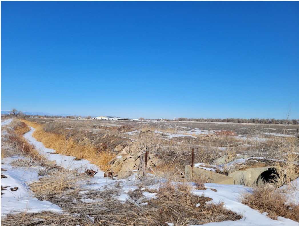
Photo 4: Looking northwest at the Lupton Bottoms Ditch between the proposed Northeast #1 and Northeast #2 mining areas. The Meadows Island ditch also runs through here.