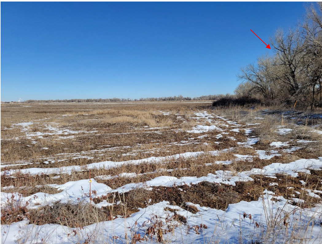
Photo 6: Looking north along the permit boundary on the east side of the Northeast #3 area. Riparian area on the left associated with the South Platte River.