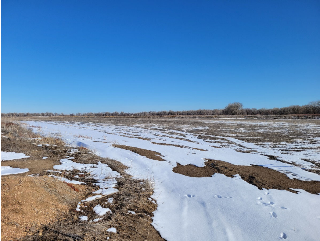
Photo 5: Looking at the Northeast #3 area from the southwest corner.