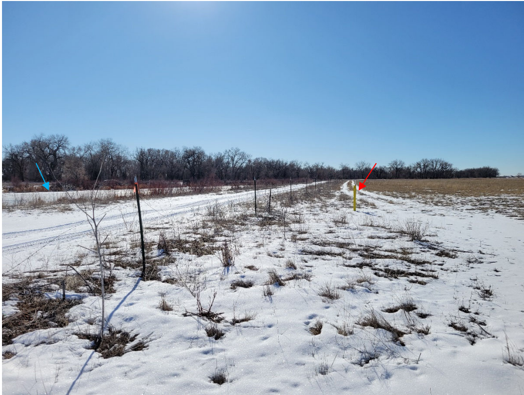
Photo 7: Looking south down the permit boundary on the east side of the Northeast #1 area. Red arrow points to a groundwater monitoring well MW-01n. Blue arrow points to an unlined pond on the adjacent property, outside the Amendment 3 area. A gas line marker was also observed in this area.