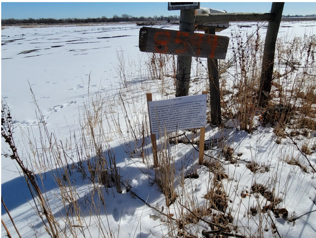
Photo 14: One of four public notices observed posted around the Amendment 3 area. This sign is posted on CR25 at an entrance on the northern end of the proposed Northeast area.