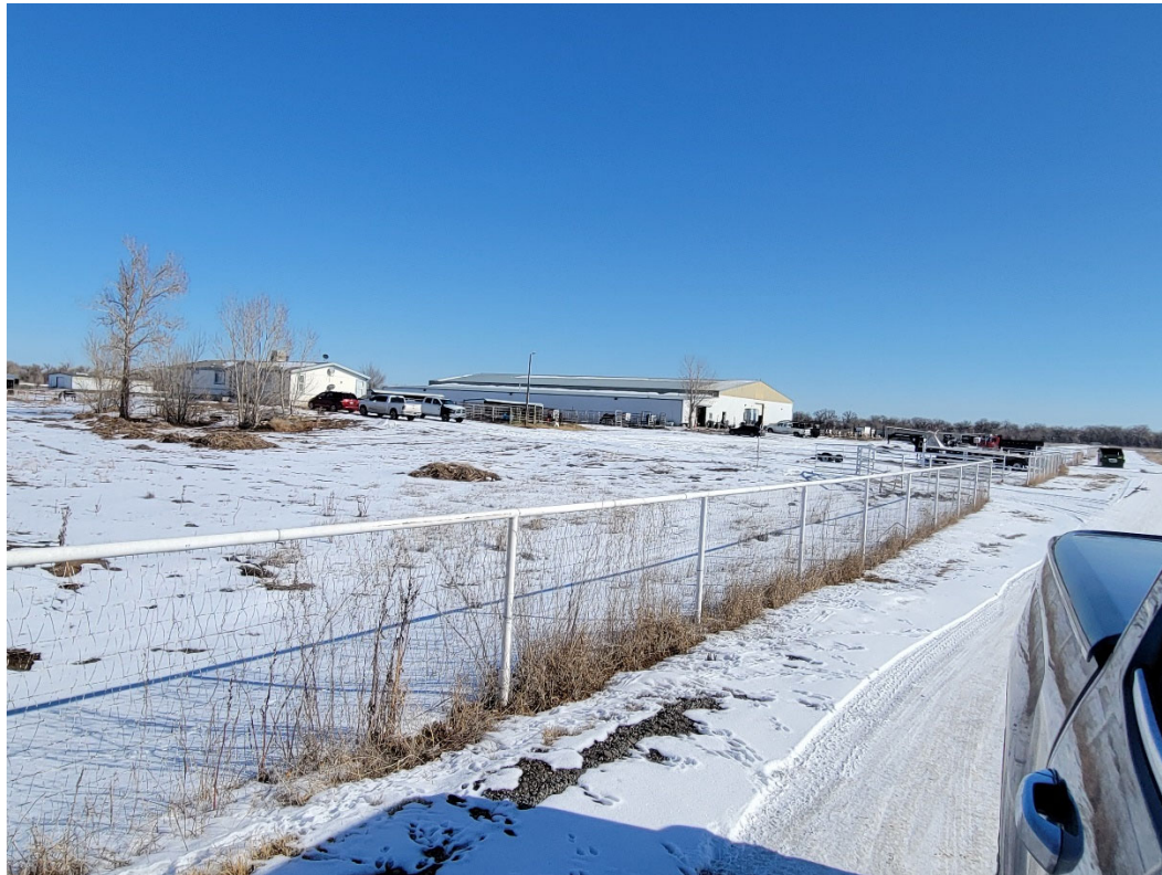
Photo 12: Looking northeast at the adjacent property on the north side of the Amendment 3 area. This property includes a home, barn, and dirt horse racing track.