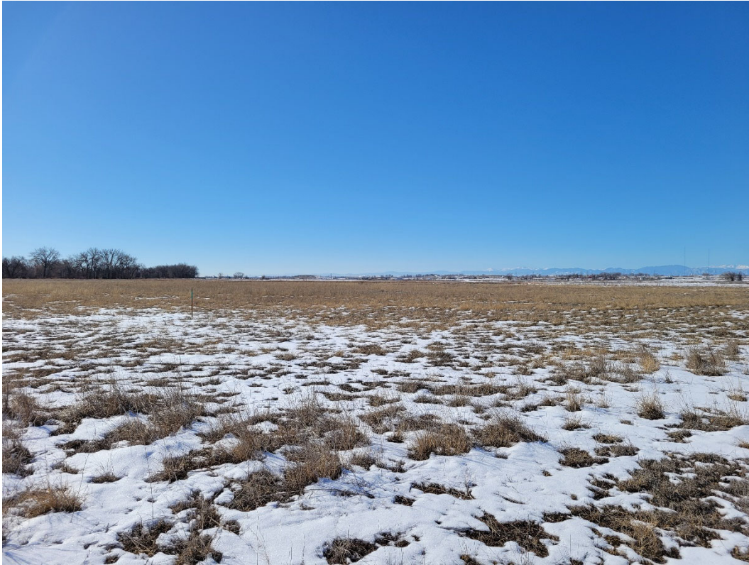
Photo 9: Looking across the proposed Amendment 3 area from the northeast corner.