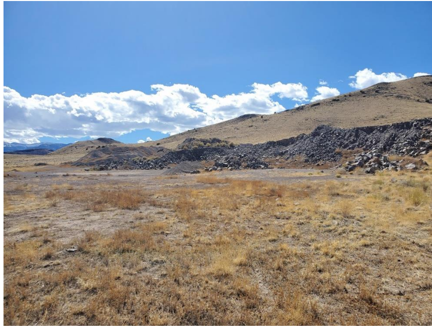
Photo 3: View to the southwest of the highwall in the mining area.