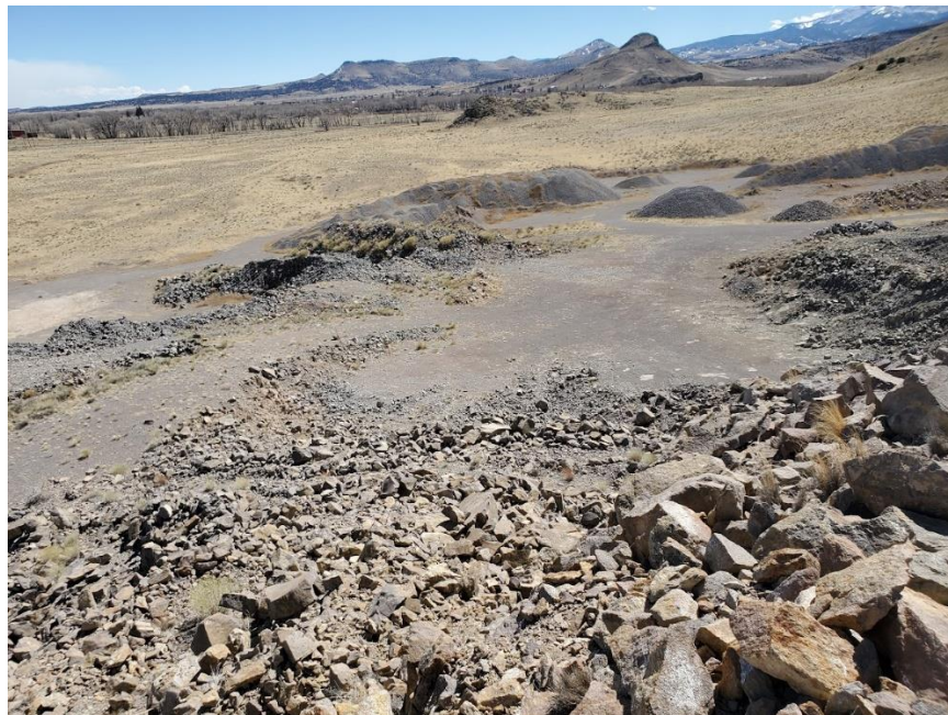
Photo 4: View to the southeast. Overview of mining and stockpile area.