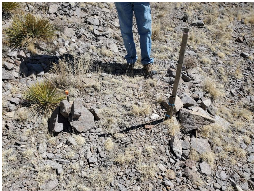
Photo 2: View to the east of pin and post along the northern boundary of the permit.