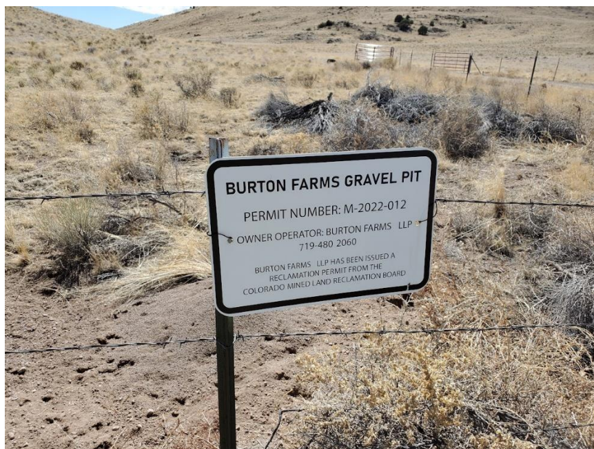
Photo 1: View to the south of proper mine ID sign at the entrance to the mine site.