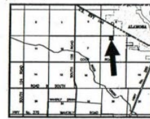
LOCATION INSET Not to Scale