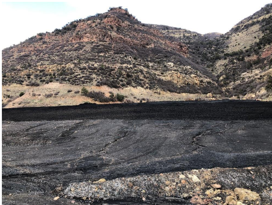
Upper portion of Gob Pile #2 (newly placed piles of material in back)