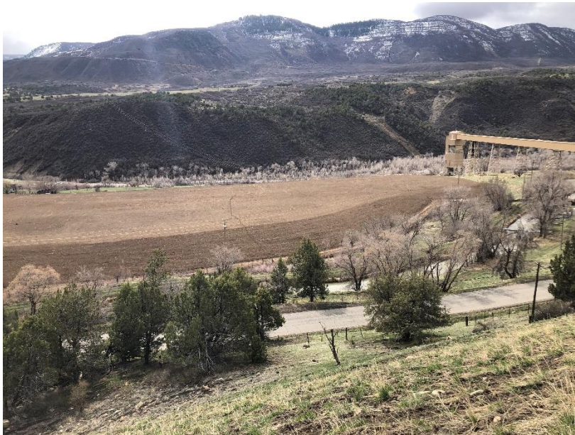
Gob Pile #3 (western portion)

Number of Partial Inspection this Fiscal Year: 7