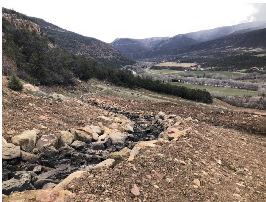
Ditch below Gob Pile #2 and deer

Number of Partial Inspection this Fiscal Year: 7