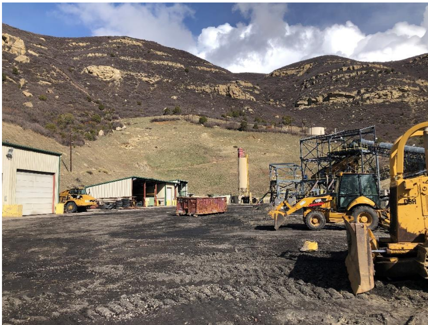
D Portal Bench and slope below Utility Bench

Number of Partial Inspection this Fiscal Year: 7