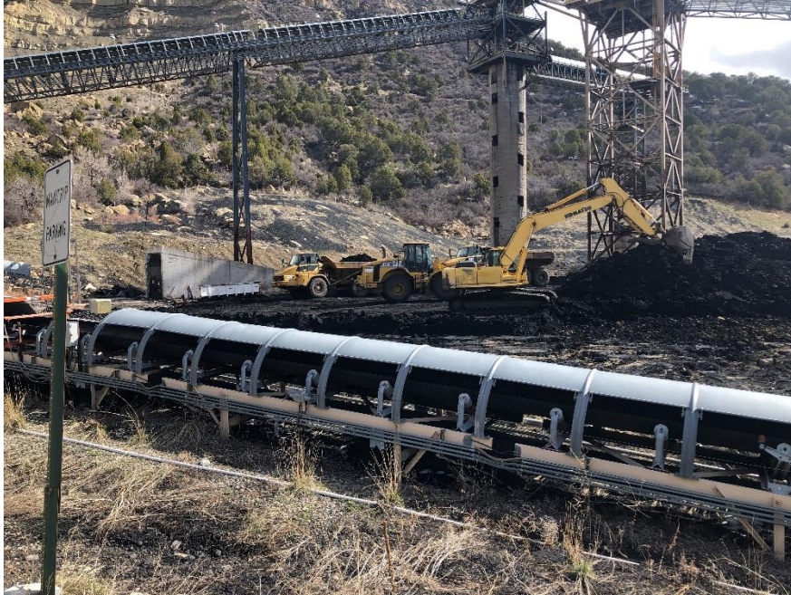
Work on D Portal Bench