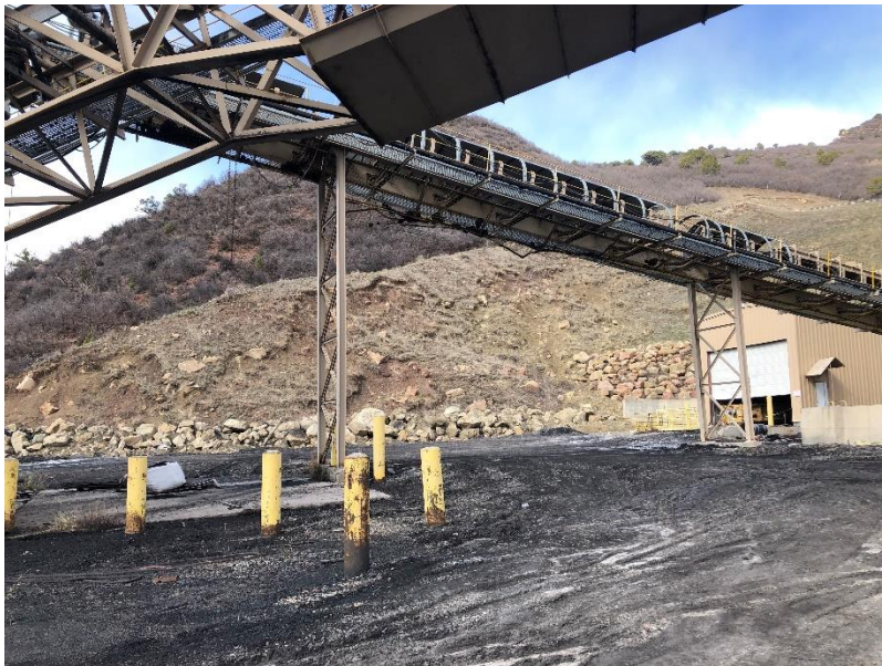
Slump at B Portal Bench (west side)

Number of Partial Inspection this Fiscal Year: 7