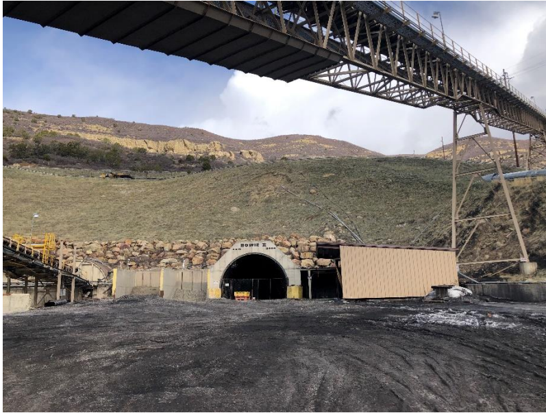
Slump at B Portal Bench (north side)