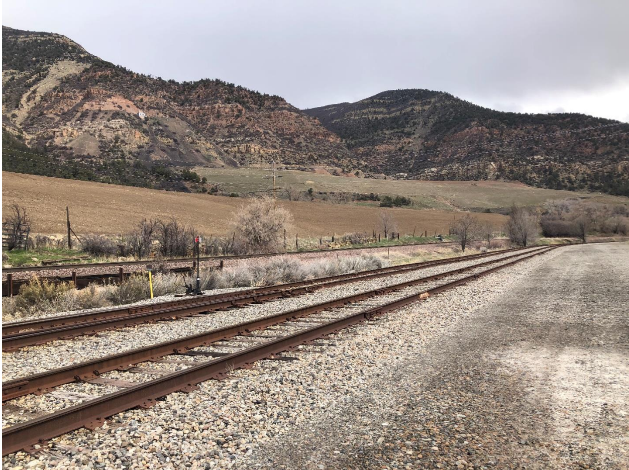
Gob Pile #3 (southern portion)

Number of Partial Inspection this Fiscal Year: 7