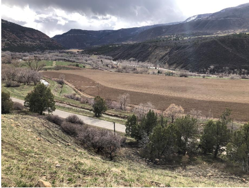
Gob Pile #3 (eastern portion)