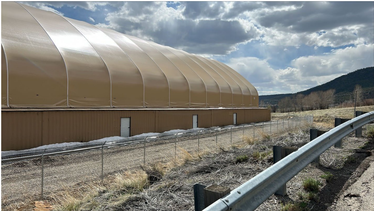
Figure 6: Temporary building

Number of Partial Inspection this Fiscal Year: 6