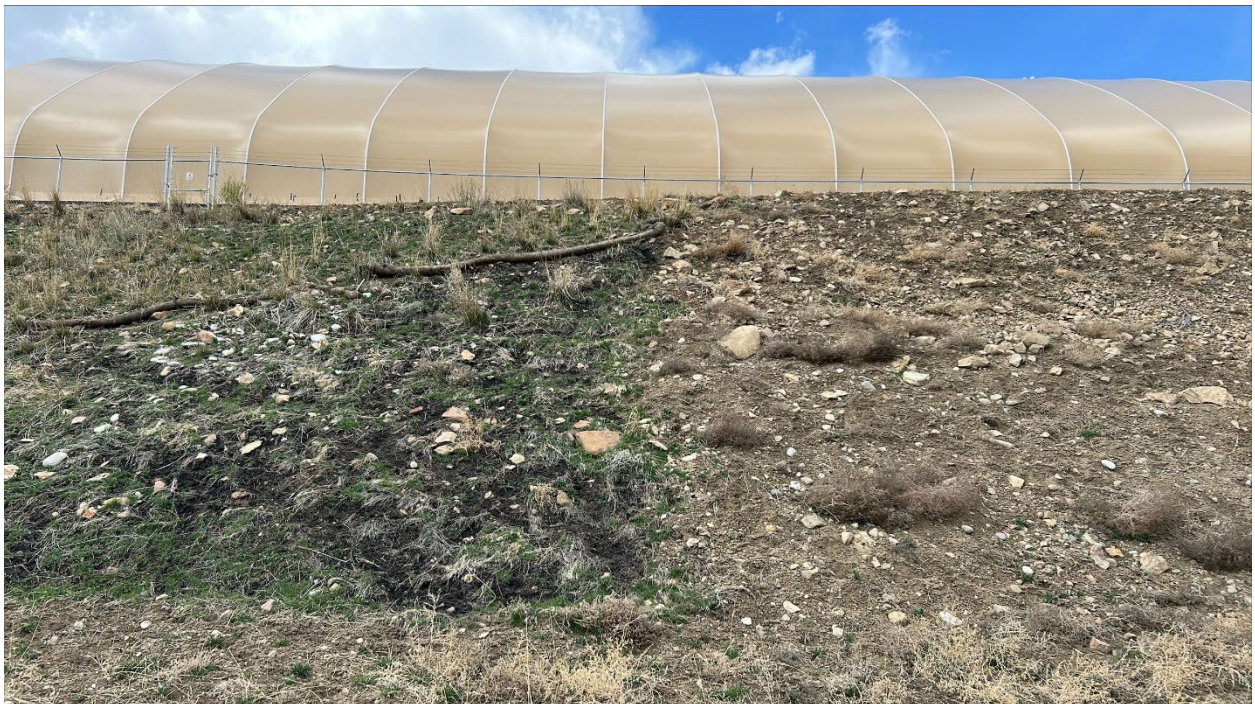
Figure 4: Sparse vegetation on railroad embankment

Number of Partial Inspection this Fiscal Year: 6