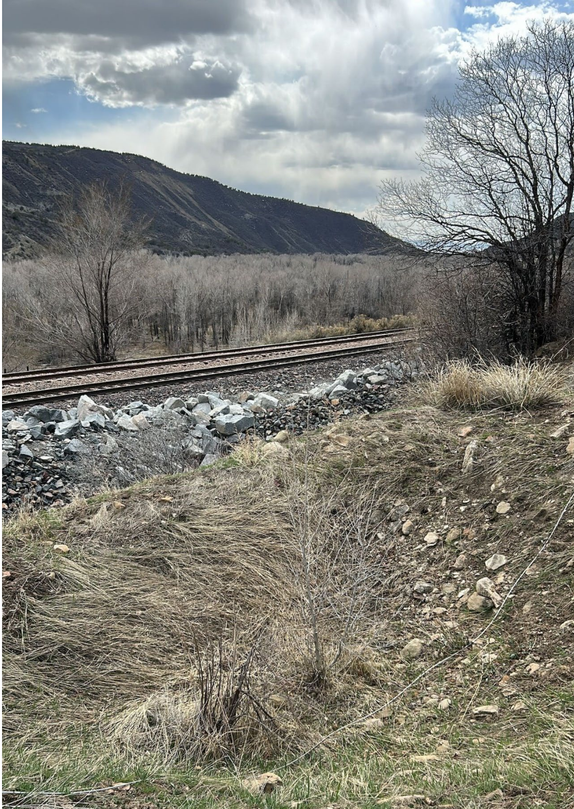
Figure 2: Dugout pond

Number of Partial Inspection this Fiscal Year: 6