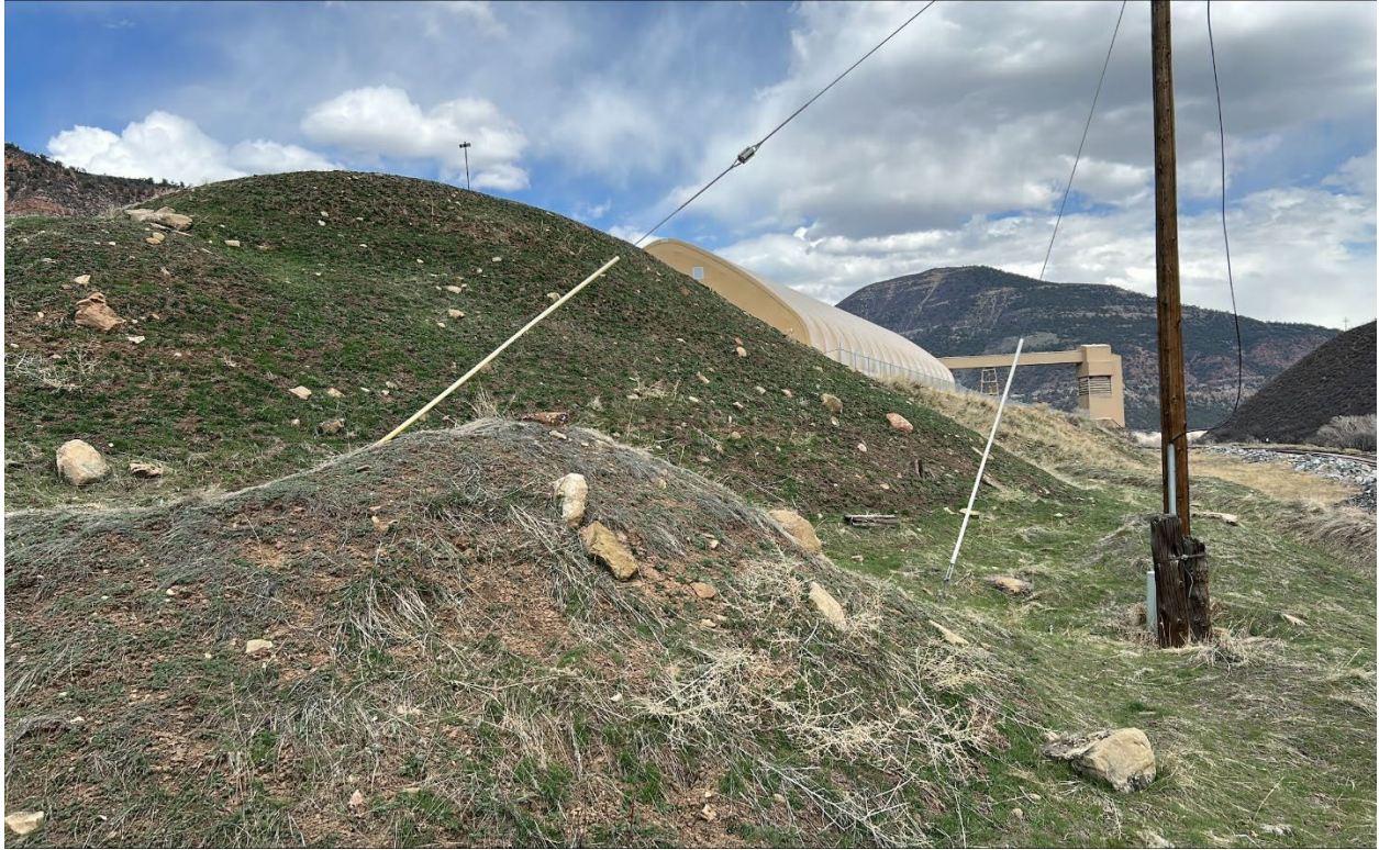
Figure 3: Topsoil stockpile and railroad embankment