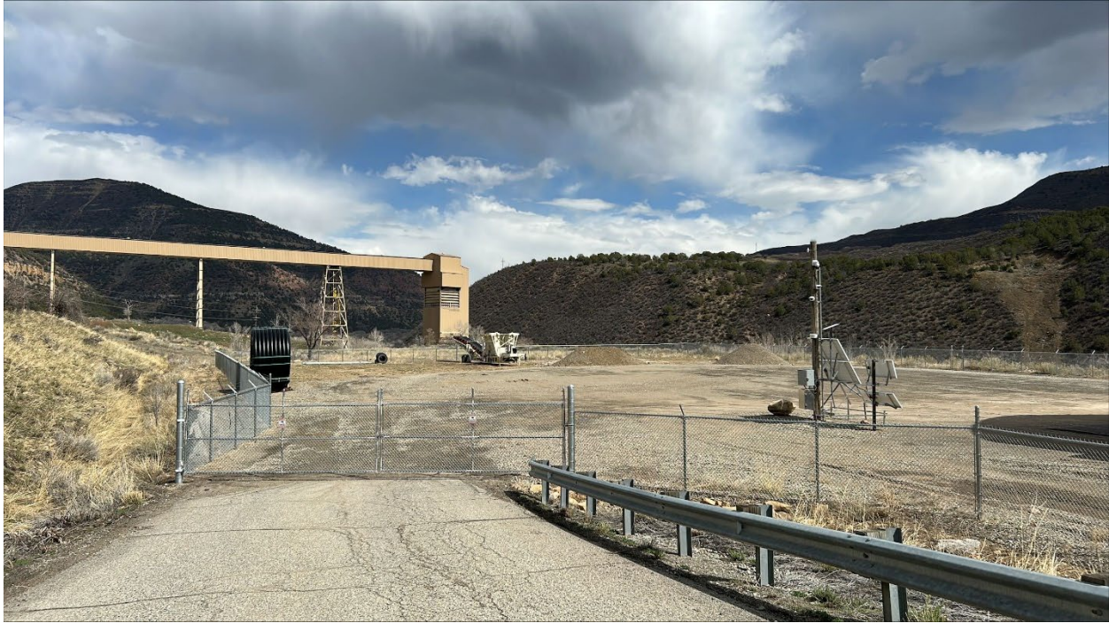
Figure 5: Lower pad