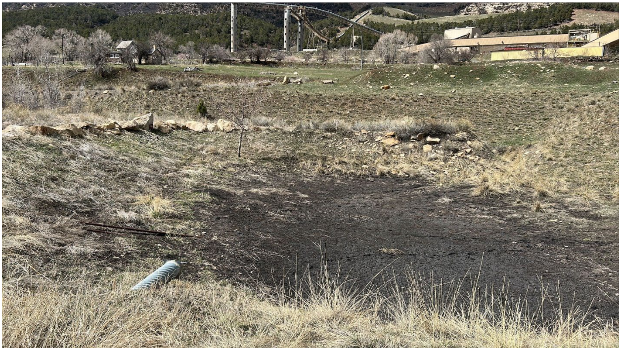
Figure 1: Sediment Pond

No enforcement actions were initiated as a result of this inspection, nor are any pending.