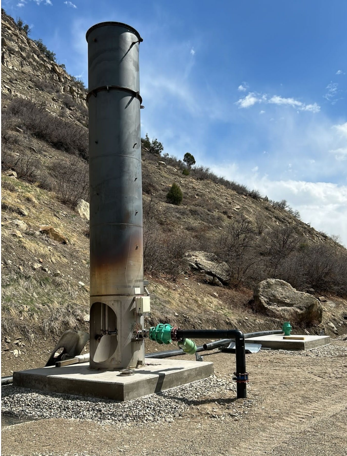
Figure 3: First flare installed; pad ready for second

Number of Partial Inspection this Fiscal Year: 6