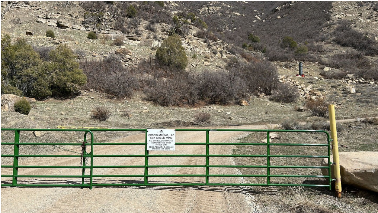
Figure 1: Locked gate securing access to Hubbard Creek Methane Destruction Facility