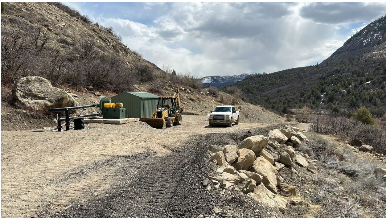
Figure 2: Control room and pump

Number of Partial Inspection this Fiscal Year: 6