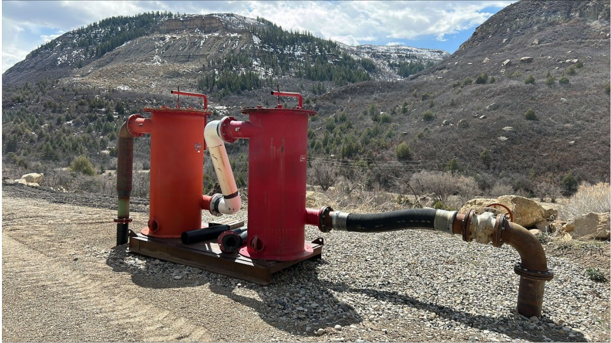
Figure 4: Separators

Number of Partial Inspection this Fiscal Year: 6