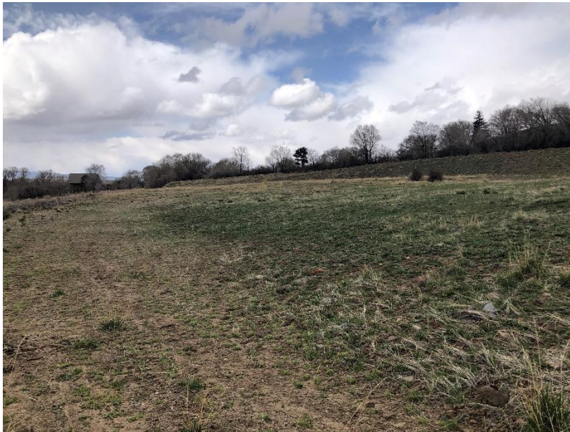
Coal Storage Area by Highway 133

Number of Partial Inspection this Fiscal Year: 7