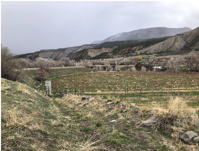
Slope below loadout with the trestle in background

Number of Partial Inspection this Fiscal Year: 7