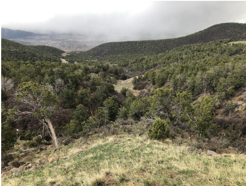
Reclaimed Ponds 3 and 4 at East Mine, looking down the valley from the Old Waste Disposal Area