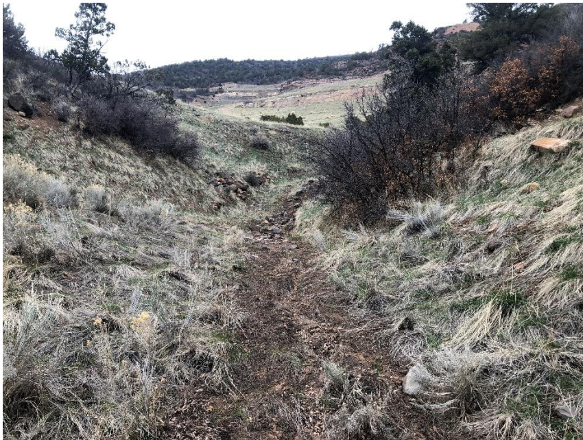
Reclaimed Pond 2 at the East Mine, looking up the drainage

Number of Partial Inspection this Fiscal Year: 7