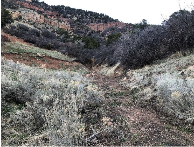
Reclaimed Pond 1 at the East Mine, looking up the drainage