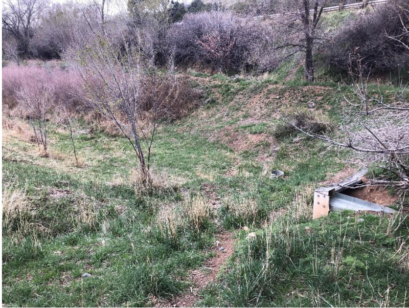
Pond at the loadout