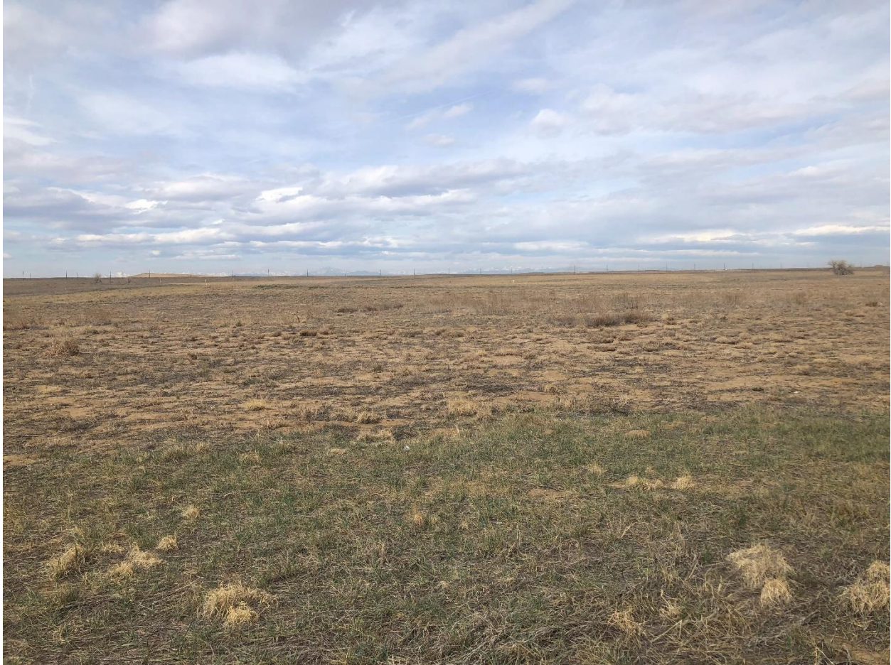
Looking west at site, from area beside the Dugout Pond

Number of Partial Inspection this Fiscal Year: 6