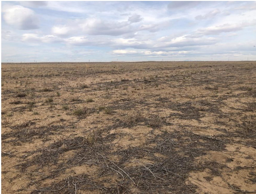
Bare spot in Long Term Spoil Area (Area 36)

Number of Partial Inspection this Fiscal Year: 6