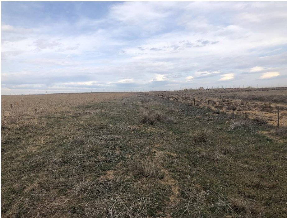
Northern boundary and ditch, looking northwest

Number of Partial Inspection this Fiscal Year: 6