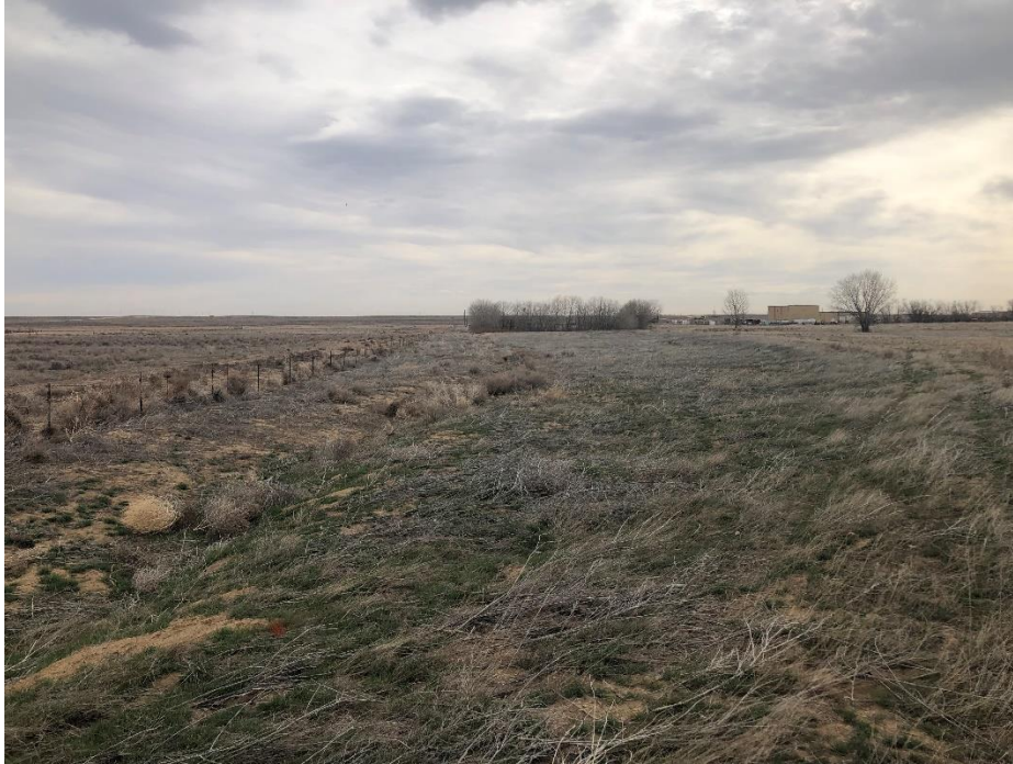
Northern boundary and ditch, looking east at Sediment Pond 2