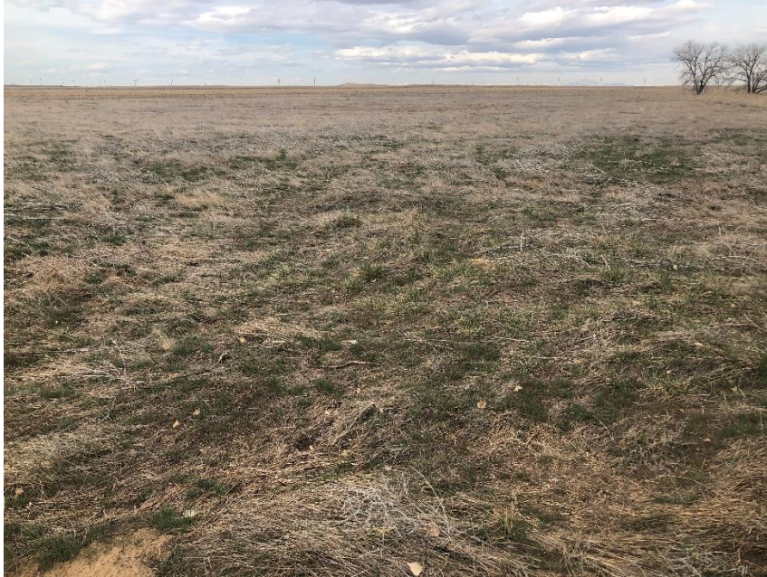
Green grass emerging in Area 42, west of Area 26