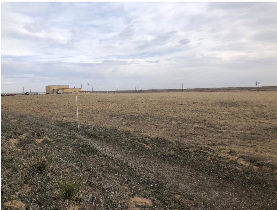
Area 38, south of facilities

Number of Partial Inspection this Fiscal Year: 6