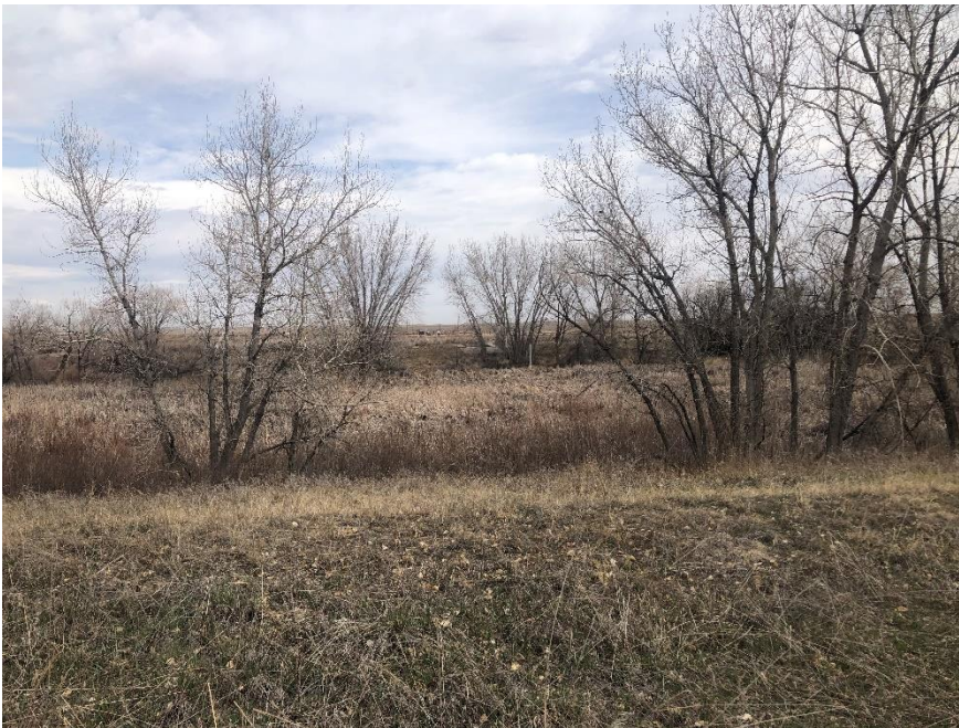
Sediment Pond 2

Number of Partial Inspection this Fiscal Year: 6