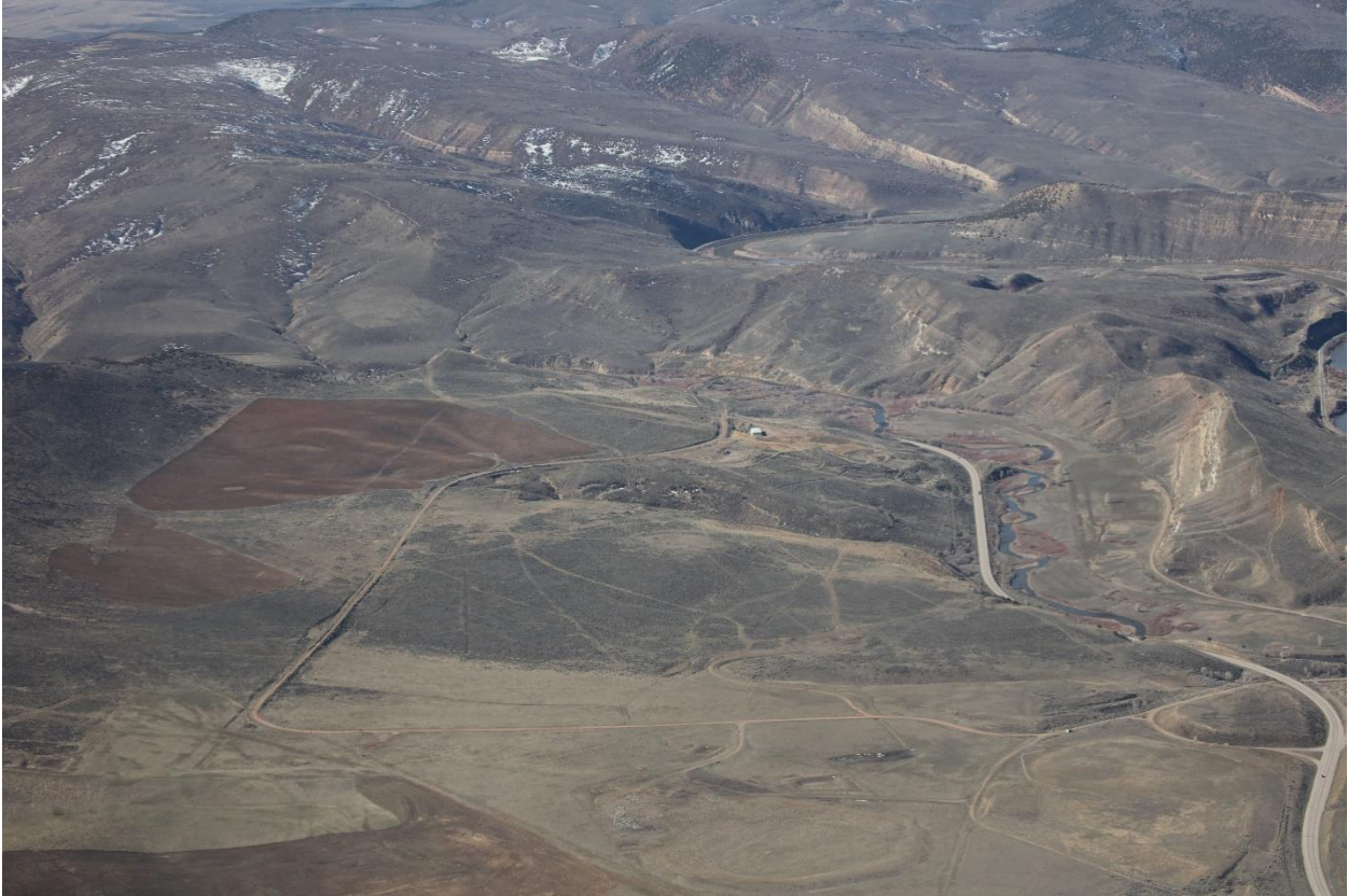
Photo 4: View of the north end of the site with the refuse pile in the lower right side and numerous pond indentations.

Number of Partial Inspection this Fiscal Year: 6