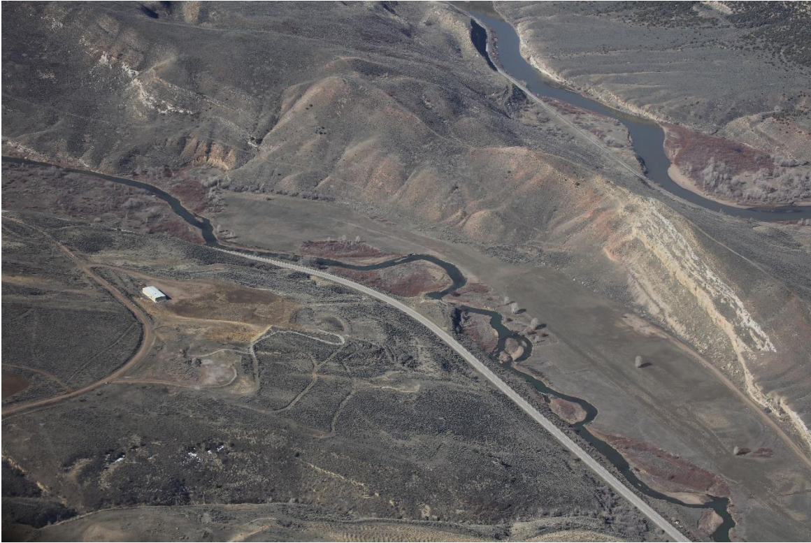
Photo 2: View of the Williams Fork bottomlands and the portal area below the shop building, looking south.