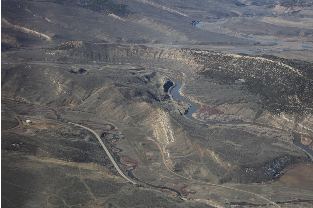
Photo 1: Williams Fork mine identification sign at the entrance from Highway 13.

Number of Partial Inspection this Fiscal Year: 6