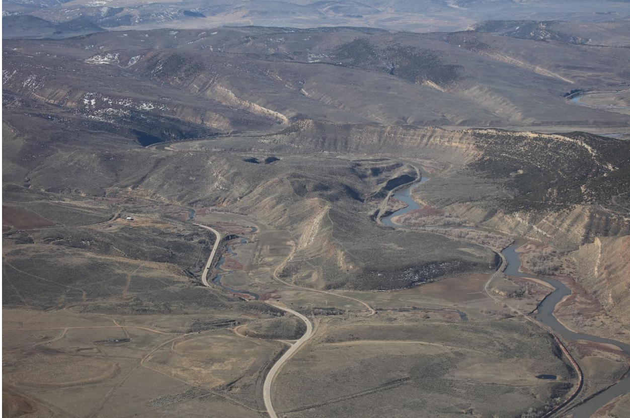
Photo 1: Overview of the Williams Fork mine site, located on the left of the photo, looking south.

Number of Partial Inspection this Fiscal Year: 6