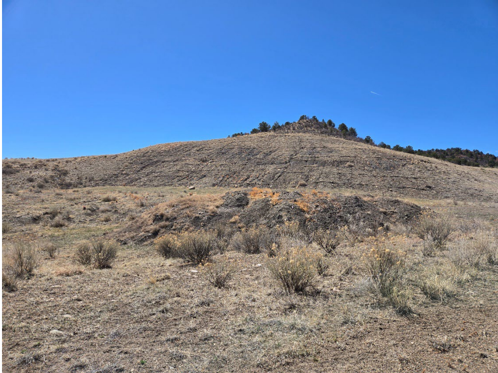
Photo 9: Previously reclaimed slope in the background and sediment drying area in the foreground