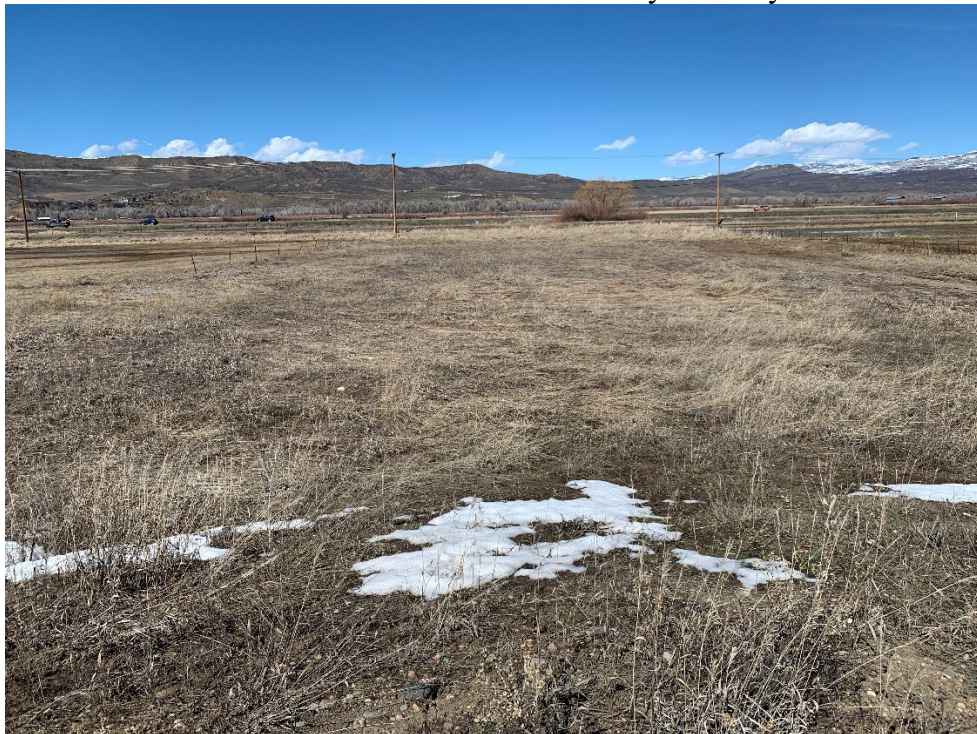
Photo 3- Reclaimed area facing north from trail head parking lot

Number of Partial Inspection this Fiscal Year: 6