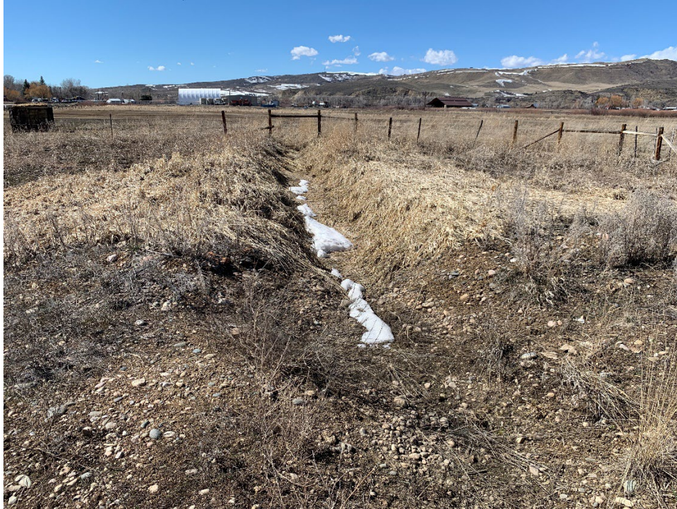
Photo 2- Ditch on north side of Hwy 40 is dry.