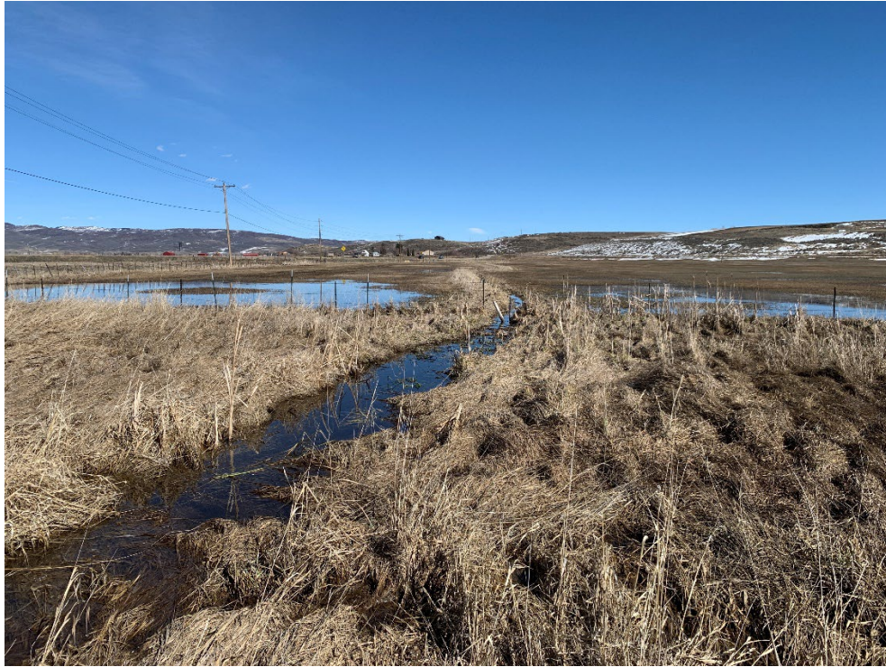
Photo 1- Ditches flowing across the reclamation south of Hwy 40.

Number of Partial Inspection this Fiscal Year: 6