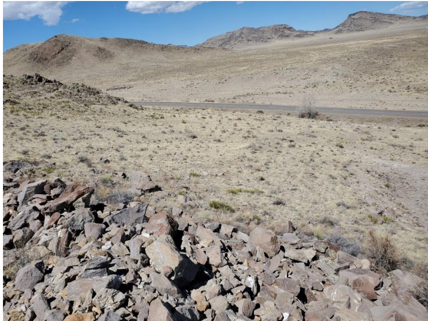
Photo 5: View to the north of the permit area on canal company property.