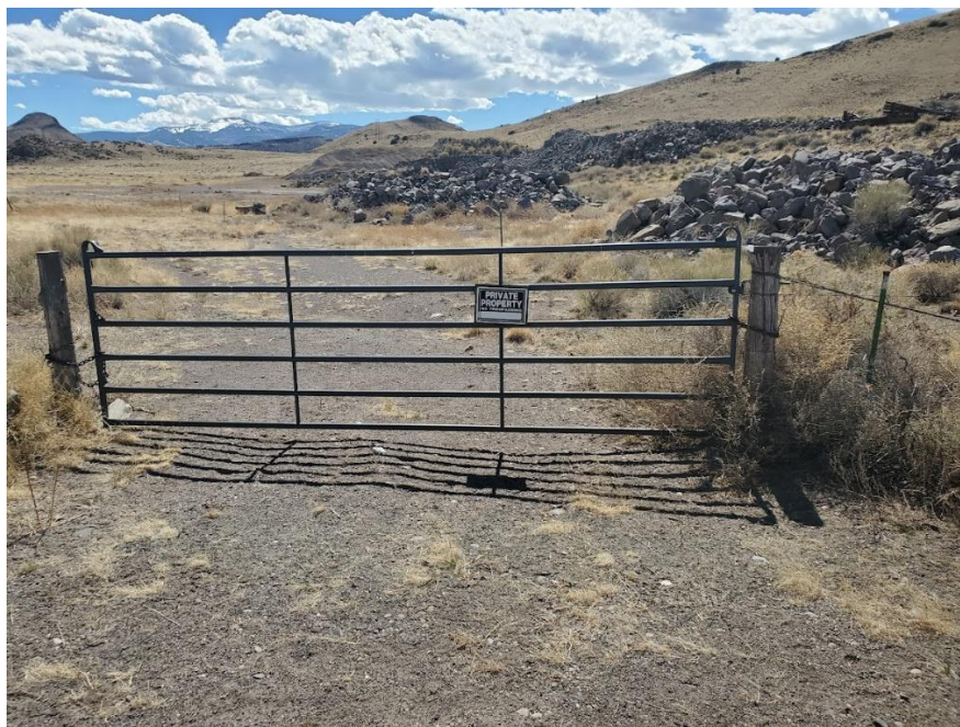
Photo 6: View to the south of gate to access the portion of the permit on the canal company property. Process area can be seen in the background.