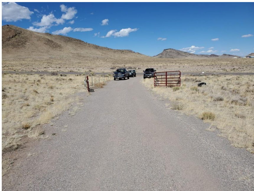
Photo 1: View to the north of the gate at the pit entrance on Burton Property. Road will remain post reclamation.