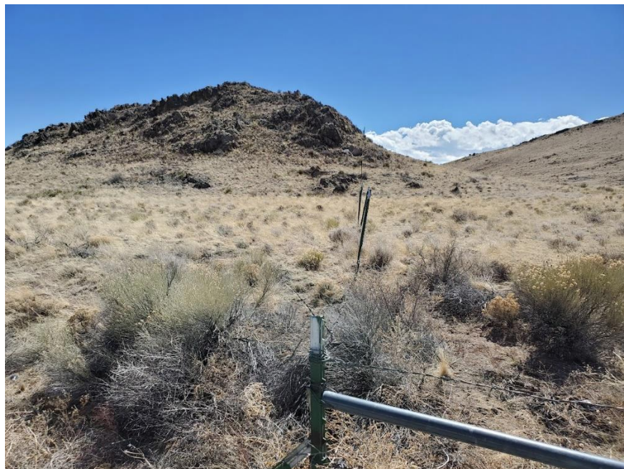
Photo 3: View to the south of undisturbed ground on north end of Burton property. Fence line is property line.