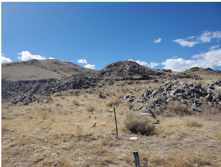
Photo 2: View to the west of property markers between Burton property (left of fence) and canal company property (right of fence)