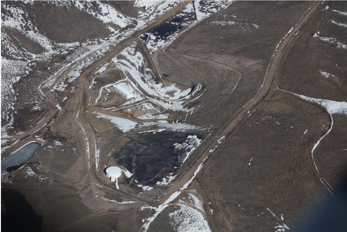
Photo 2: Facilities area comprised of the vehicle maintenance shop, a pad for equipment storage and the one million gallon water tank.