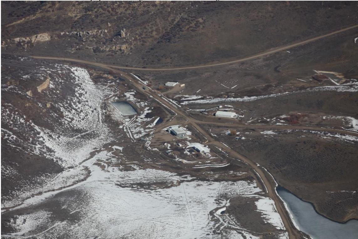
Photo 2: Facilities area looking west comprised of the vehicle maintenance shop, a pad for equipment storage and the million gallon water tank.

Number of Partial Inspection this Fiscal Year: 1