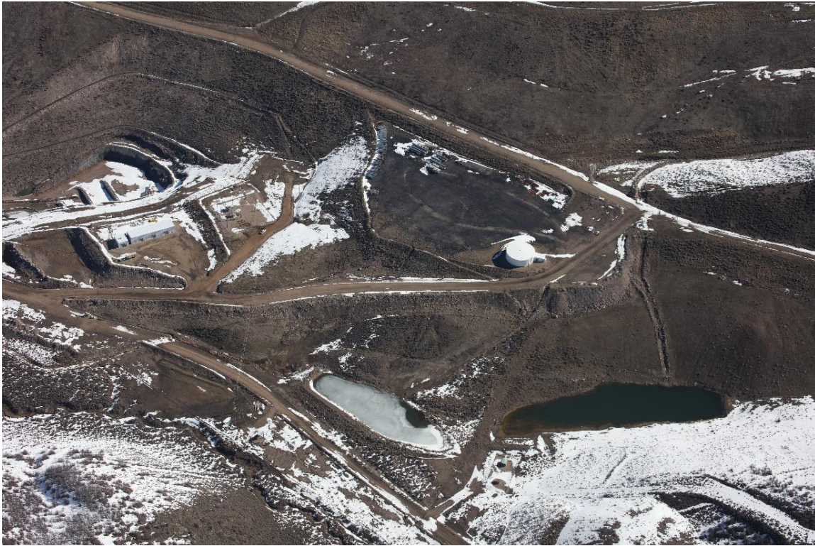
Photo 5: Portal area with facilities and Pecoco Pond, and Pond with ice cover.

Number of Partial Inspection this Fiscal Year: 1