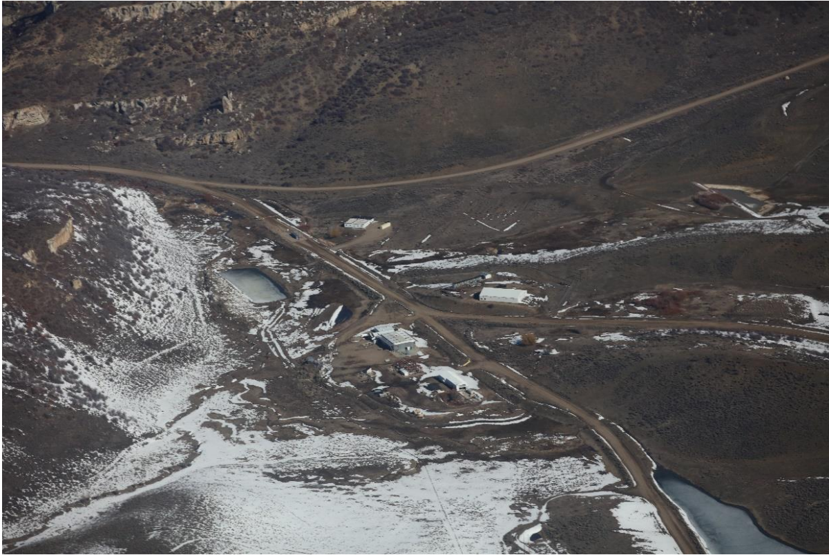
Photo 3: Facilities area from the tip of Pond 002 looking west toward the site entrance