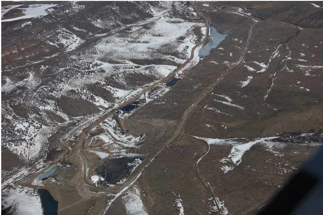
Photo 1: Overview of the north section of the site with Pond 003 in the foreground and Pond 002 in the distance.

Number of Partial Inspection this Fiscal Year: 1