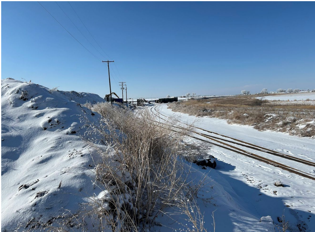
Photo 4: View of railroad from the perspective of the excess excavated material, facing southwest.