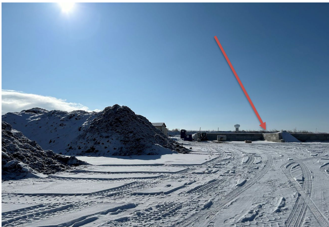
Photo 6: View of snow-covered mulch stockpiles and the concrete bins (see arrow) containing the majority of the material excavated along the railroad tracks, facing south.