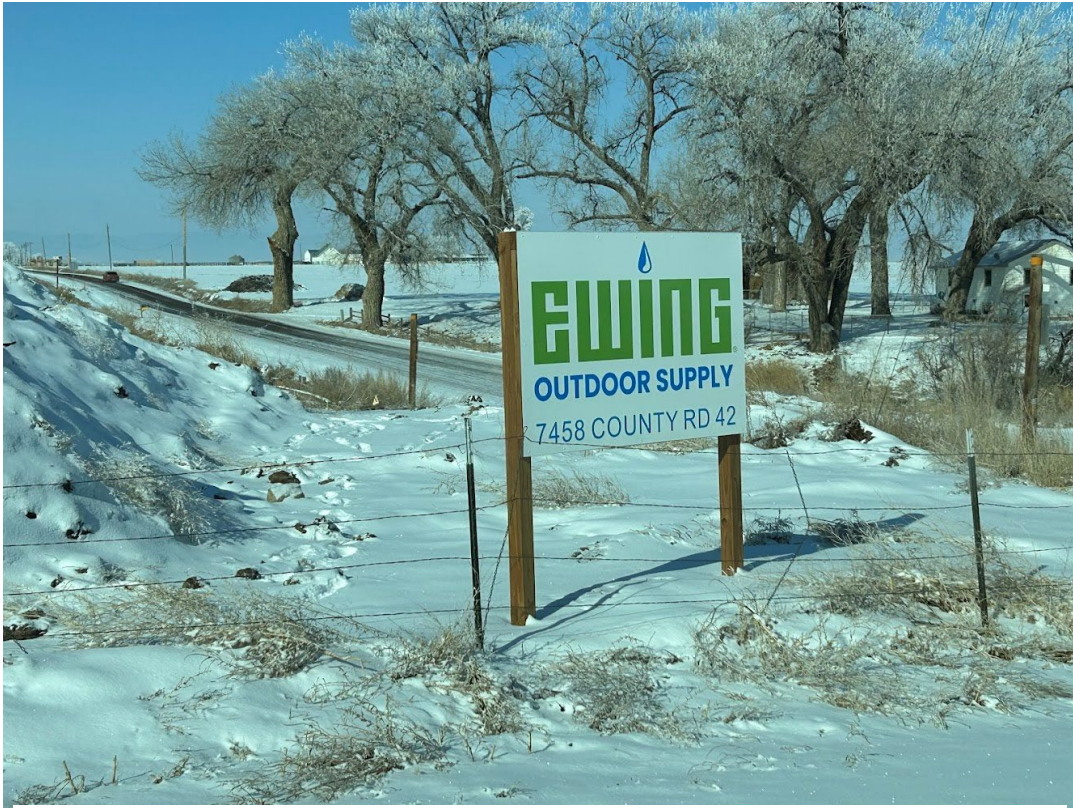
Photo 1: View of company sign upon entering property from the north, facing west.