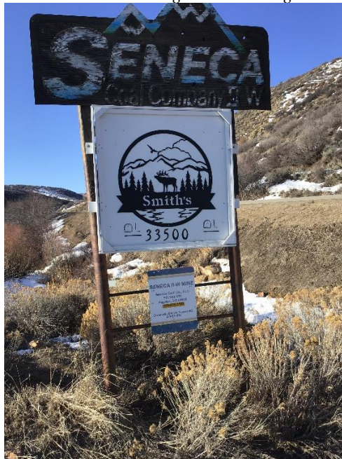
Photo5: Mine identification sign at entrance from County Road 53.

Number of Partial Inspection this Fiscal Year: 5