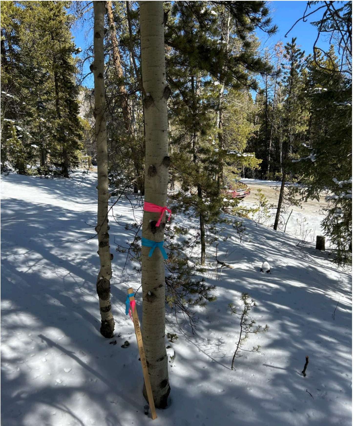
Figure 3: (456)