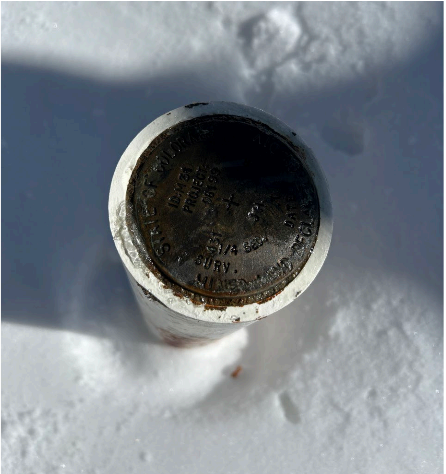
Figure 11: Historic survey marker "State of Colorado, Mined Land Reclamation Division" (463)