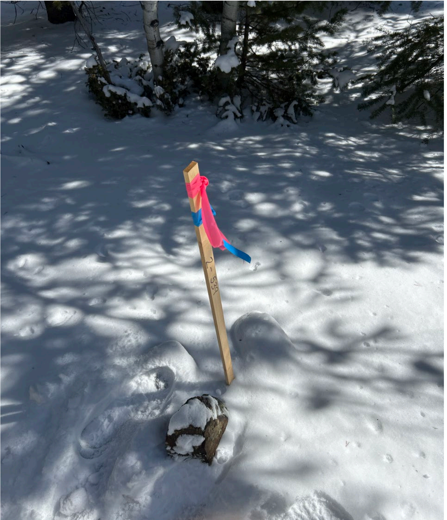
Figure 12: (467)