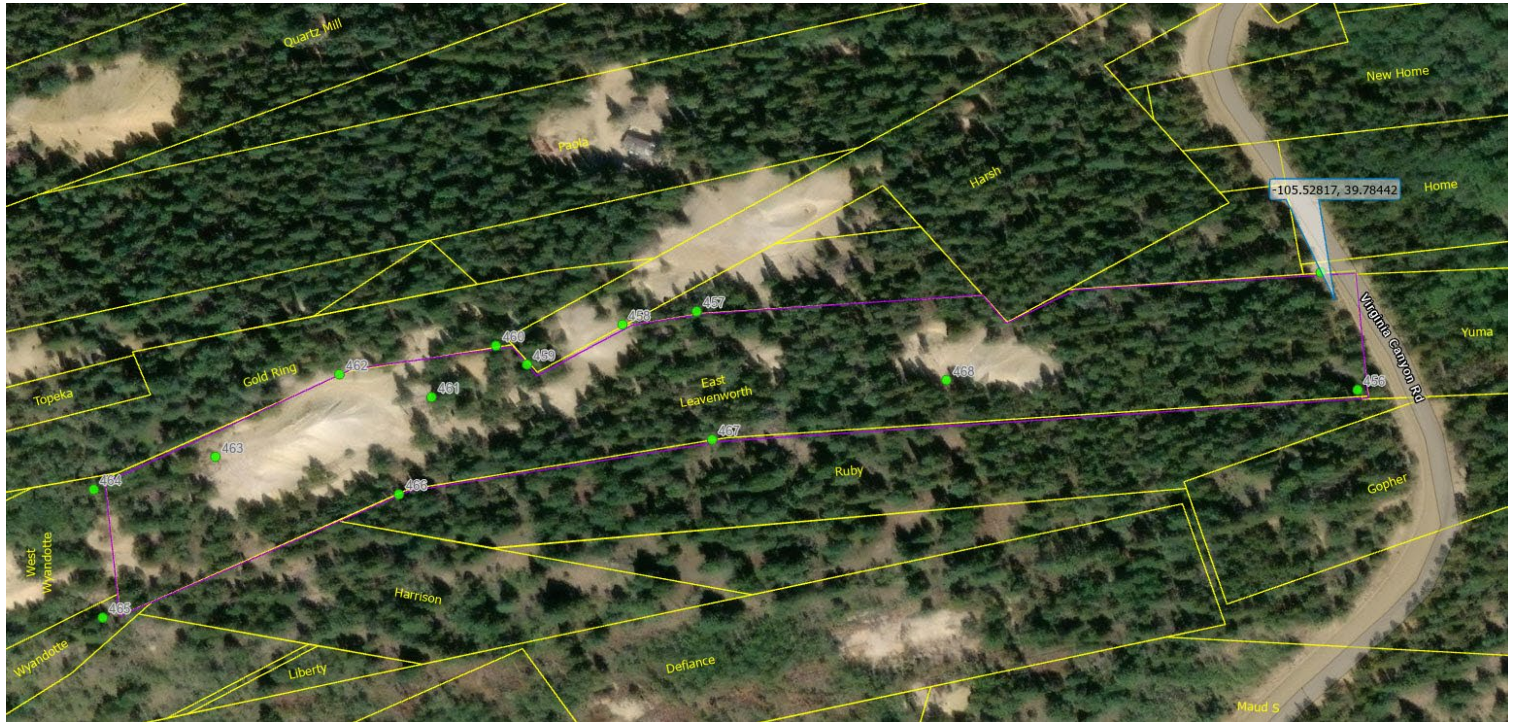
Figure 2: Screenshot of Inspection Map, with Gilpin County Legacy Tax Parcels in yellow, proposed permit boundary in purple, and points collected during the inspection in green. Labeled points may be used to reference location of photographs.