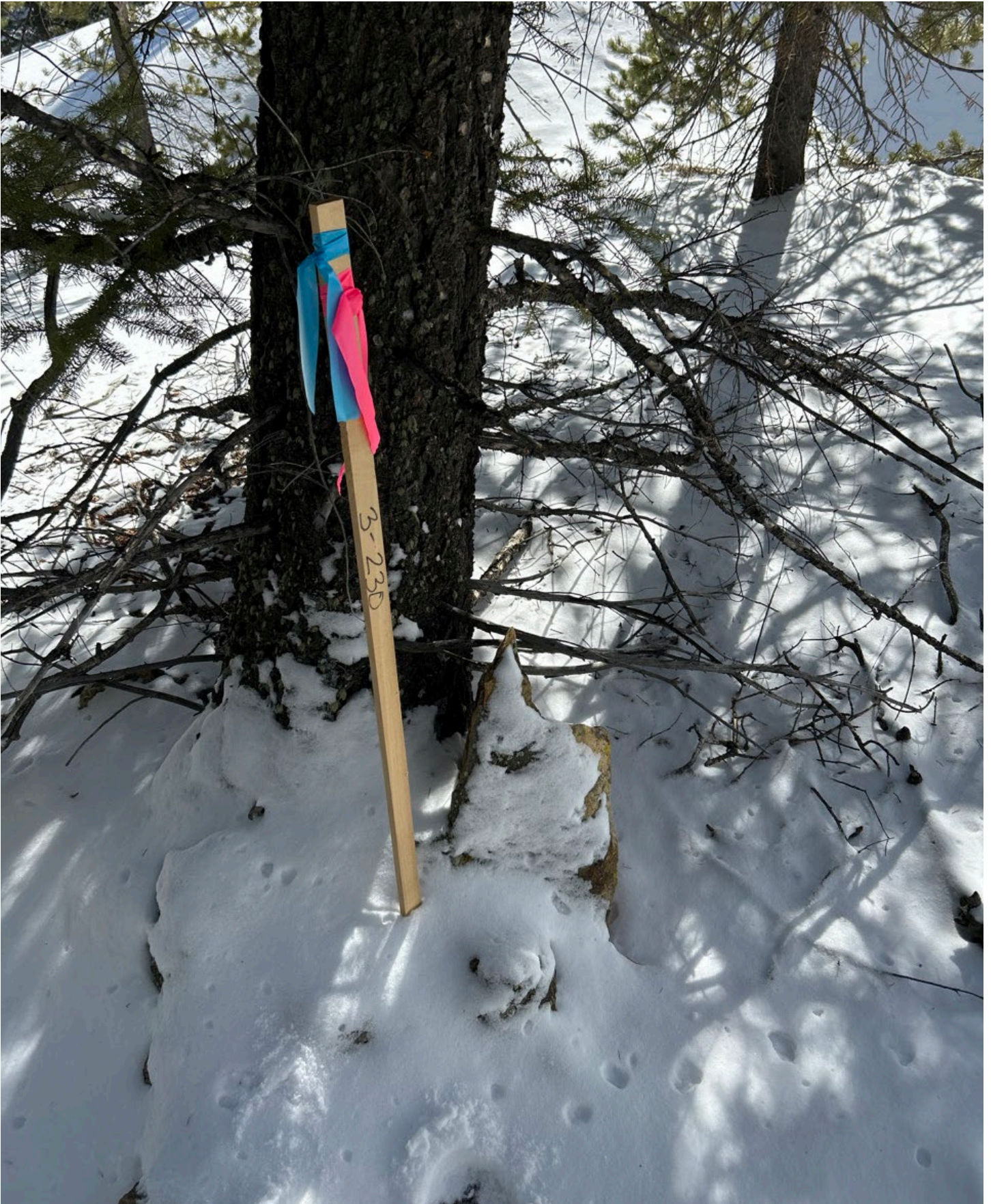
Figure 6: (459)