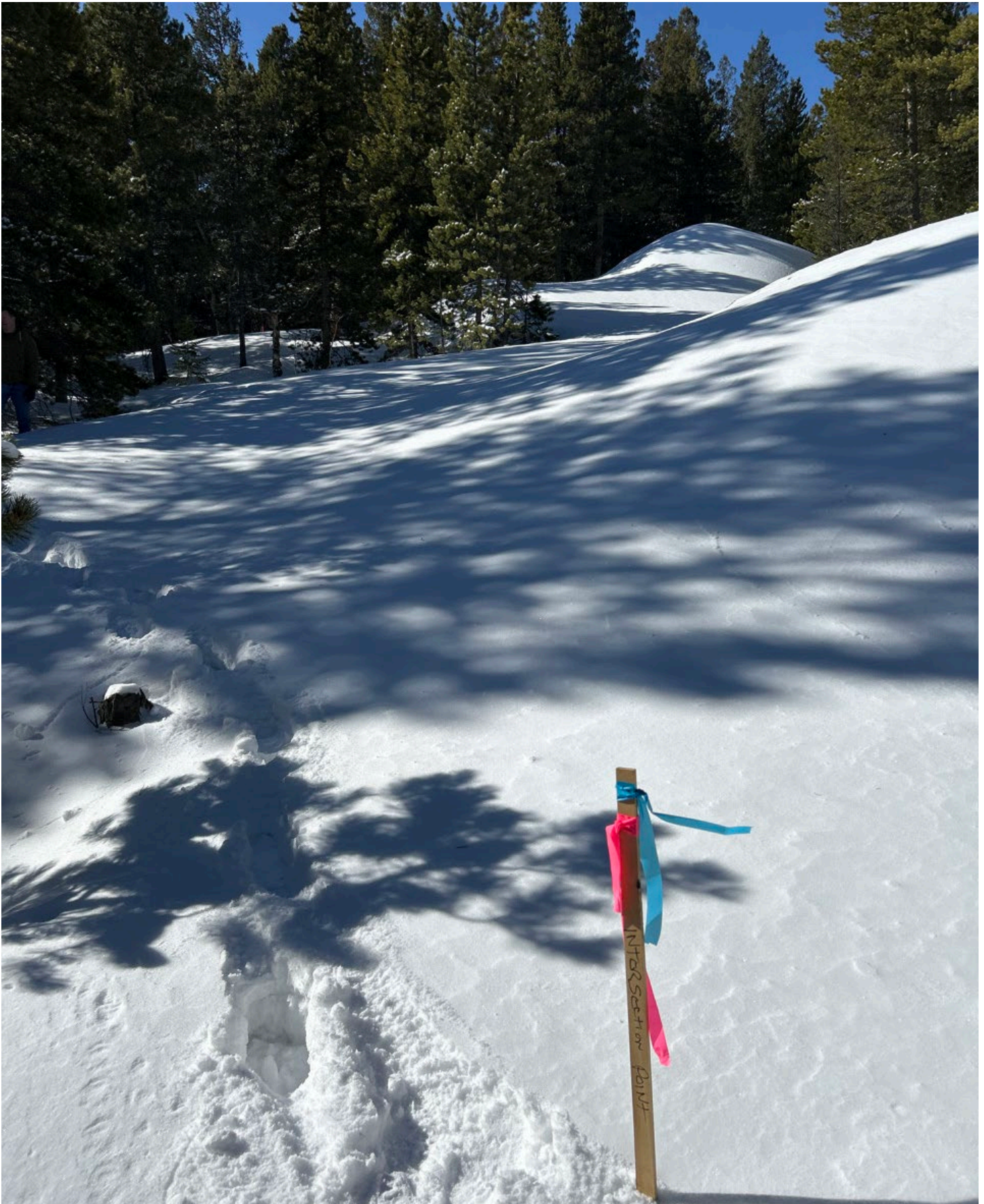
Figure 5: (458)