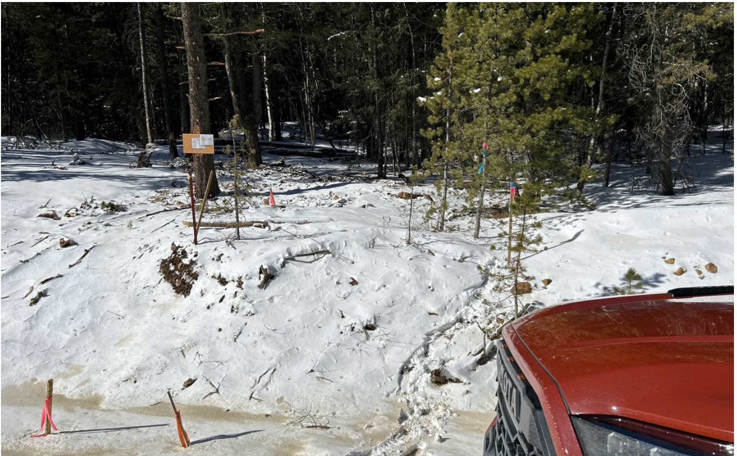
Figure 1: Entrance to the site (455)