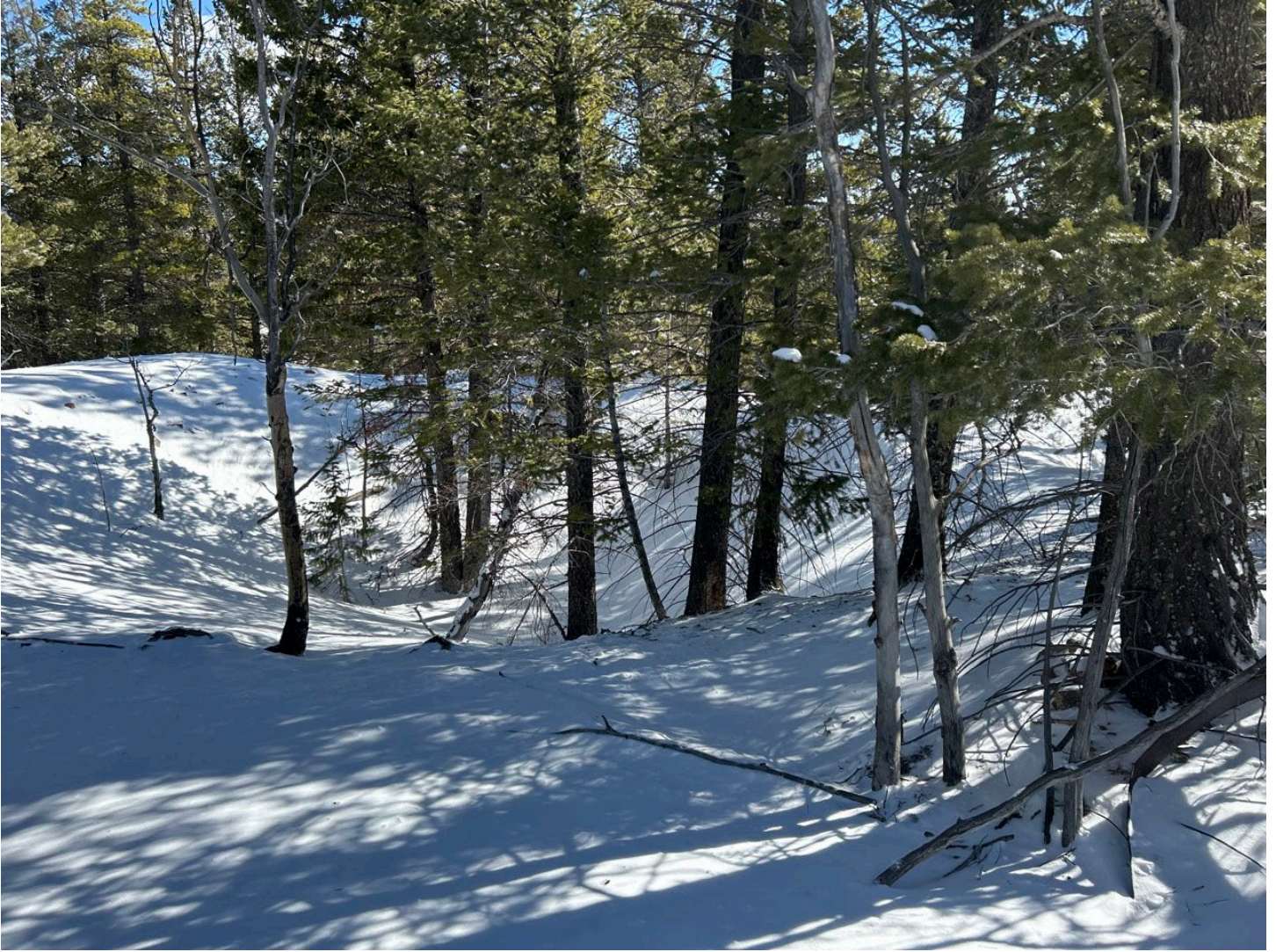
Figure 8: 461)