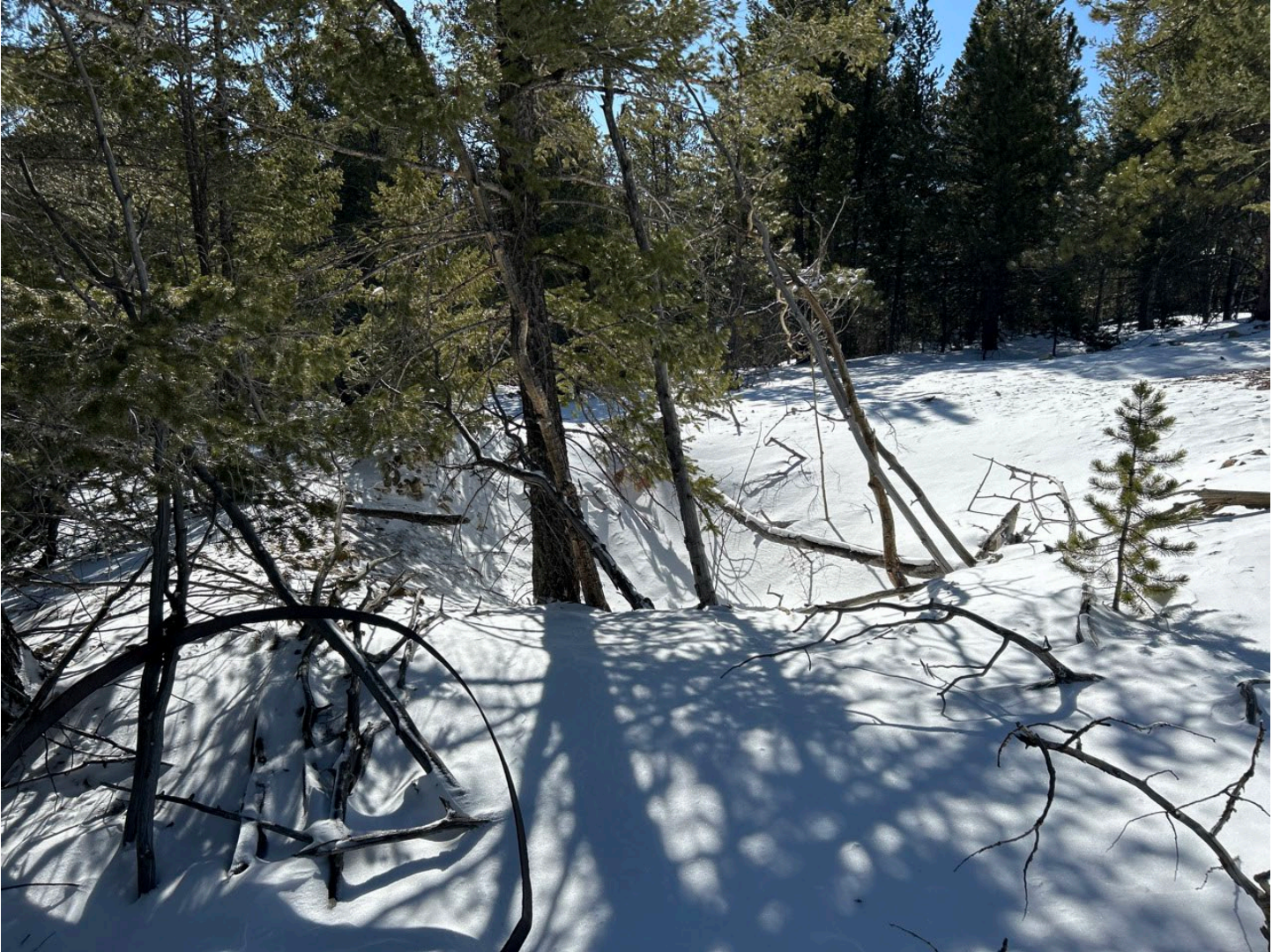
Figure 7: Approximate location of proposed processing facility, historic test pits will be backfilled to make level. Some trees will need to be cleared, but the applicant's goal is to minimize the amount, (461)