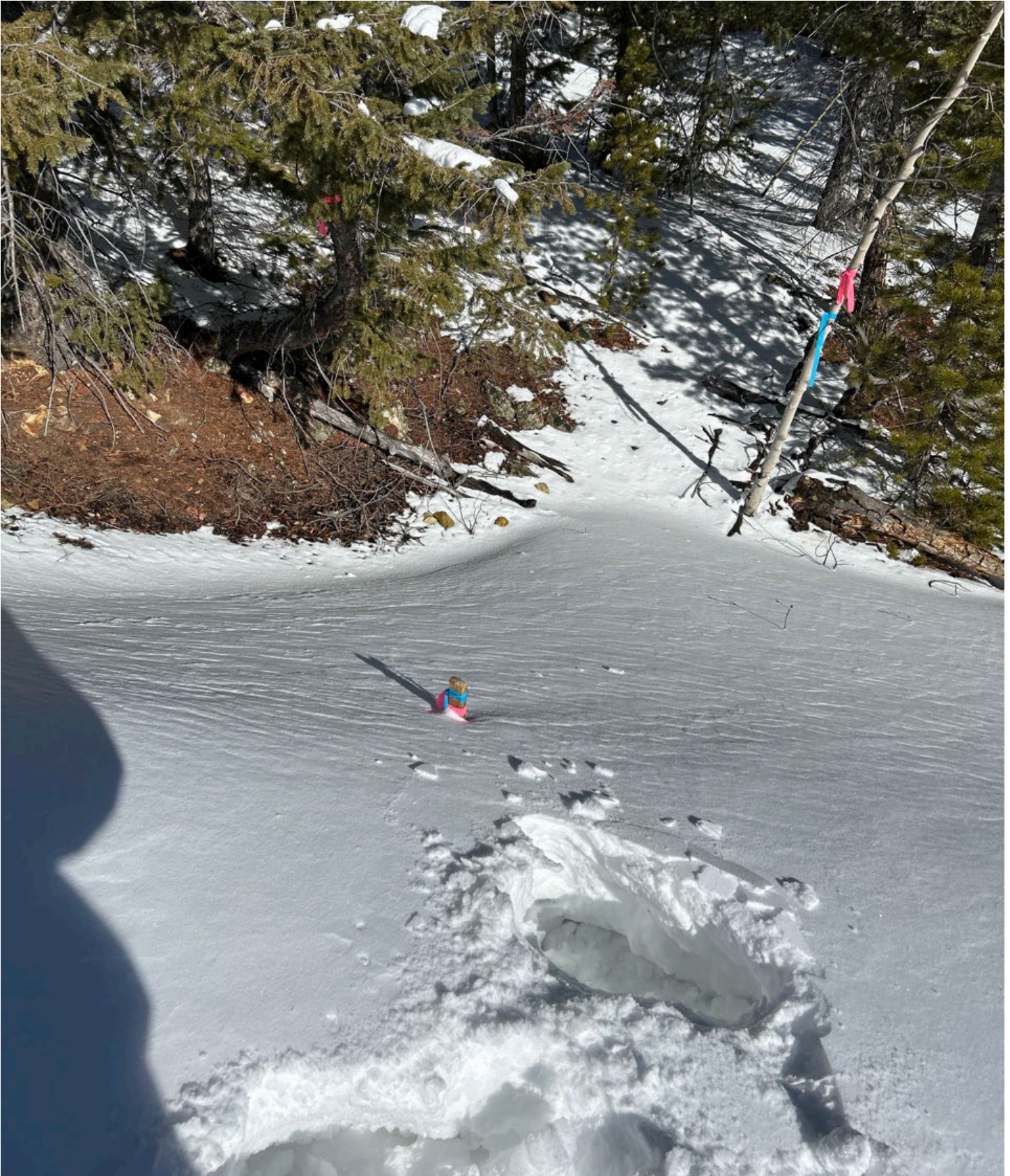
Figure 9: Northern edge of large waste pile spills over northern boundary of East Leavenworth parcel, (462)