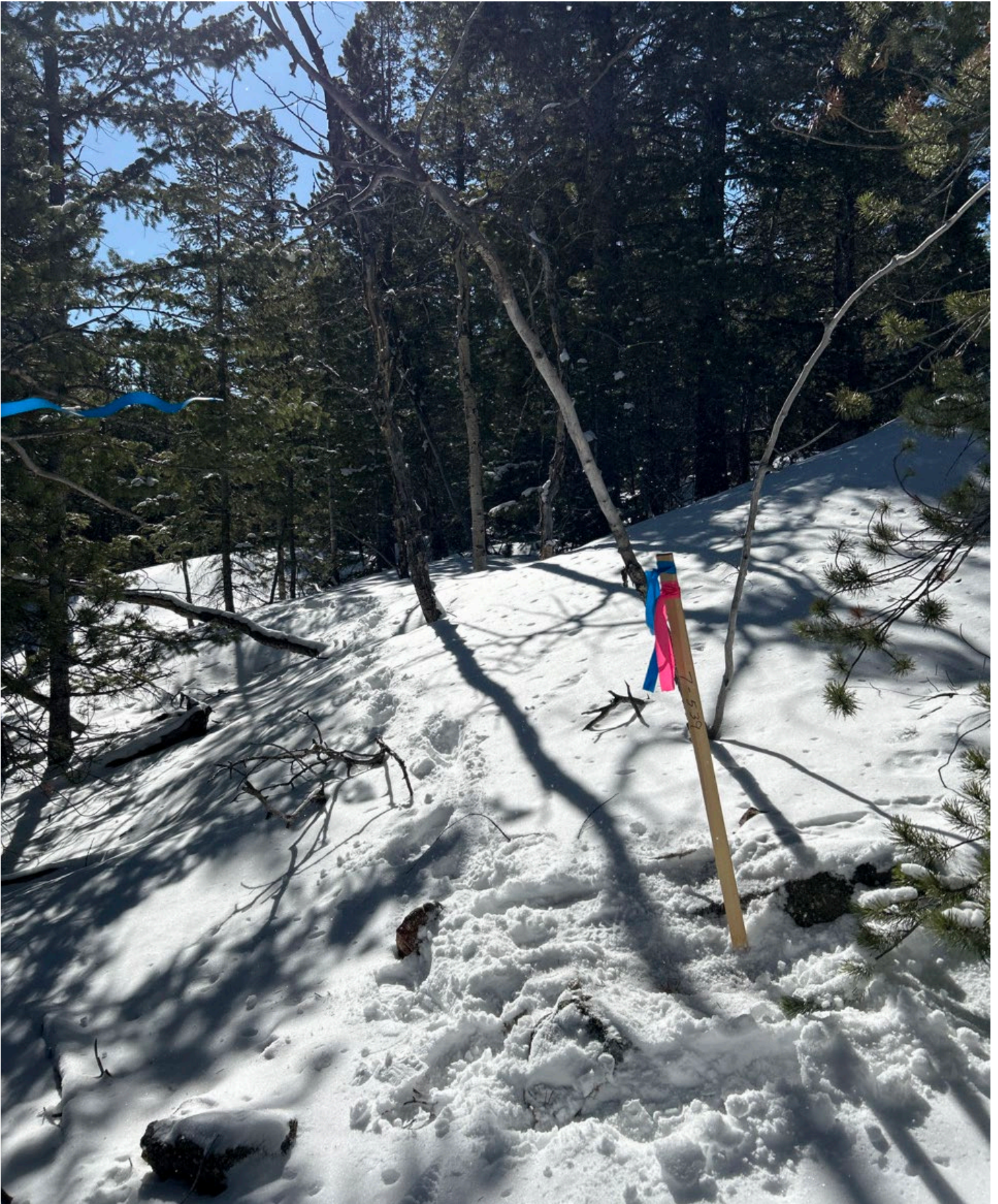
Figure 4: (457)