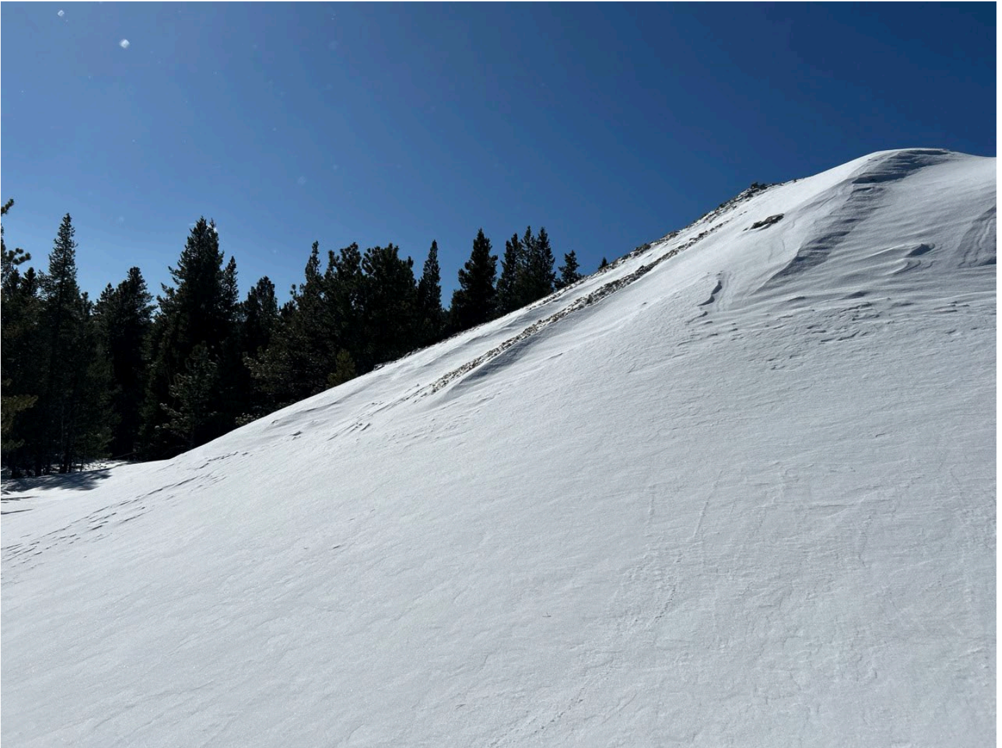
Figure 10: Eastern edge of large waste pile (462)