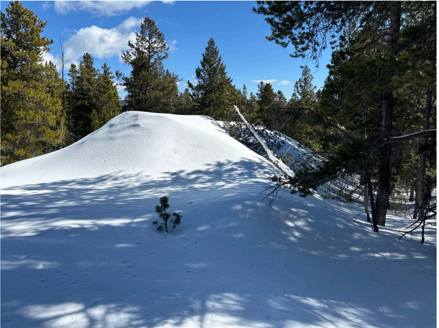
Figure 13: Small waste pile (468)

Greg Smith, Harold (Jay) Lesser CRS LLC 64 Hyland Dr Unit B Evergreen, CO 80439