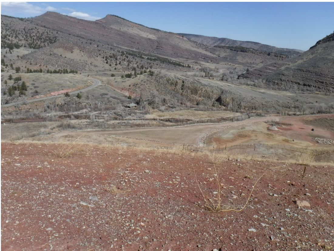
Photo 8: Overview of staging area and floodplain looking north-northeast