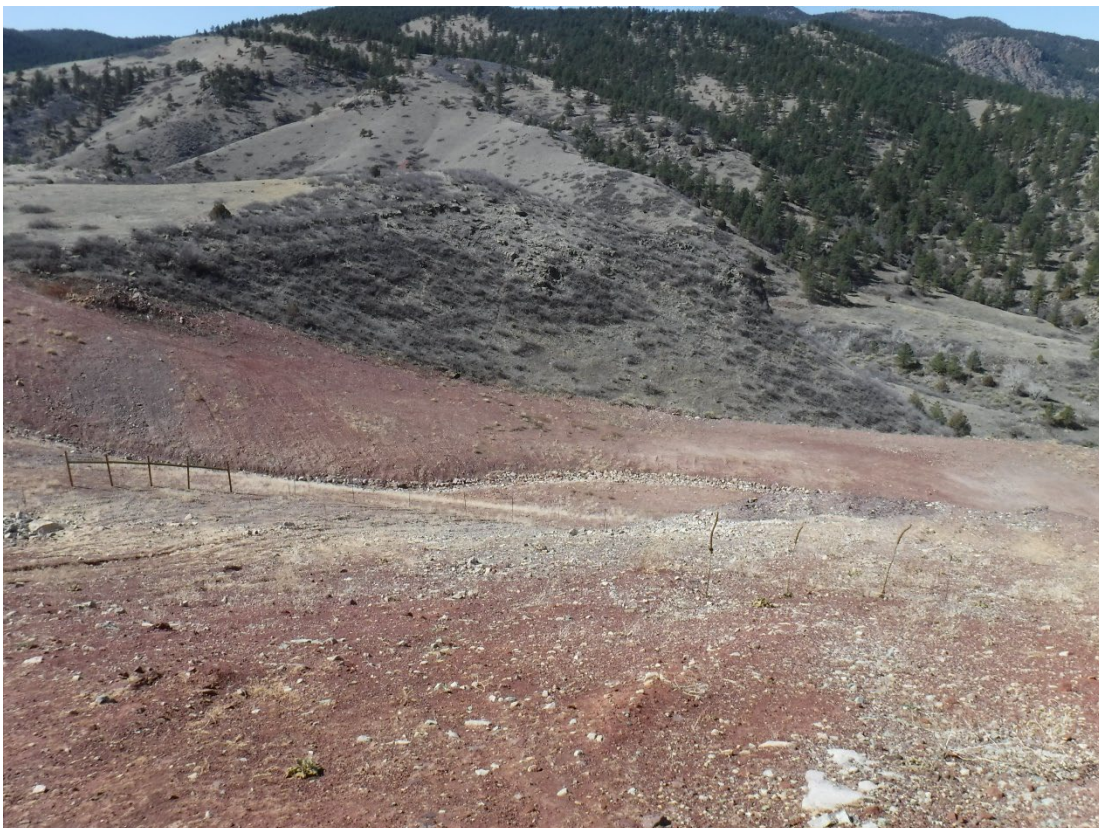
Photo 10: Backfilled and revegetated pit area on the west side of permit