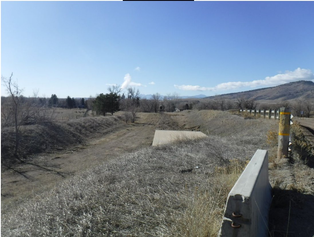
Photo 1: A view looking south along the conveyor belt corridor, the tunnel over highway is center of picture.