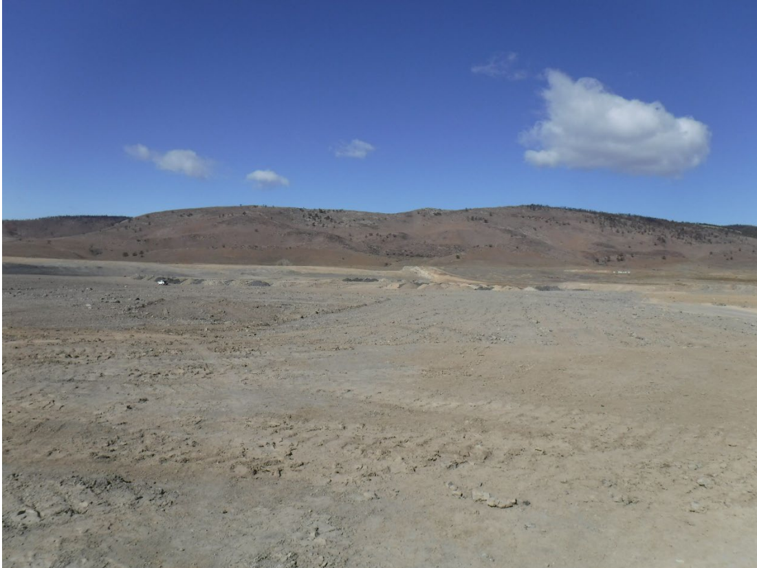
Photo 5: Area to the north of the open pit that has been rough graded, looking west