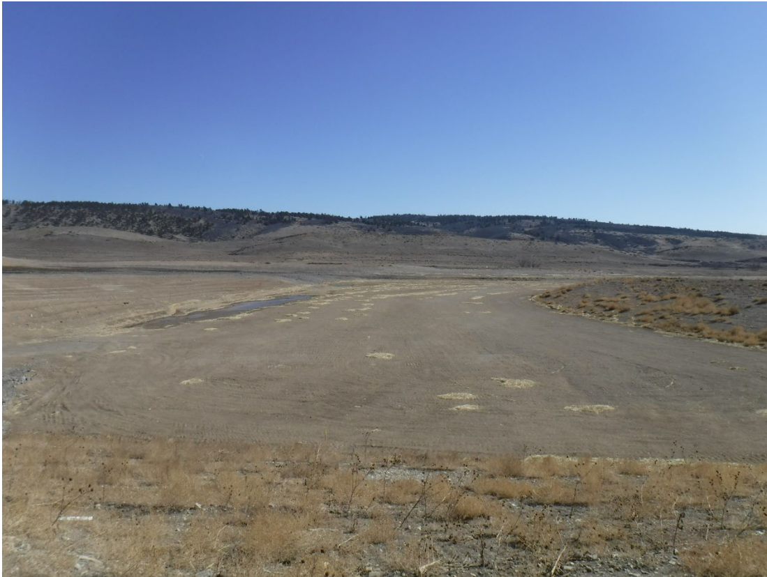
Photo 7: Former pit area that has been backfilled and brought to final grade and seeded, looking east