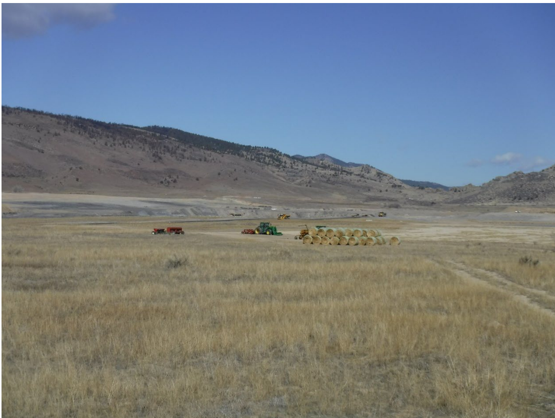
Photo 8: Areas to the right of the picture have been backfilled and final graded to the left are areas that are being backfilled