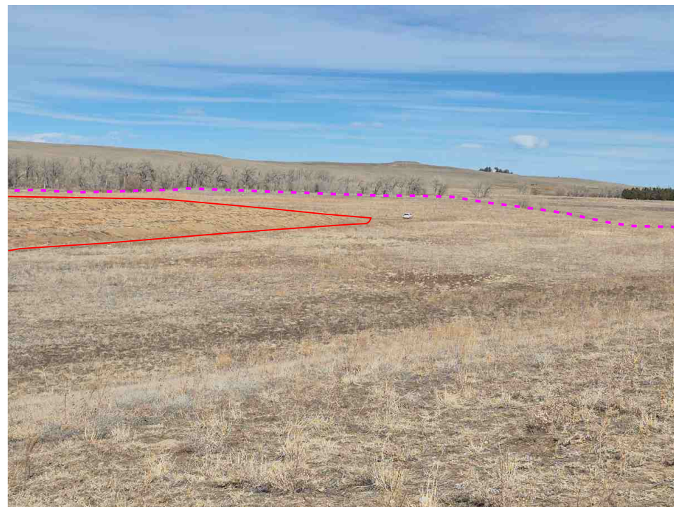
Photo taken from the middle of east slope of the pit basin. View is to Northwest