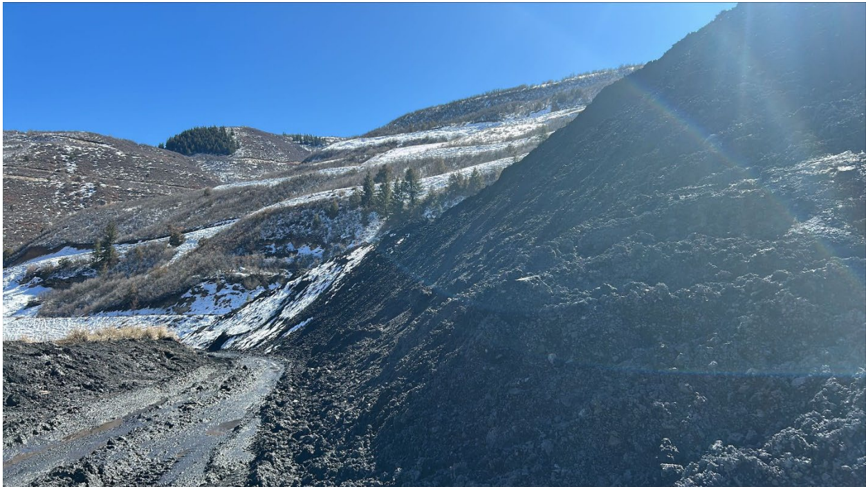
Figure 2: RPE, south edge

Number of Partial Inspection this Fiscal Year: 6