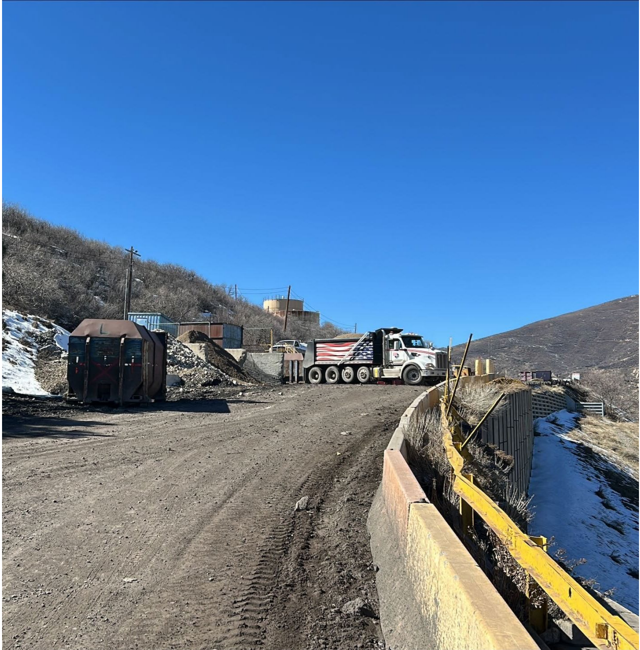
Figure 7: Aggregate storage area

Number of Partial Inspection this Fiscal Year: 6