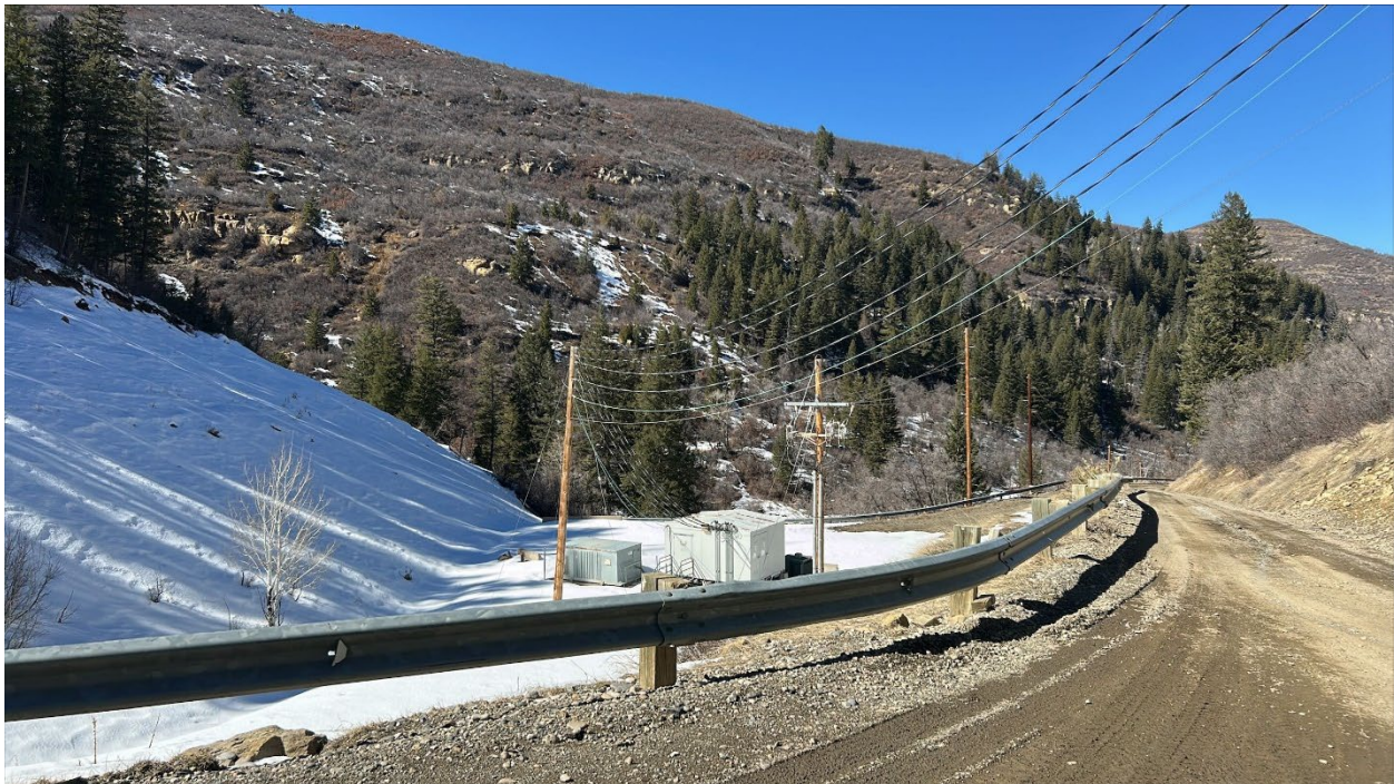
Figure 4: Vie to the south from Shaft 3

Number of Partial Inspection this Fiscal Year: 6