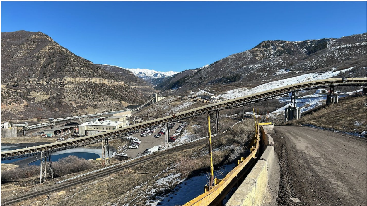
Figure 6: Overview of facilities

Number of Partial Inspection this Fiscal Year: 6