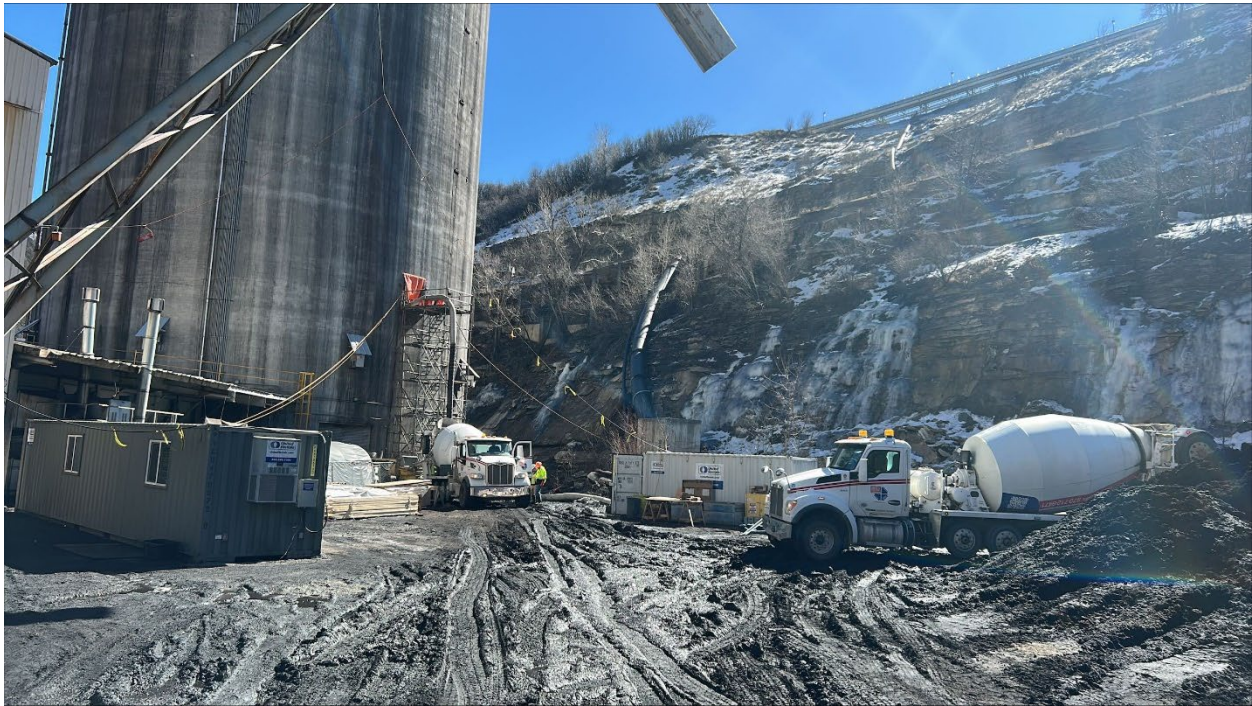
Figure 1: Work in progress on Silo 2