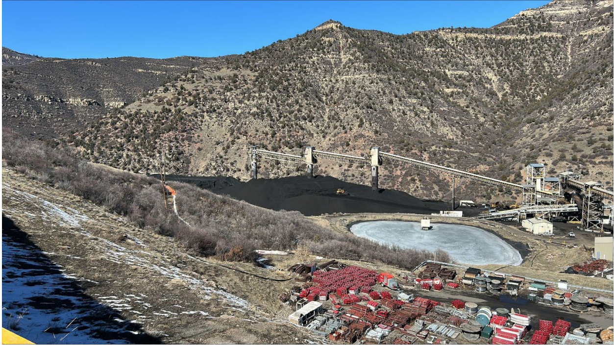
Figure 5: Run-of-mine coal stockpile