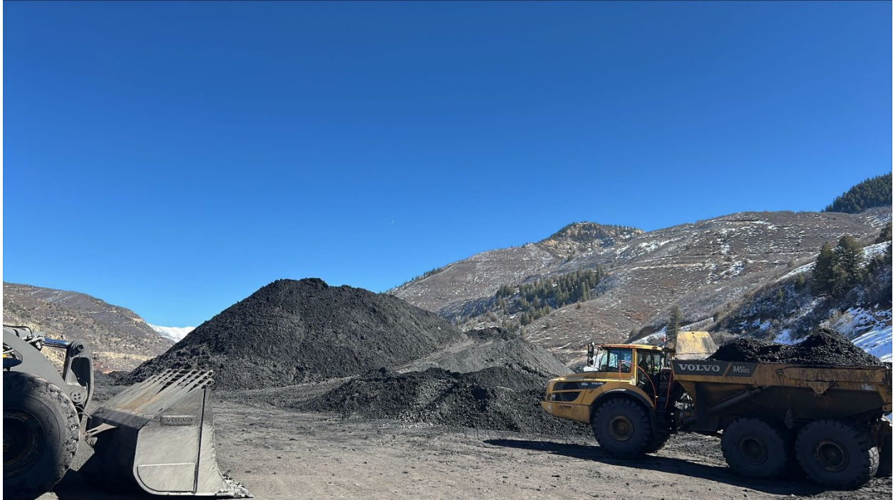
Figure 3: Temporary waste pile on RPE