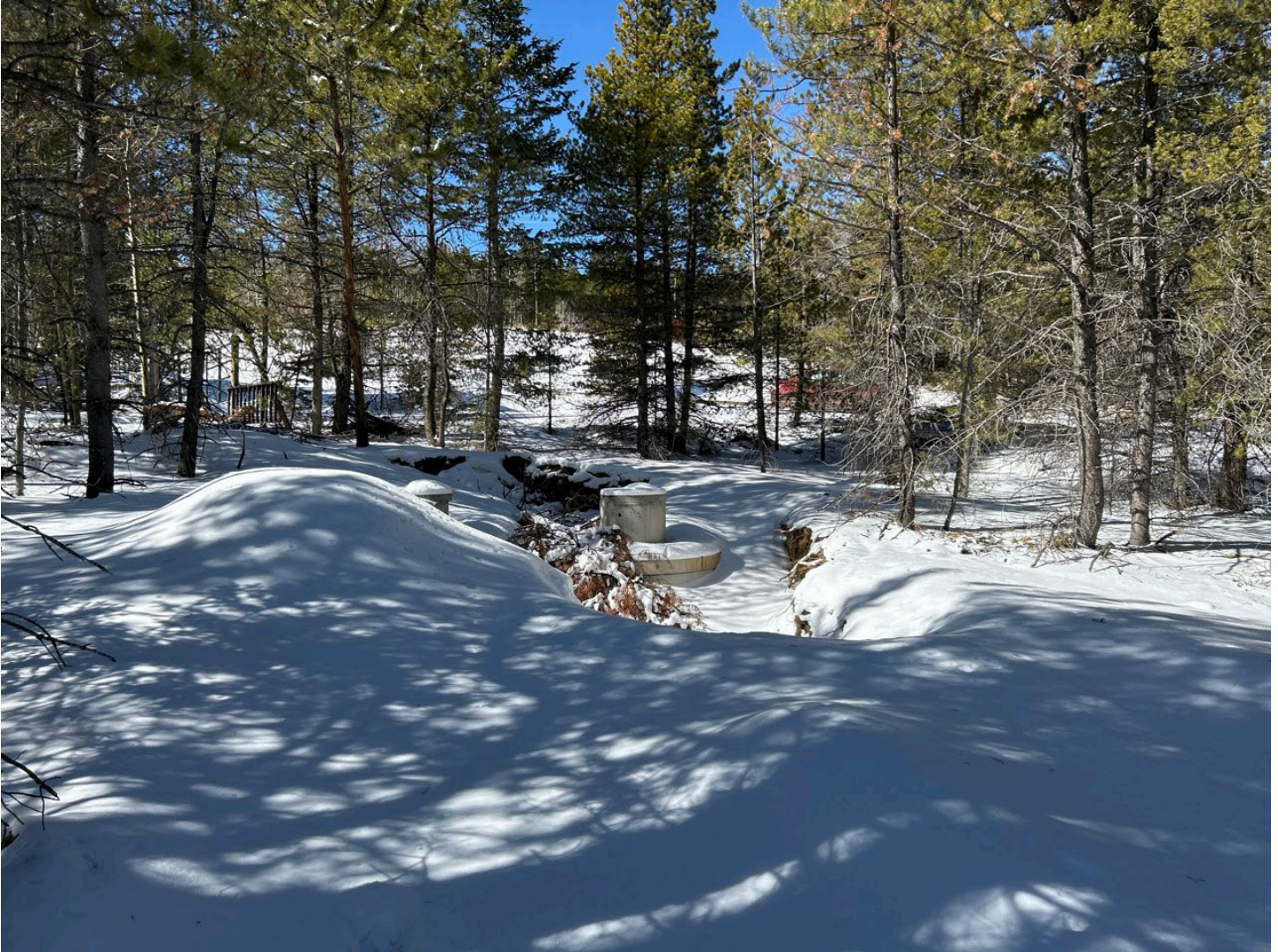
Figure 9: 475 - residential construction in progress