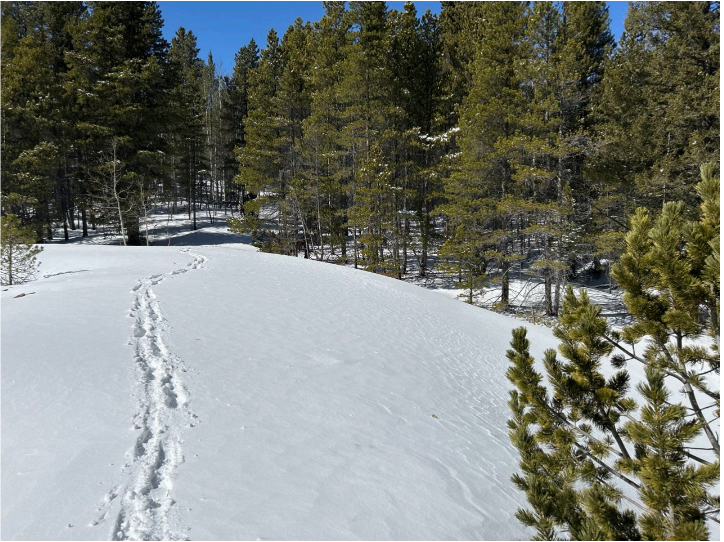
Figure 6: 473b