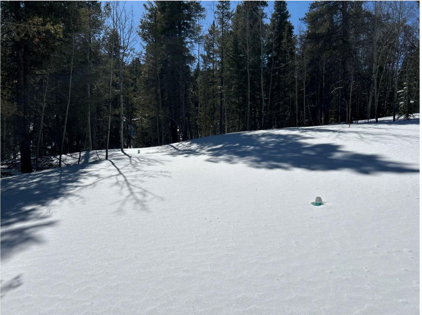
Figure 4: 472 - evidence of septic system installed by landowner