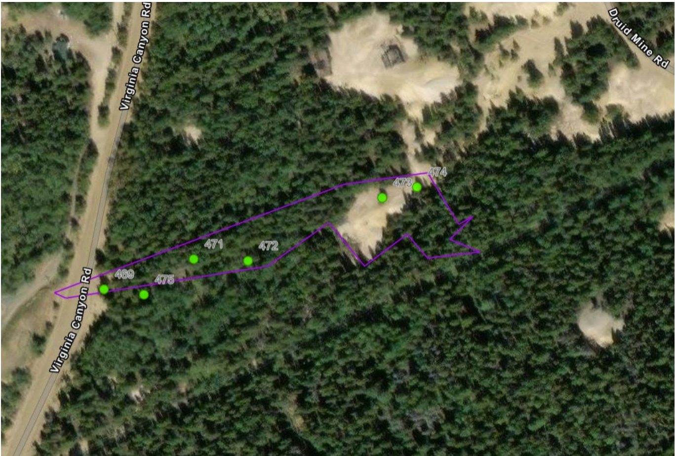
Figure 1: Screenshot of field map used during the inspection, with approximate permit boundary in purple, and the locations of photographs taken in green