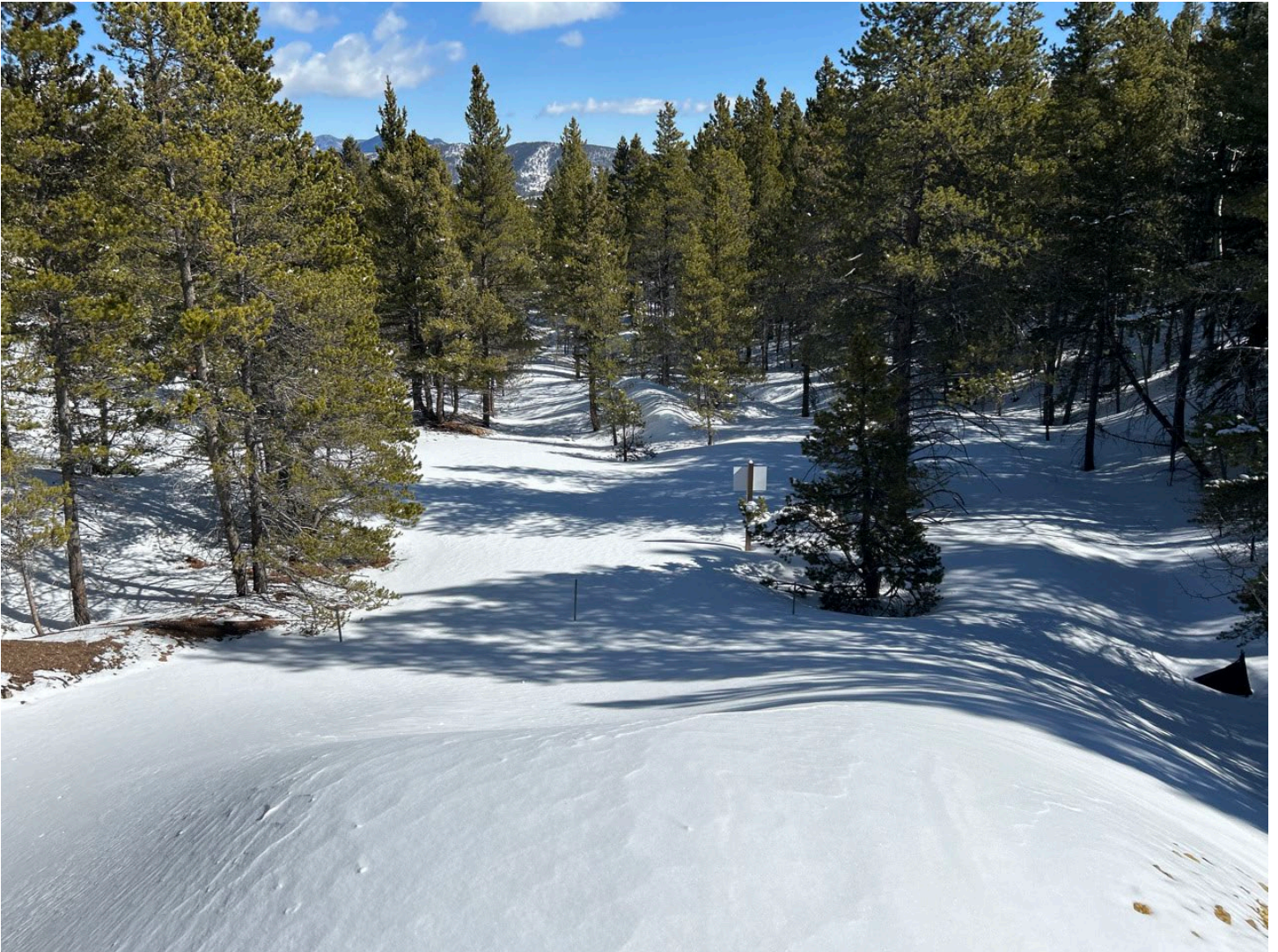
Figure 7: 473c