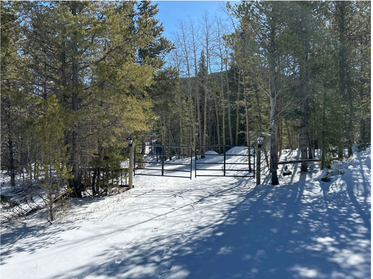
Figure 2: 469 - entrance to the site off Virginia Canyon Road