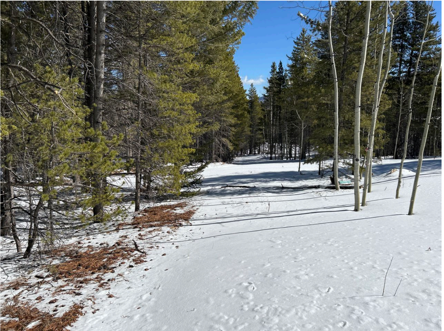
Figure 3: 471