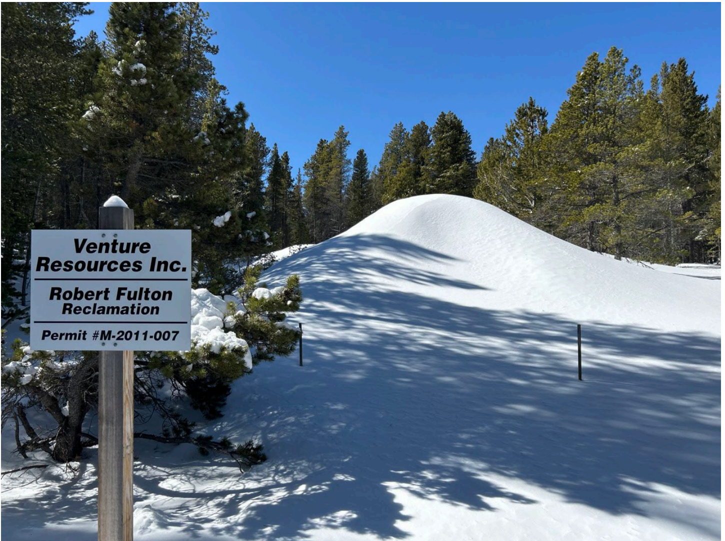
Figure 8: 474, Mine ID sign and historic waste pile from eastern boundary of permit area