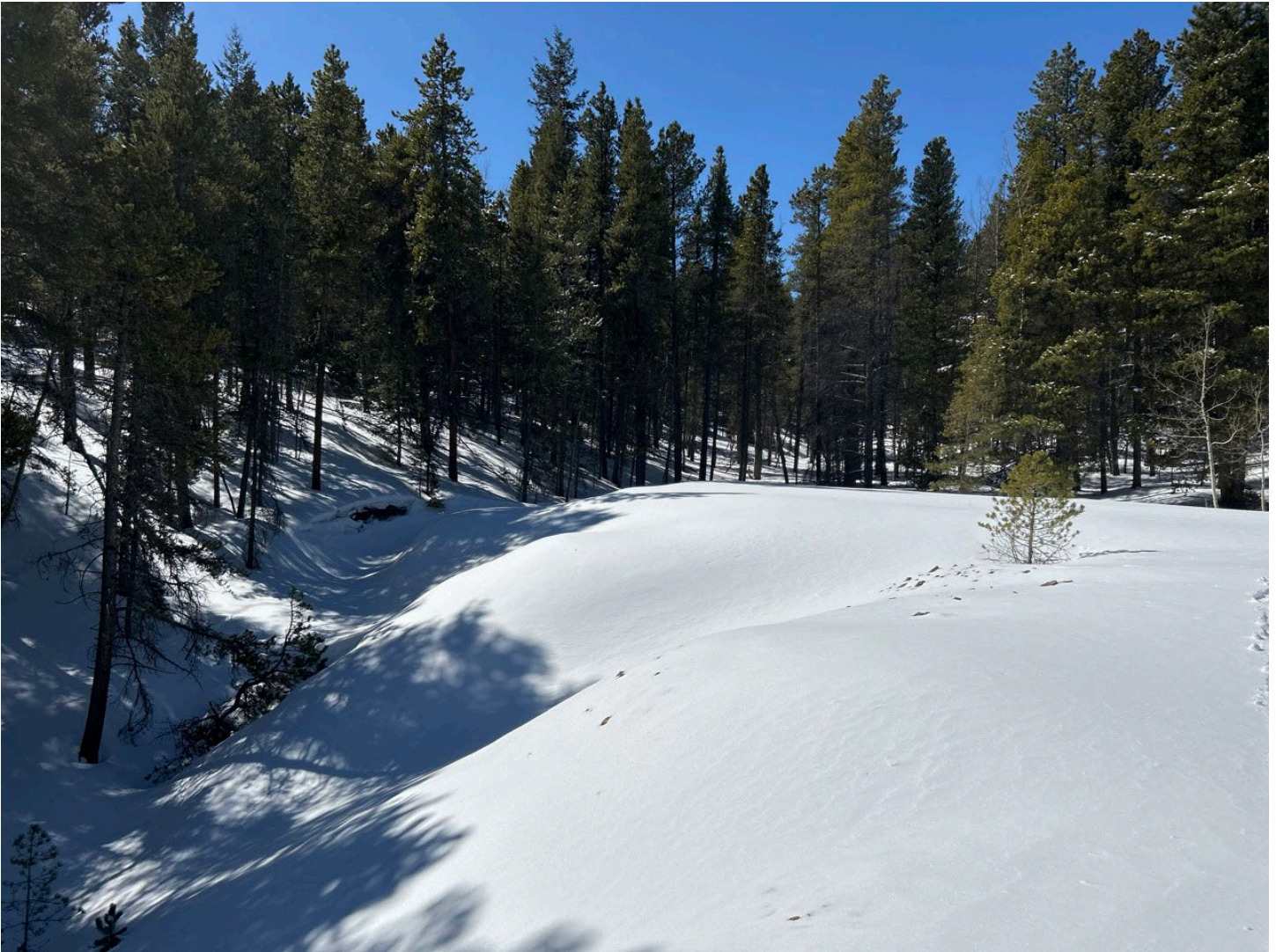
Figure 5: 473a - historic waste pile