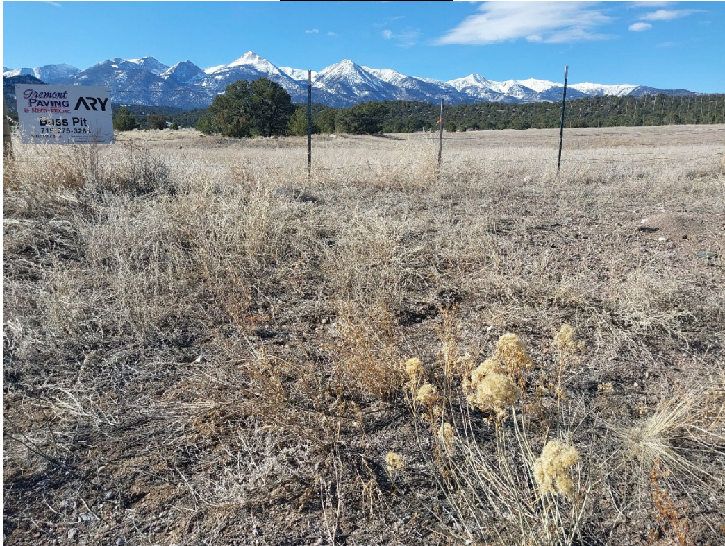
Photo #1: Mine sign (left side of the image), as required by Rule 3.1.12(1), located adjacent to what was the pit entrance. The area is now fenced off and inaccessible.