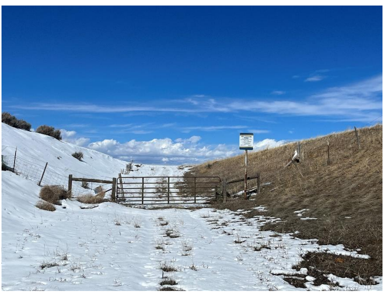
Photo 1: Williams Fork mine identification sign at the entrance from Highway 13.