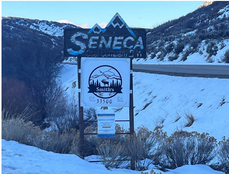
Photo 1: Mine identification sign at entrance from County Road 53.

Number of Partial Inspection this Fiscal Year: 5