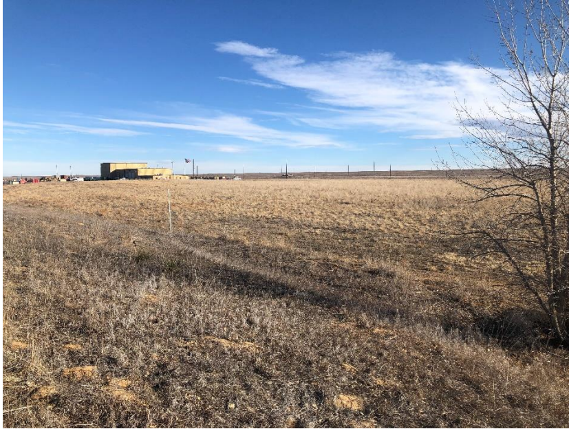
Area 38, looking northeast