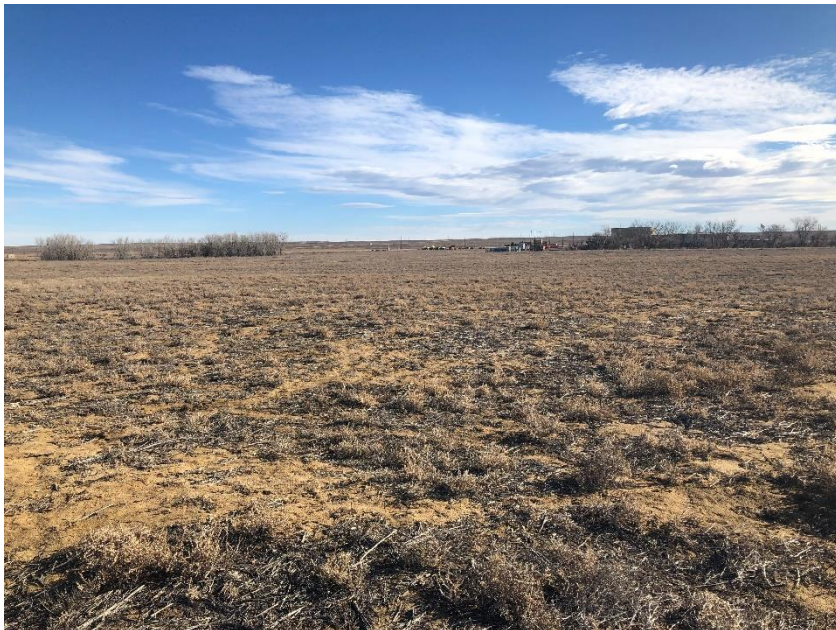
Area 25, looking northeast

Number of Partial Inspection this Fiscal Year: 5