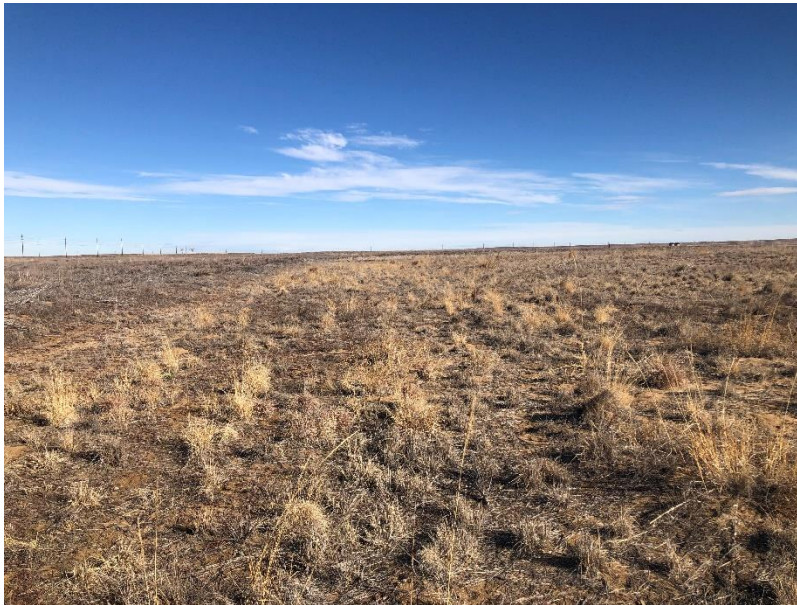
West side of disturbance area, looking north from Area 44

Number of Partial Inspection this Fiscal Year: 5