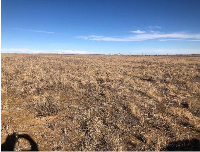
Area 36 (Long Term Spoil Area), center of area, looking northwest