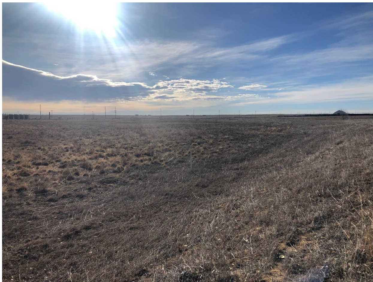
Area 34, looking southeast

Number of Partial Inspection this Fiscal Year: 5