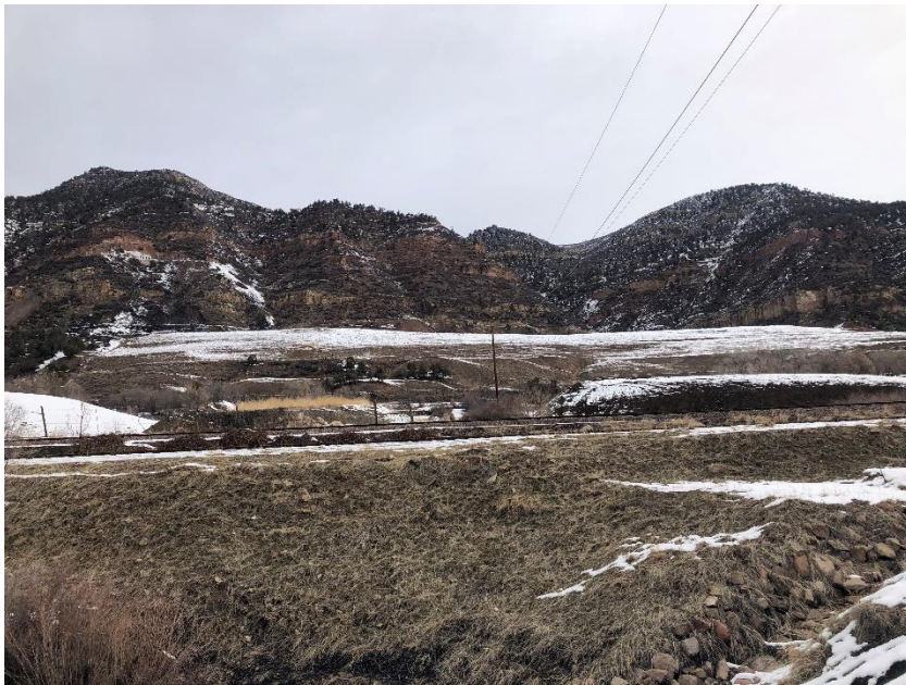
West portion of Gob Piles 1, 2, and 4 (from Pond J)

Number of Partial Inspection this Fiscal Year: 5