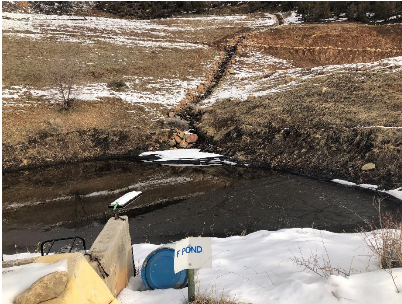
Pond F with significant sediment recently deposited