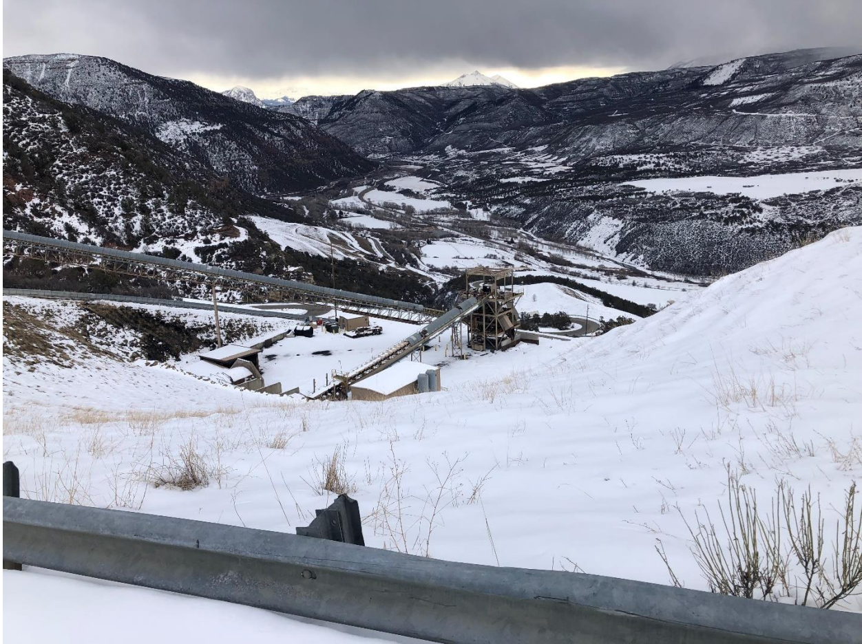
B Portal Bench and Gob Piles 1, 2, and 4 (in background)

Number of Partial Inspection this Fiscal Year: 5