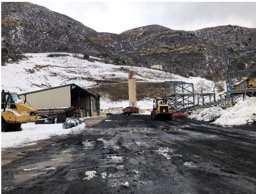
D Portal Bench and slope below Utility Bench

Number of Partial Inspection this Fiscal Year: 5