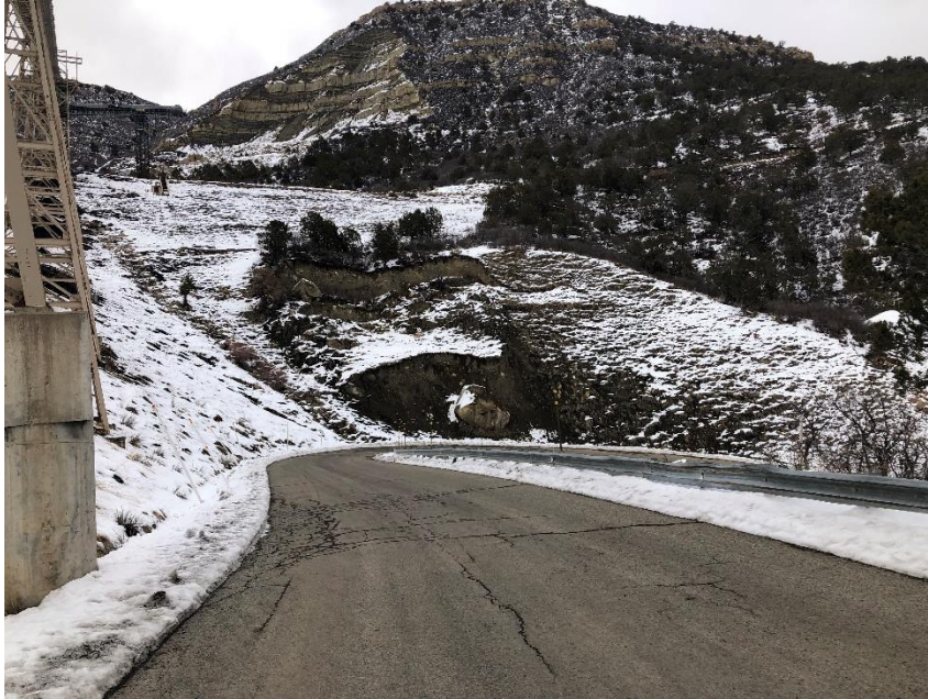
Curve 10 Slide