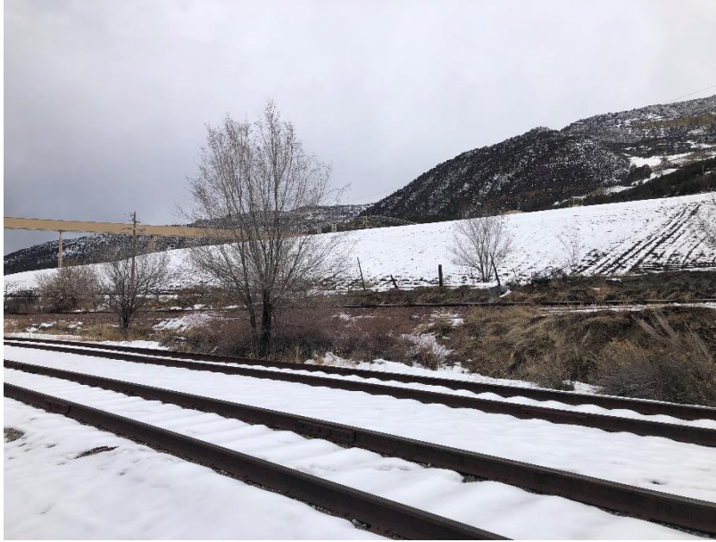
South side of Gob Pile 3 (from loadout area)