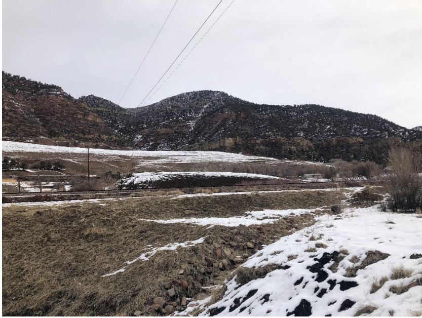
East portion of Gob Piles 1, 2, and 4 (from Pond J)