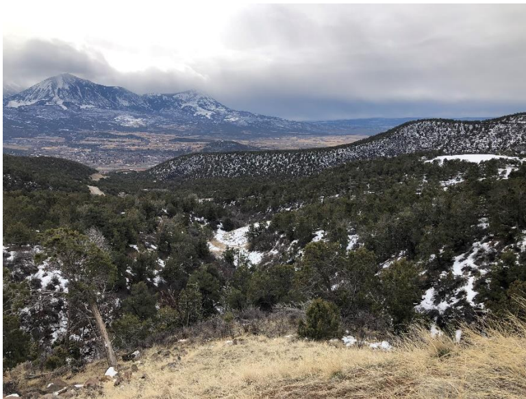
Area near reclaimed Ponds 3 and 4 at East Mine

Number of Partial Inspection this Fiscal Year: 5