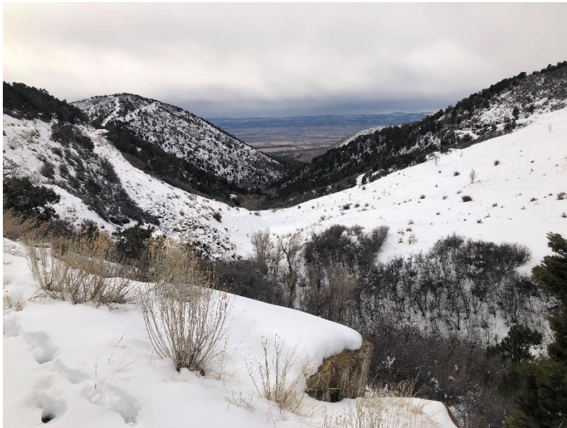
West Mine ponds

Number of Partial Inspection this Fiscal Year: 5