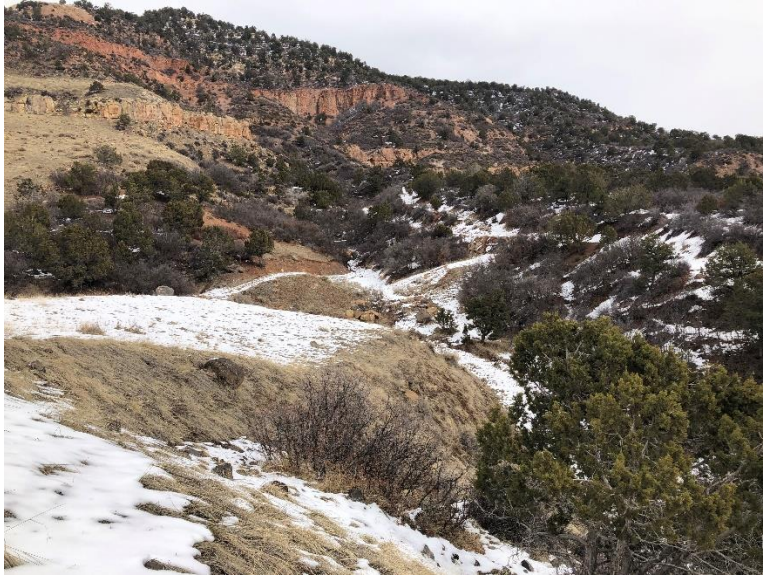
Reclaimed Pond 1 at East Mine