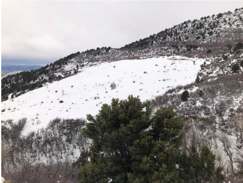
West Mine – road along north side