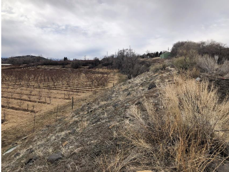
Loadout slope above orchard