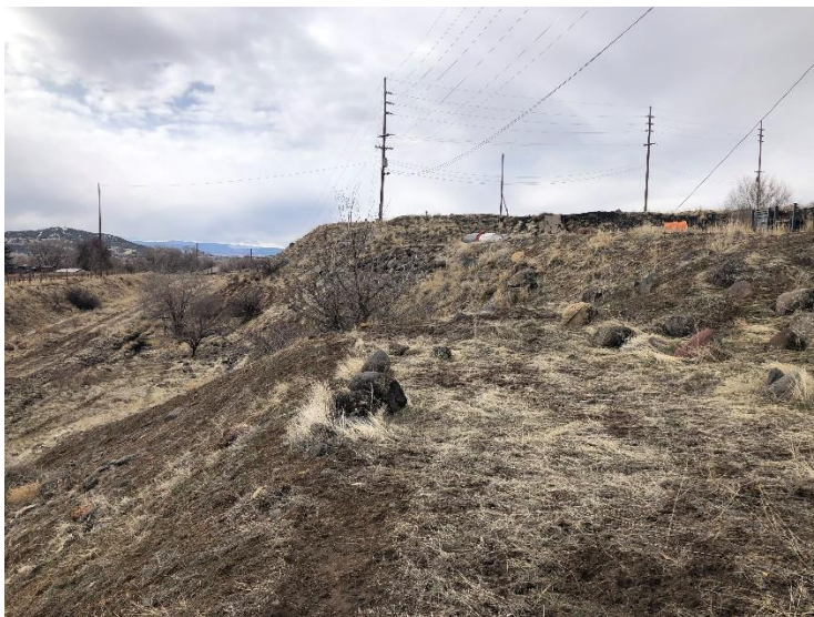
Slope near southwest corner of loadout

Number of Partial Inspection this Fiscal Year: 5