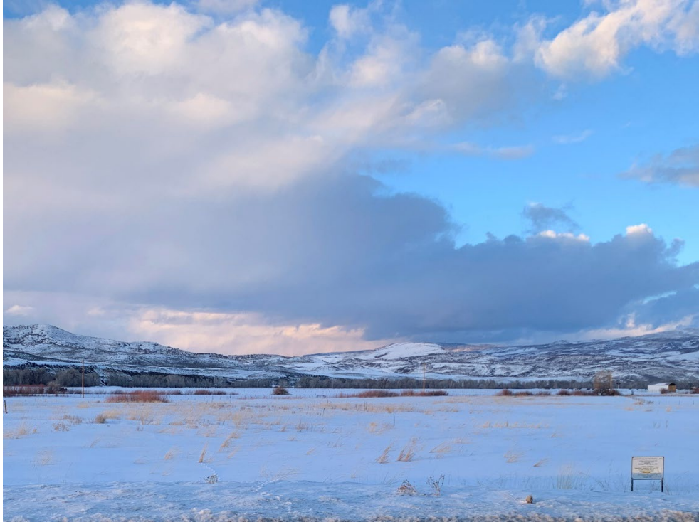
Photo 1- Reclaimed area north of Hwy 40