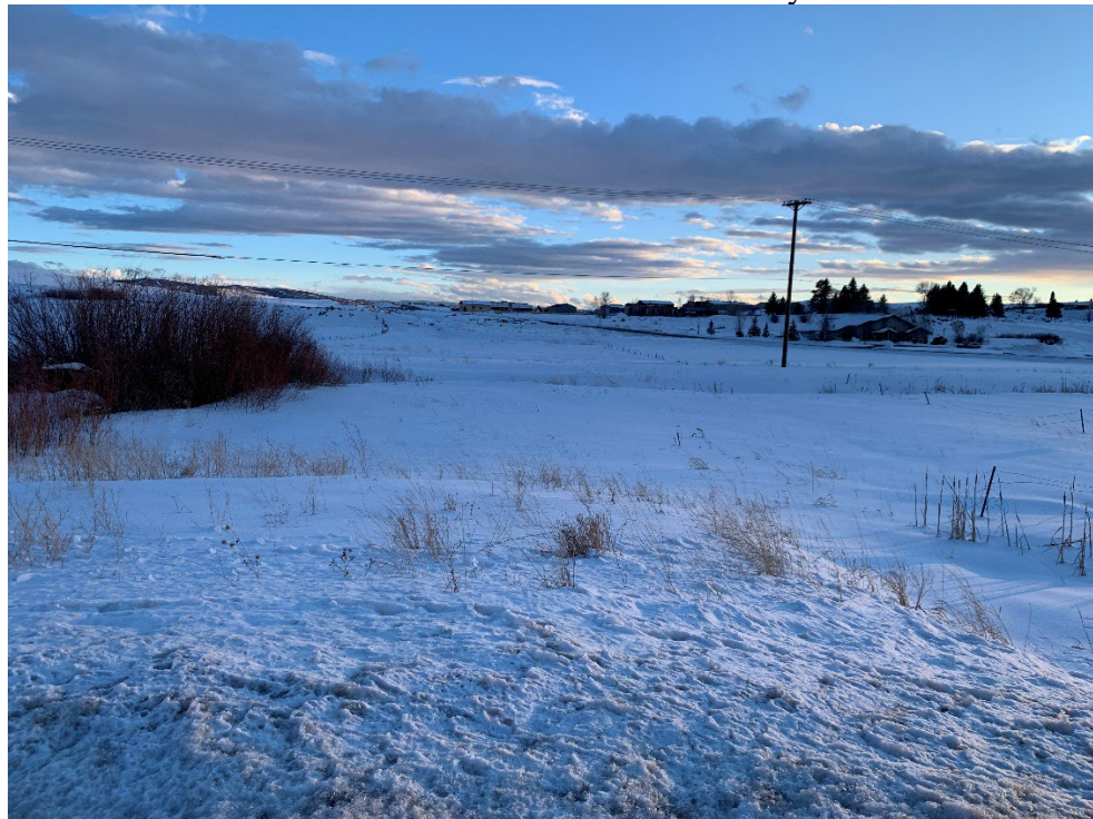
Photo 2- Reclaimed area south of Hwy 40

Number of Partial Inspection this Fiscal Year: 5