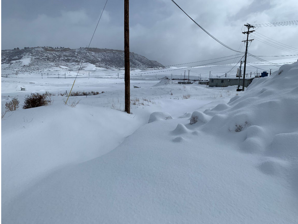
Photo 4- Ditch E-1 behind the warehouse is cleared