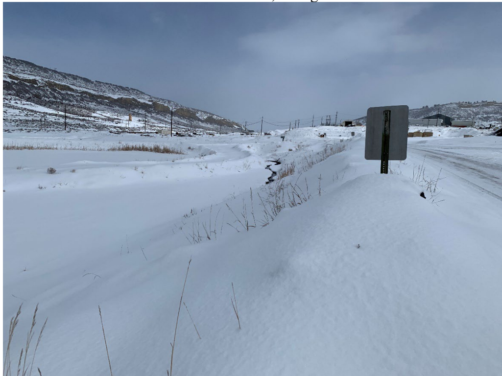
Pond 3- Pond E, facing east

Number of Partial Inspection this Fiscal Year: 5