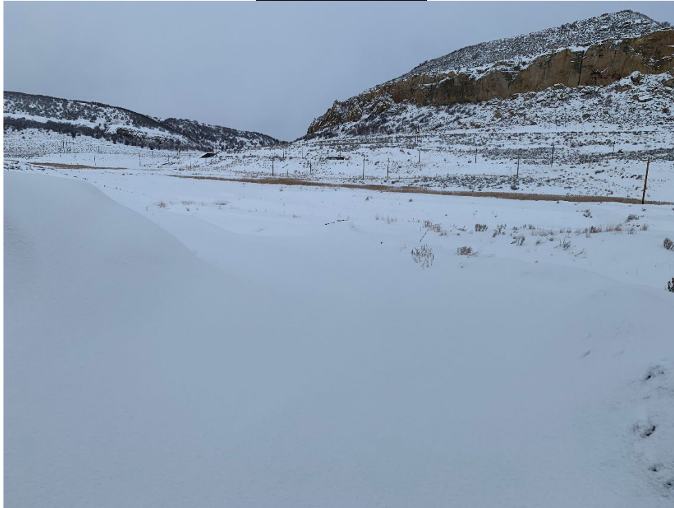
Photo 1- Pond B discharge location, facing northwest toward Foidel Creek

Number of Partial Inspection this Fiscal Year: 5