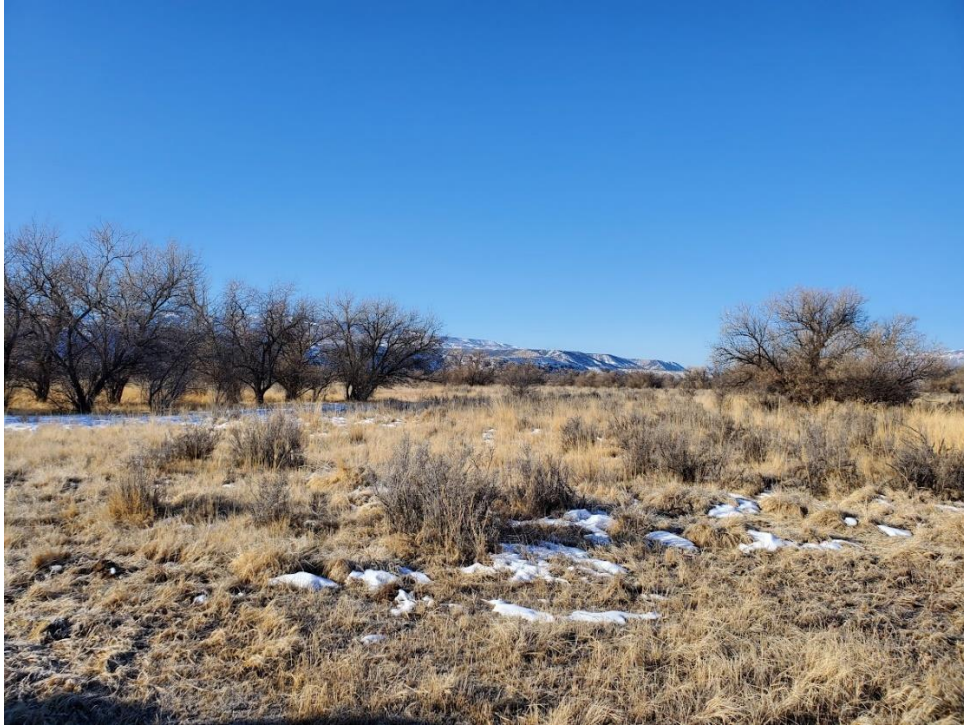
Photo 3 – View to the southwest of undisturbed ground across the permit area.