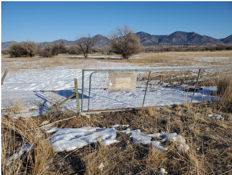
Photo 4 – View to the north of missing Mine ID sign at the entrance to the site.