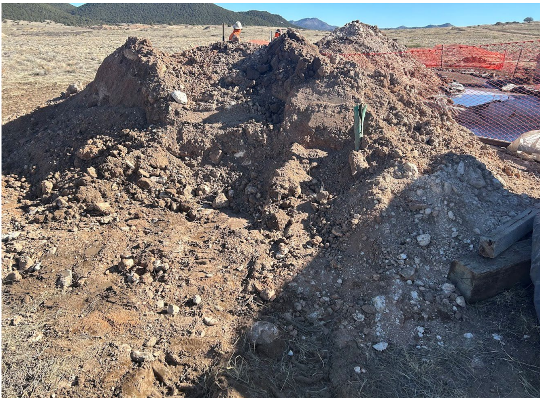
Photo 12: View of overburden stockpiles to the north of the mud pits.