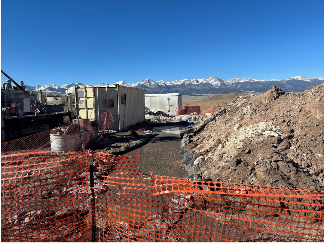
Photo 11: View of the mud pits, overburden stockpiles to the north, storage container, and horse trough containing machinery fluids.