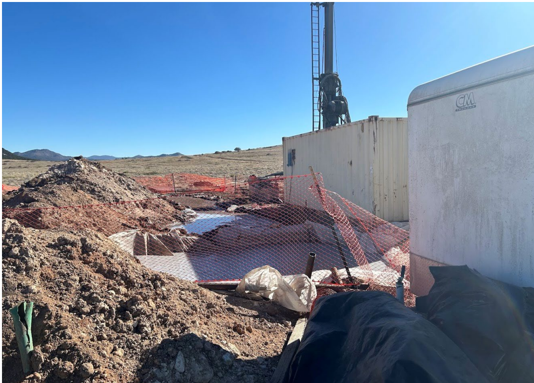
Photo 10: View of two mud pits contained within snow fencing, facing east.