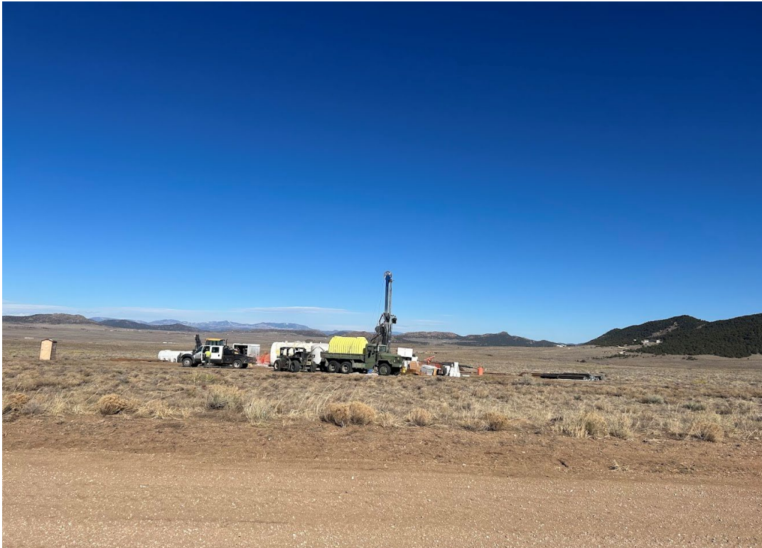
Photo 2: View of the drilling project and County Road 240, facing north.