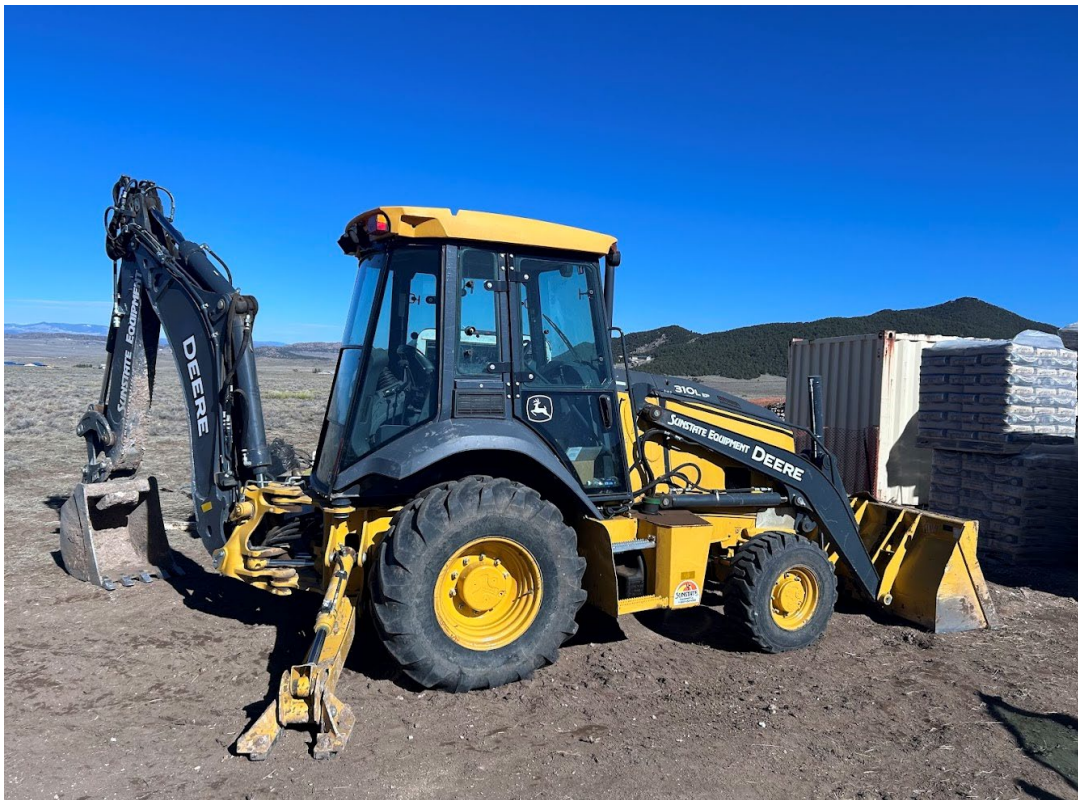
Photo 8: Excavator and loader combo equipment within permit area, facing south.