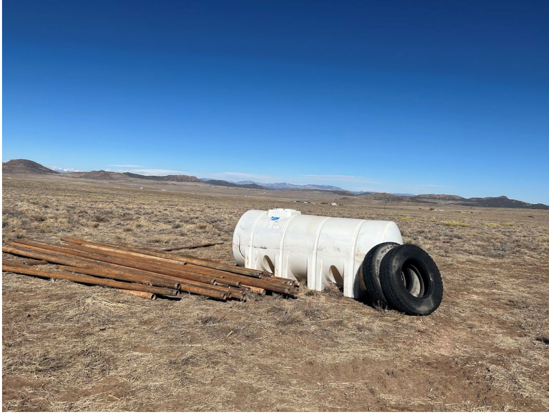
Photo 9: Empty water storage container, tires, and drilling piping along the northern extent of permit area, facing north.