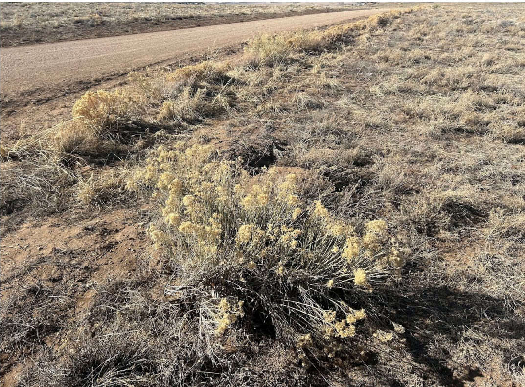
Photo 4: Native vegetation along County Road 240, facing southwest.