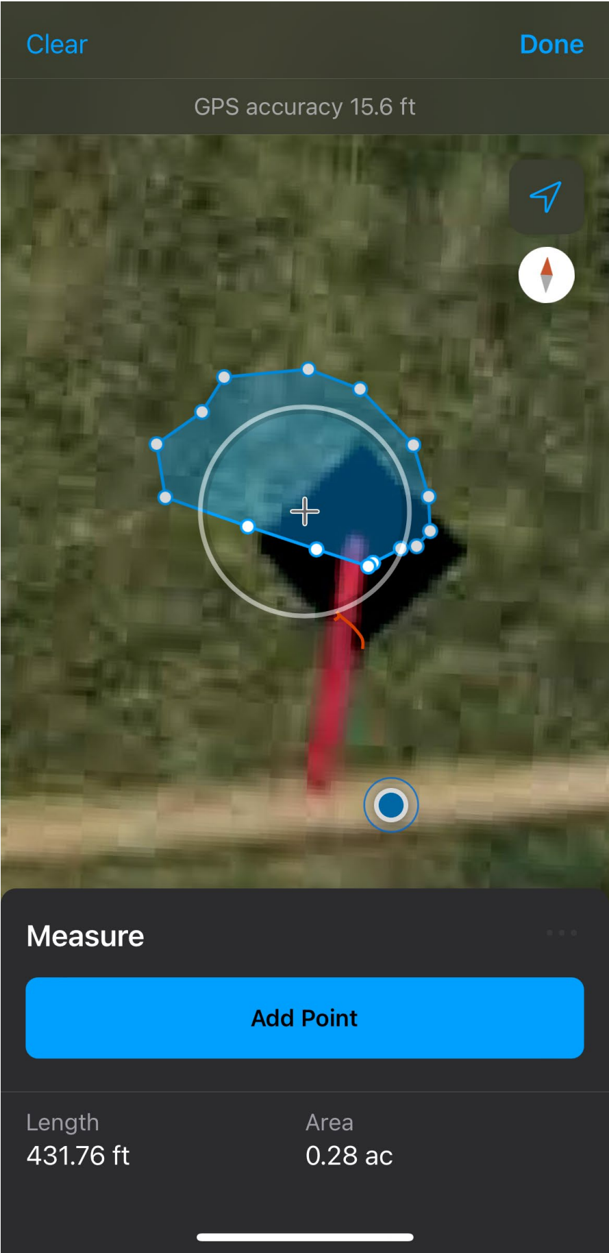
Photo 13: Imagery of affected acreage polygon collected using Arc Field Maps. Collected on 2/7/2025.