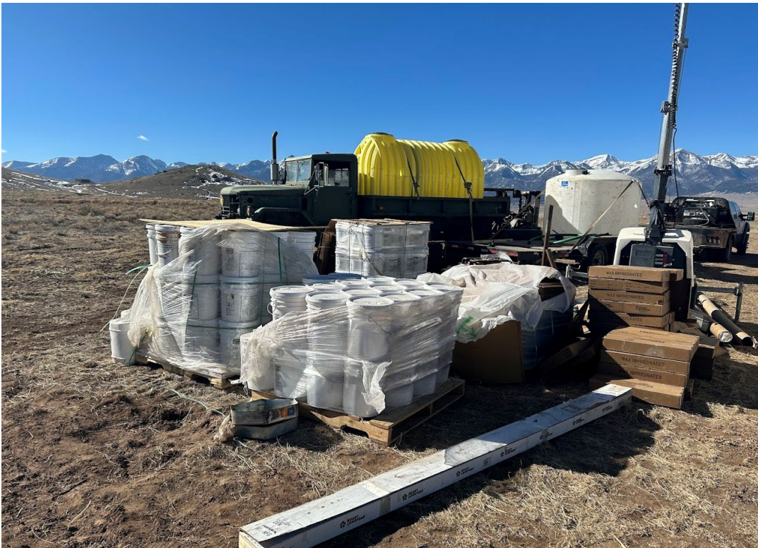
Photo 6: View of the containers with drilling fluids, utility truck, and lights, facing west.