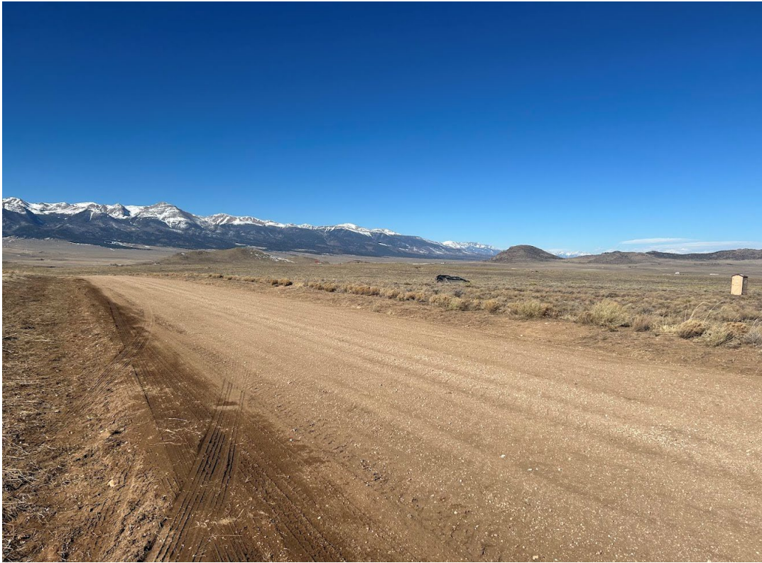
Photo 1: View of County Road 240 to the south of the drilling project, facing west.