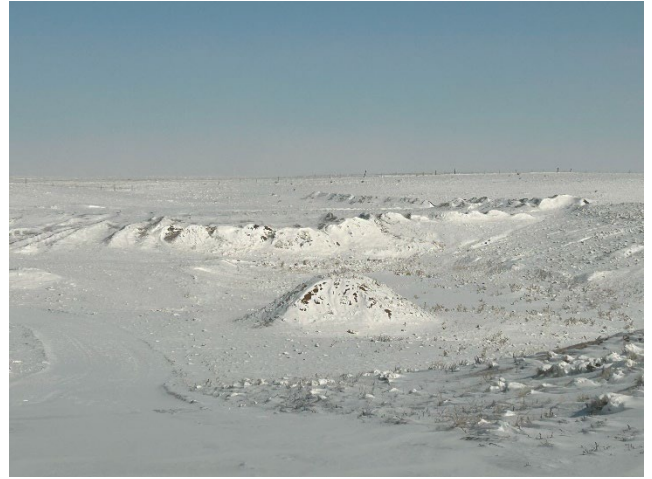
Photo 2: Representative photo of pit floor and associated product stockpiles.