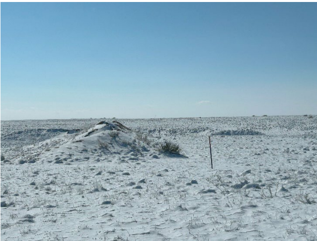
Photo 3: Example boundary marker (right), and example topsoil stockpile (left).