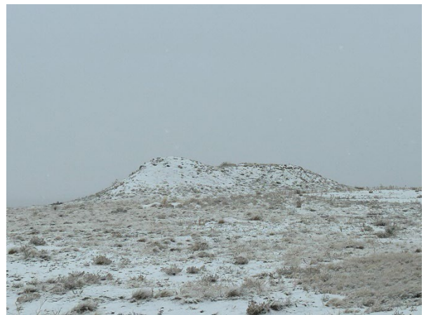
Photo 4: Topsoil stockpile. Appears stable at the time of inspection.