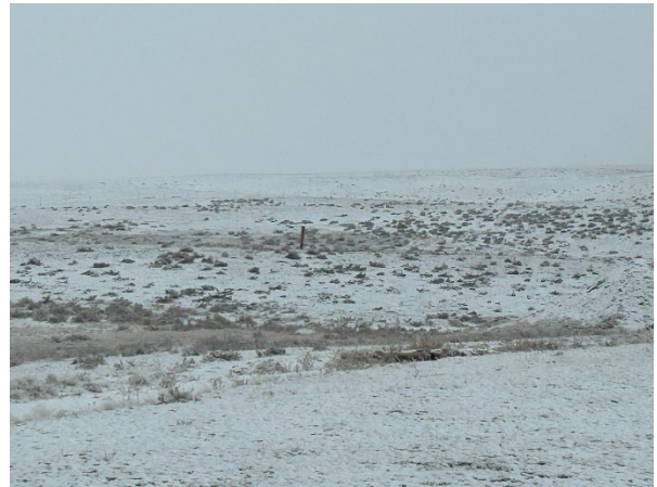
Photo 2: Example site boundary. All bounds were present during inspection.