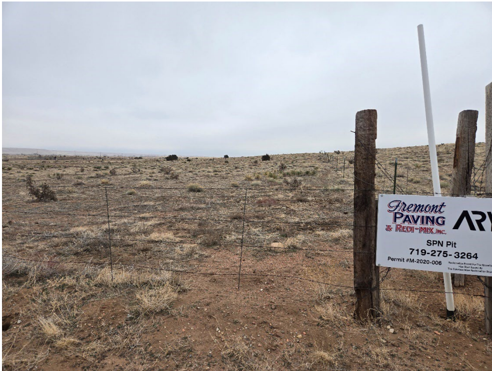
Photo 1: Looking east towards the north/central side of the permit area.